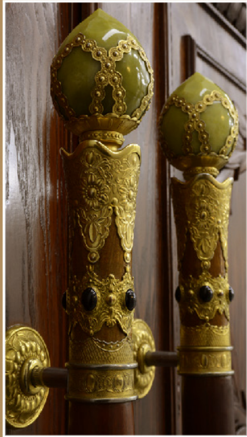
Ornamented door handle