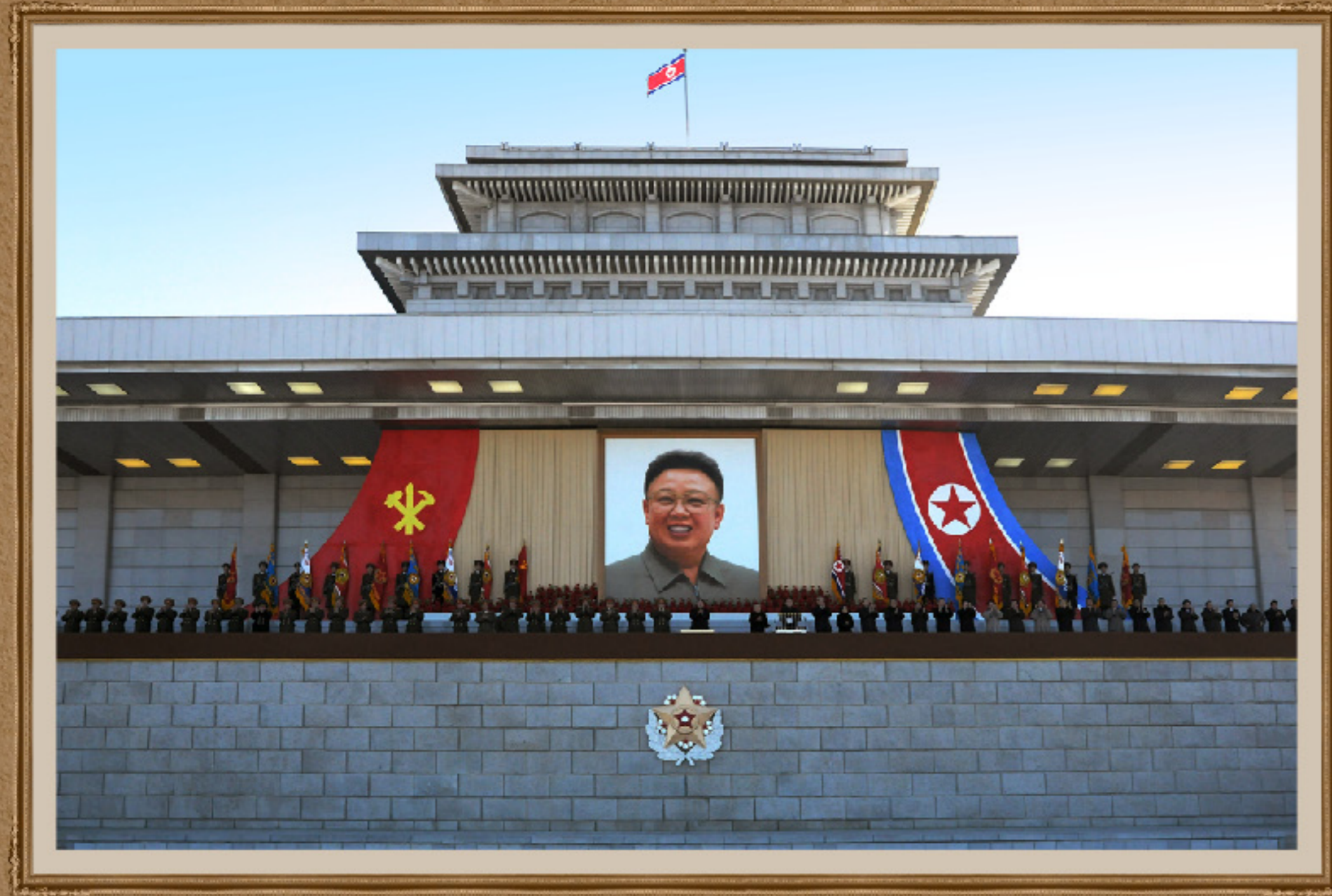
On February 16, Juche 101 (2012), at the Kumsusan Palace of the Sun Plaza, the joint resolution on renaming the Kumsusan Memorial Palace the Kumsusan Palace of the Sun has been made public, followed by a military ceremony of the ground, naval and air forces of the Korean People's Army