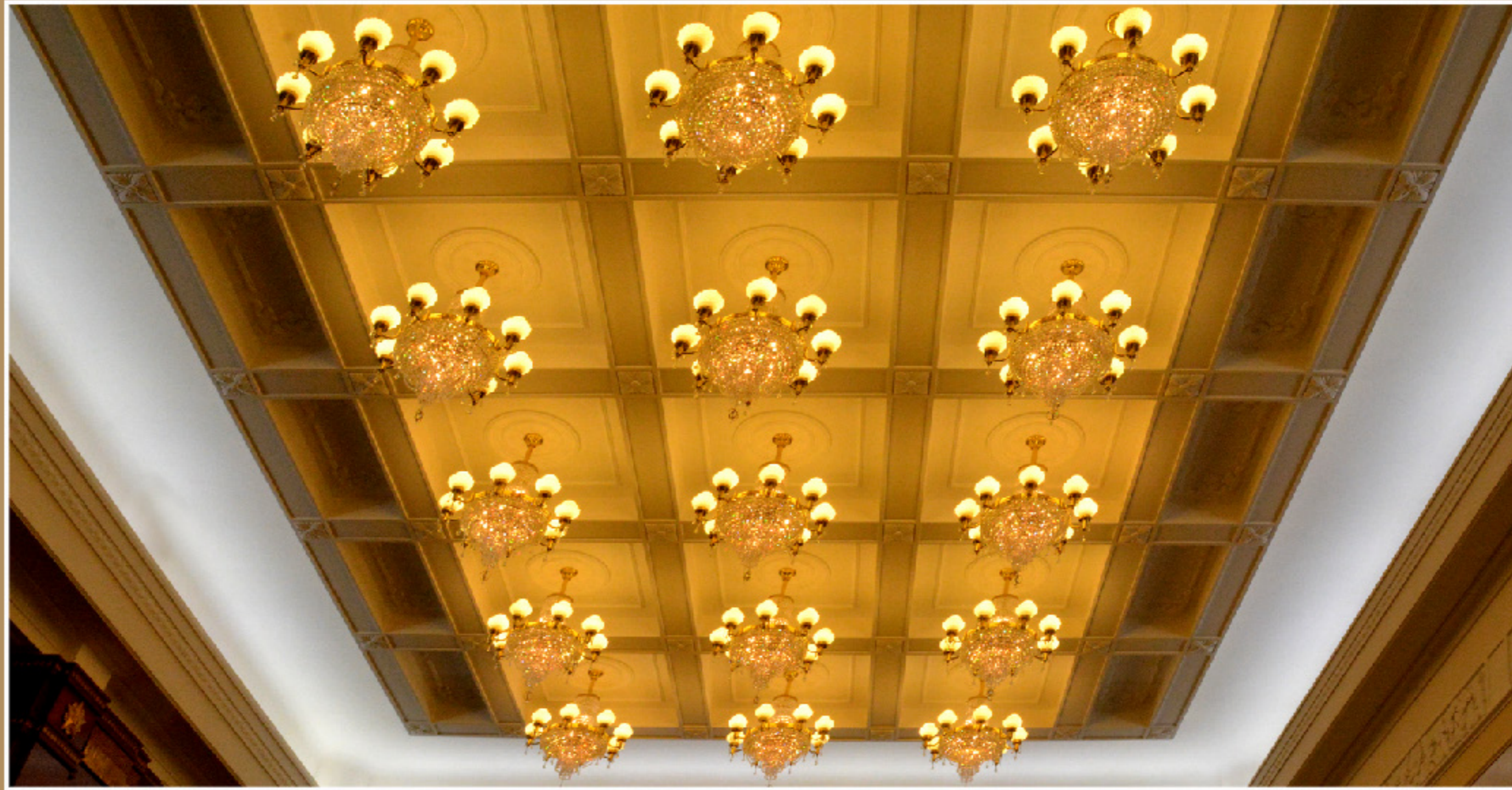
Chandeliers over the grand staircase