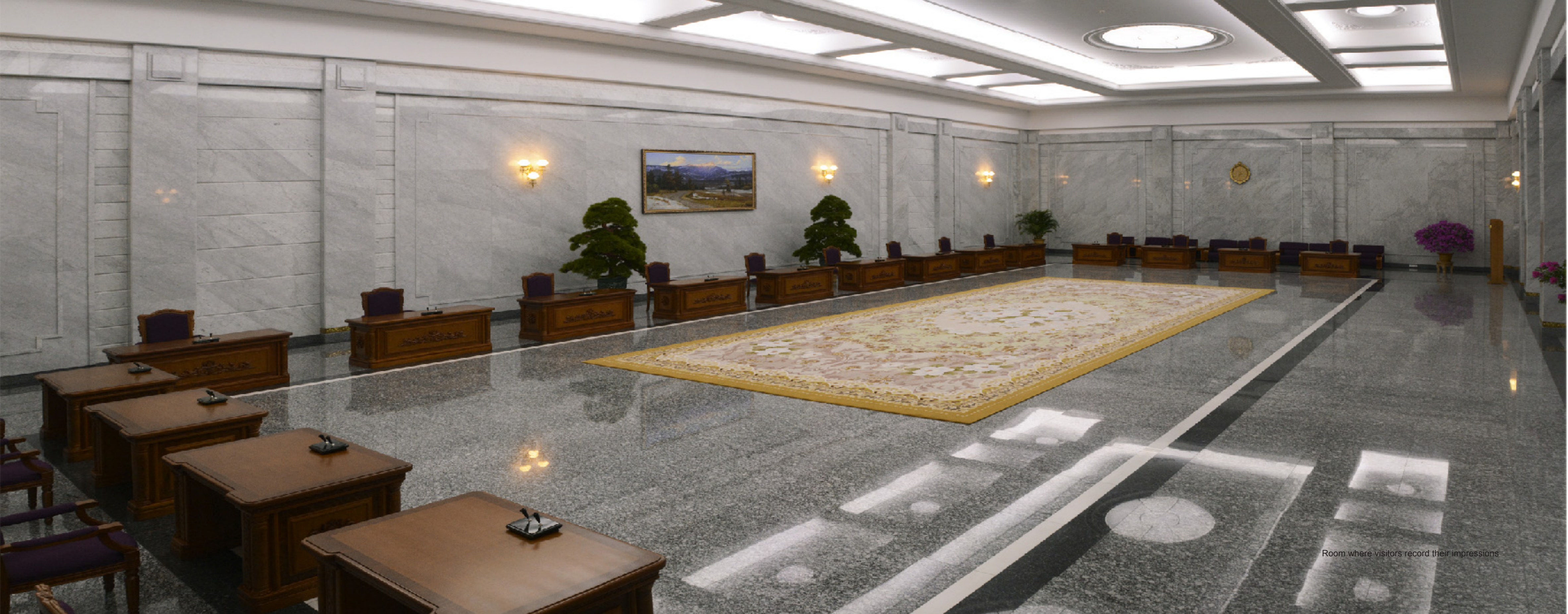
Room where visitors record their impressions