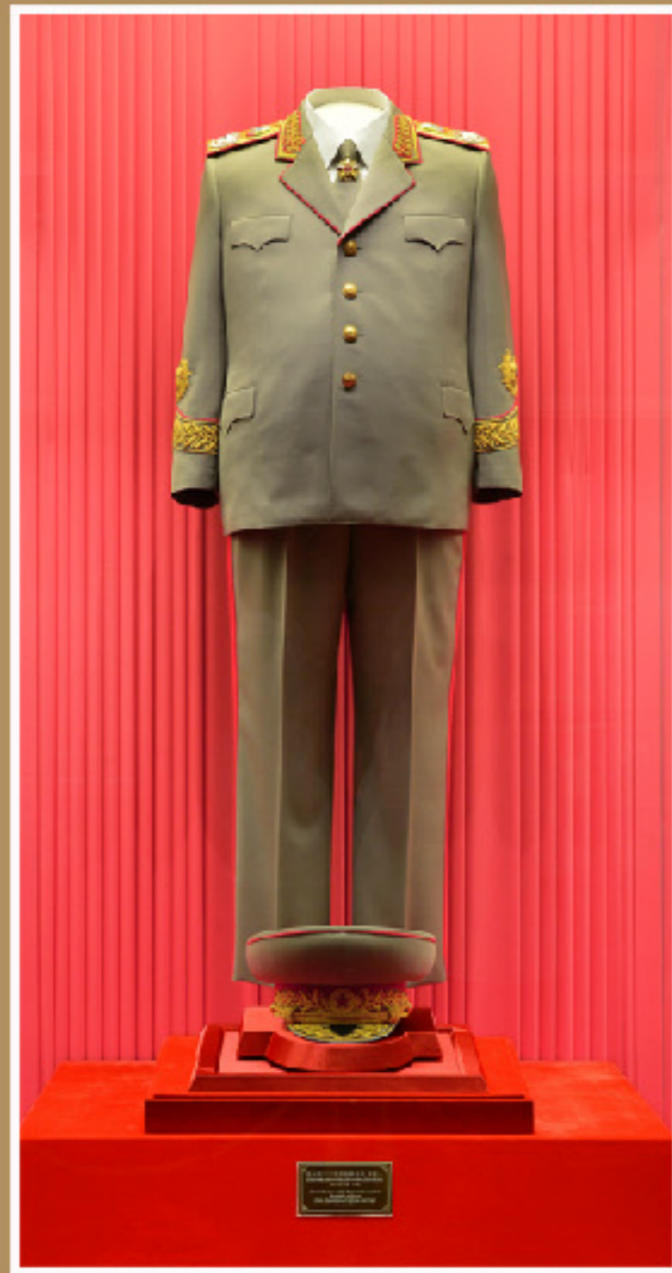
Uniform of Generalissimo of the DPRK