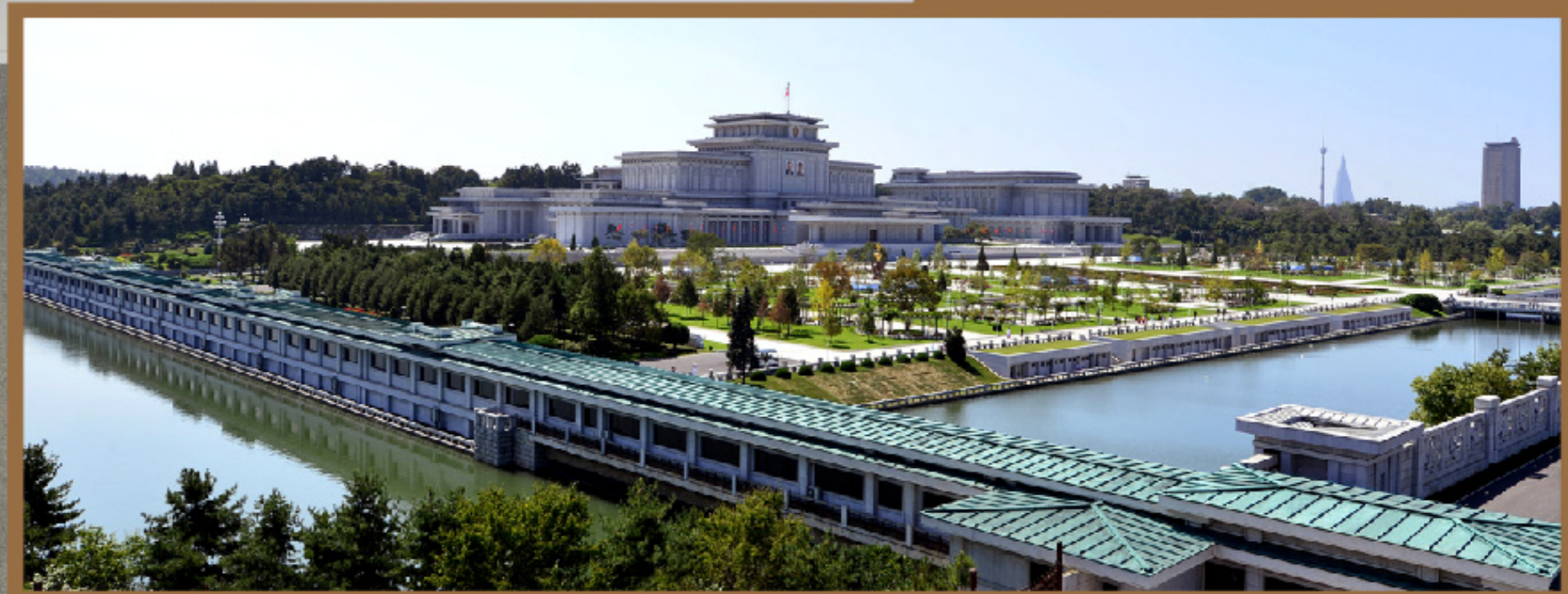
Travelator in the access corridor

The access corridor has been so designed that the Korean people yearning for their great leaders can visit the Kumsusan Palace of the Sun all the year round, irrespective of climatic conditions.