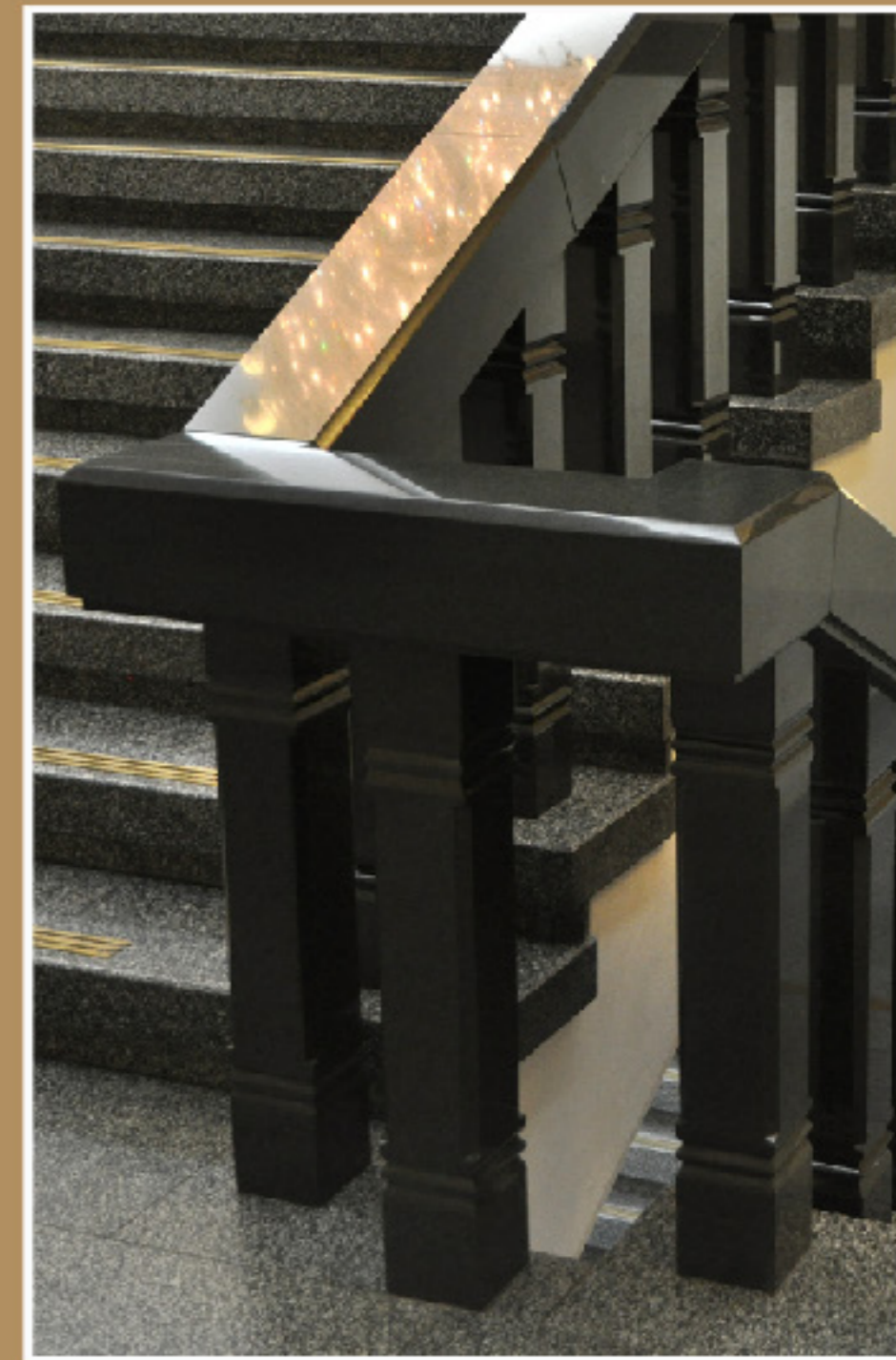
Central division and handrail of the grand staircase