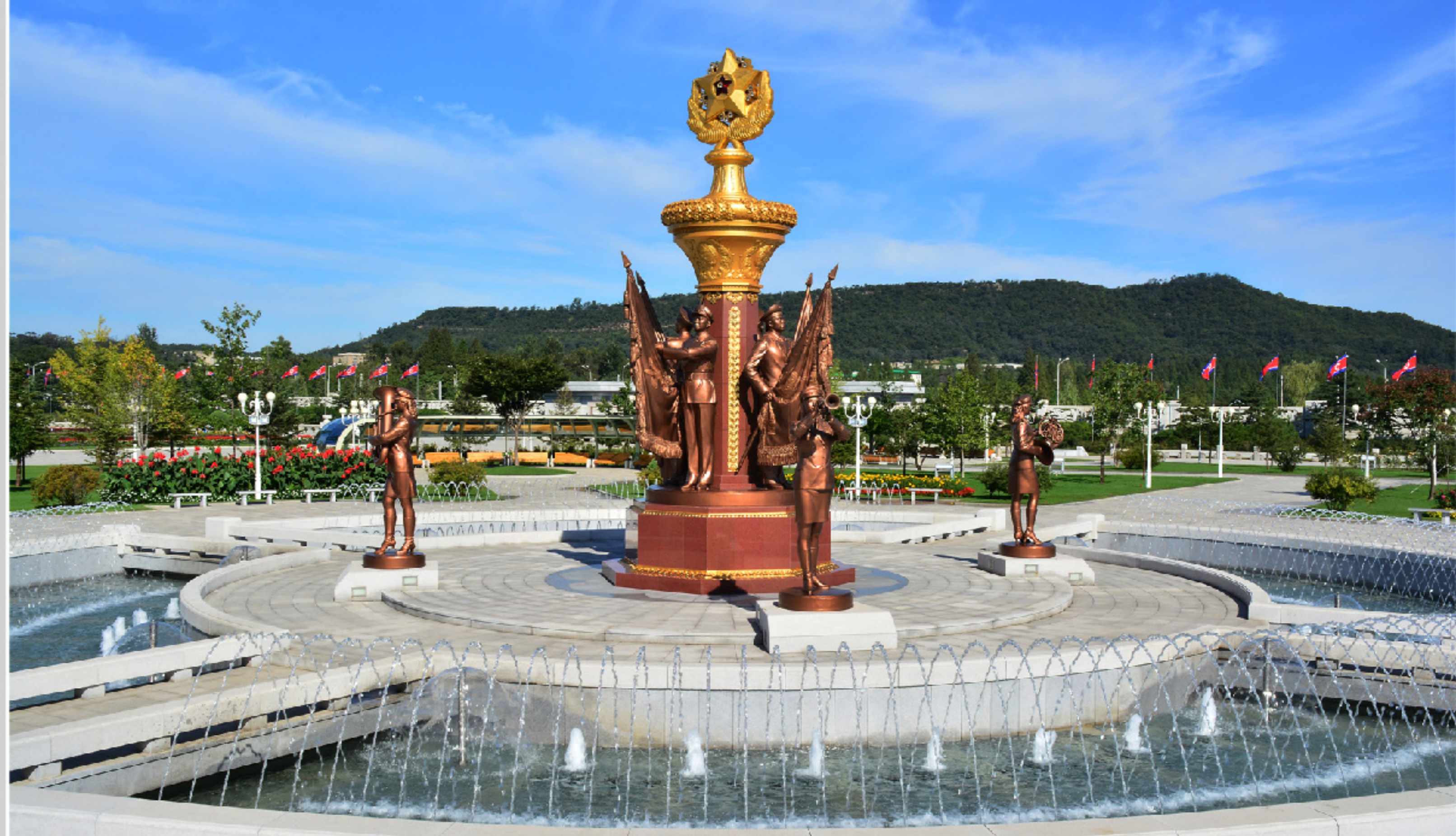
Group sculptures in the plaza park