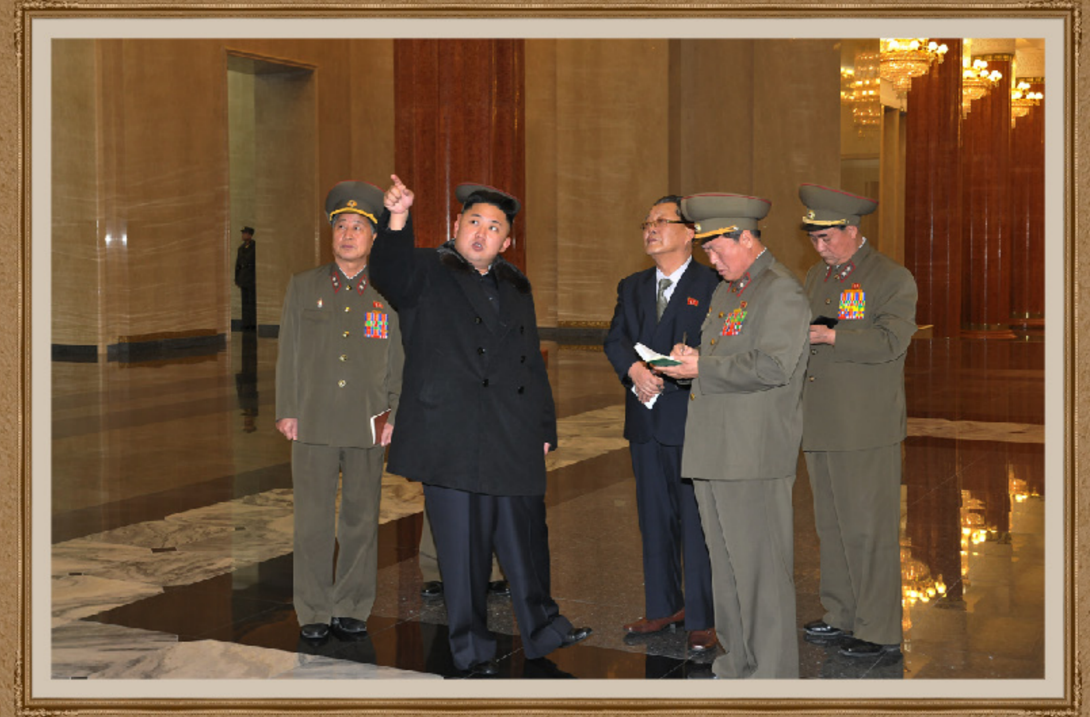
Kim Jong Un guides the work of laying out the Kumsusan Palace of the Sun splendidly as befits the sacred place of the sun