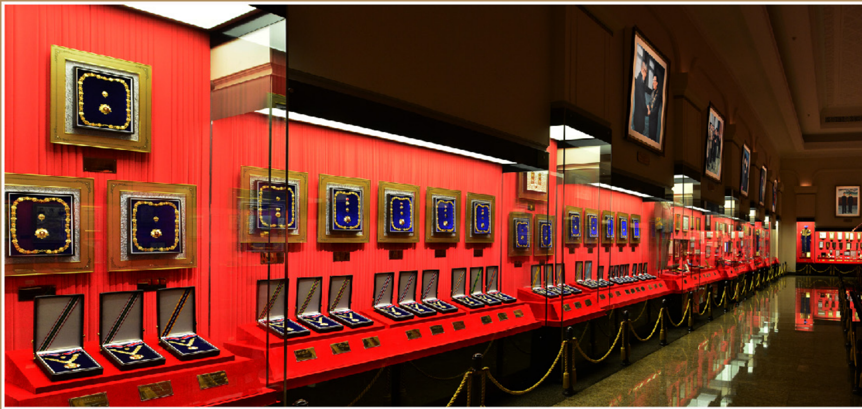
Part of orders, medals and honorary title certificates awarded to Chairman Kim Jong Il