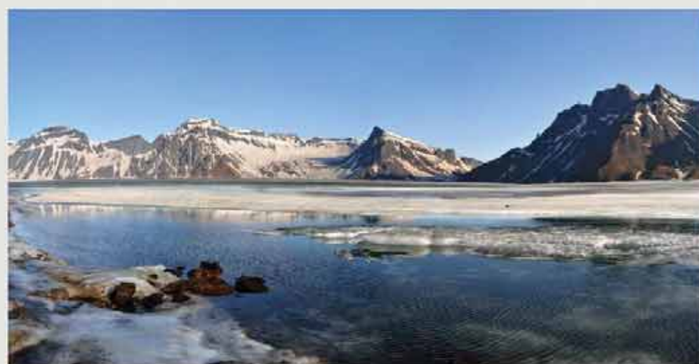
Thaw of Lake Chon