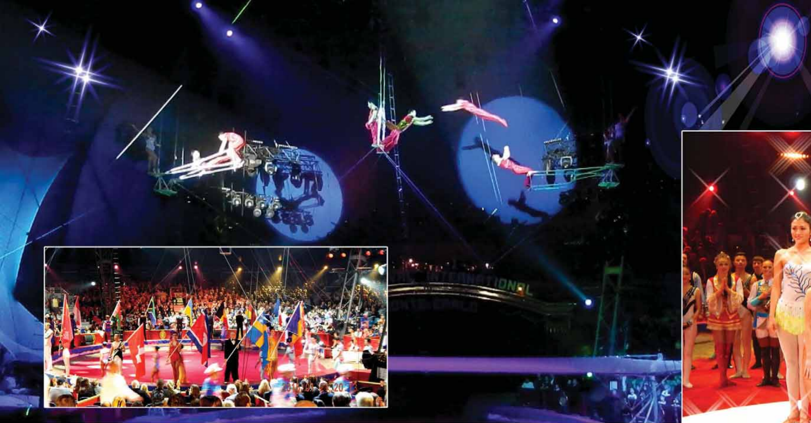
Korean physical stunts "Flight on the twin swings" and "Balancing etude" win gold prizes at the 39 th Monte Carlo International Circus Festival