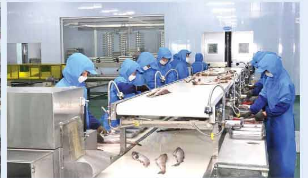
Mushroom farming and seafood processing contribute to enriching people's diet