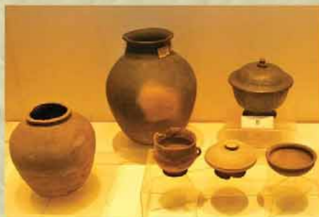
Some of utensils

Article: Kang Su Jong