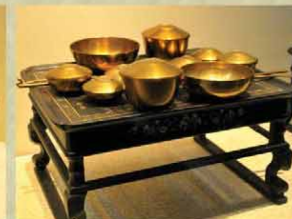
Table laid for two persons