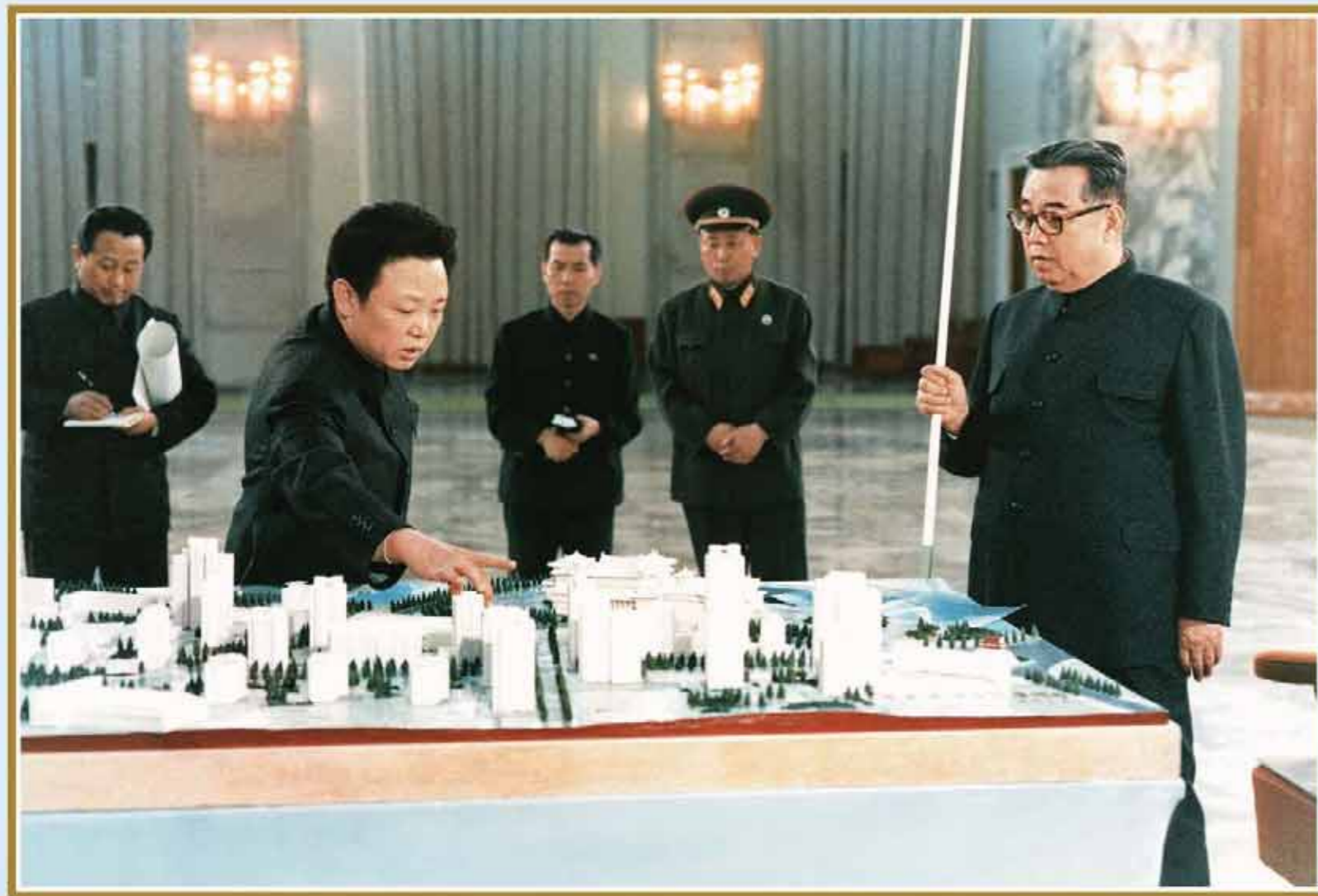
President Kim Il Sung and Chairman Kim Jong Il see a relief model of the Changgwang Street in April Juche 69 (1980)

Even in the pernicious manoeuvres of the imperialists to isolate