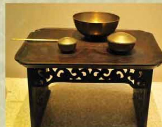
Table set for taking noodles