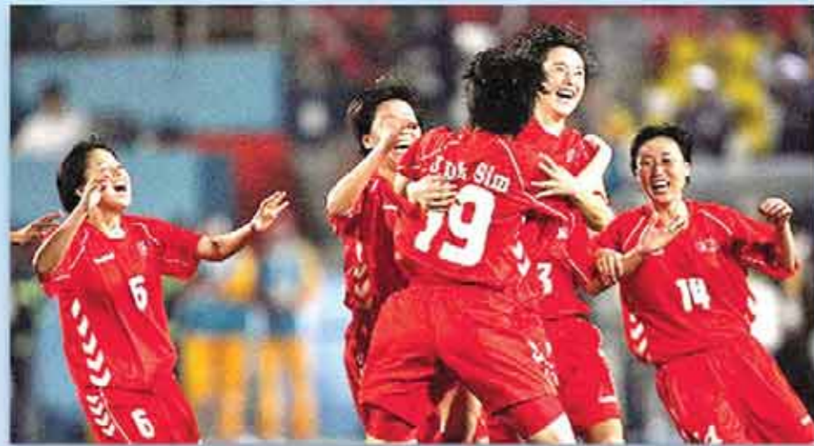
At the 15 th Asian Games