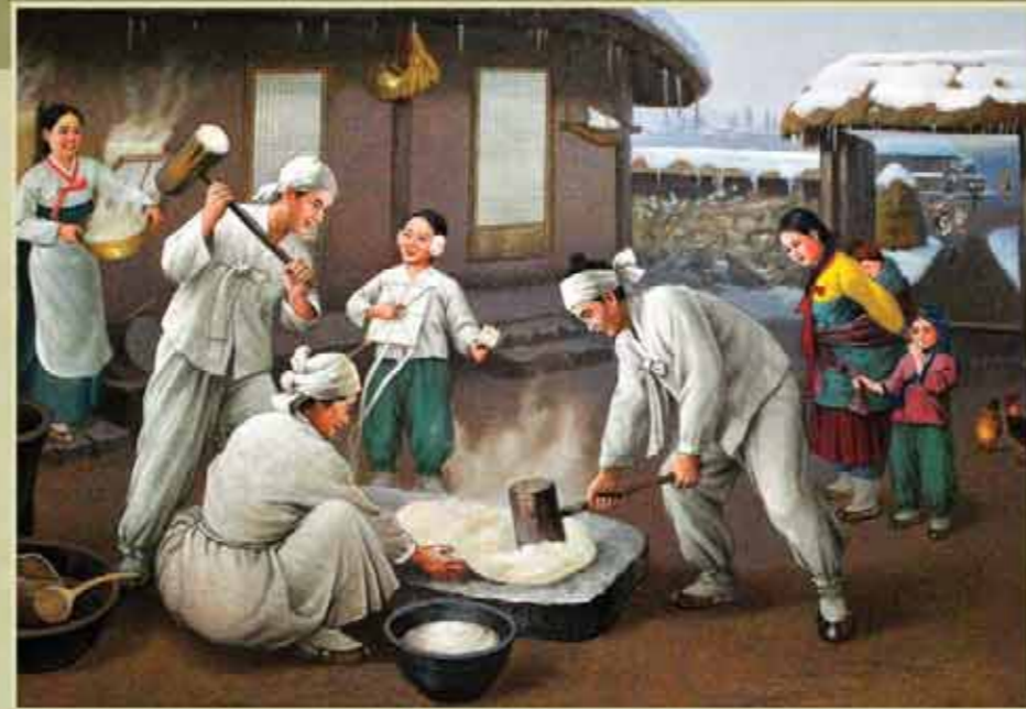
Steamed rice pounding

The Korean Folklore Museum has also a large collection of materials and data explaining the dietary customs unique to the Korean nation.