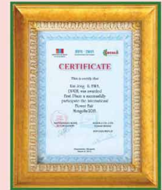
Kimjongilia takes first place at the International Flower Fair held in Mongolia