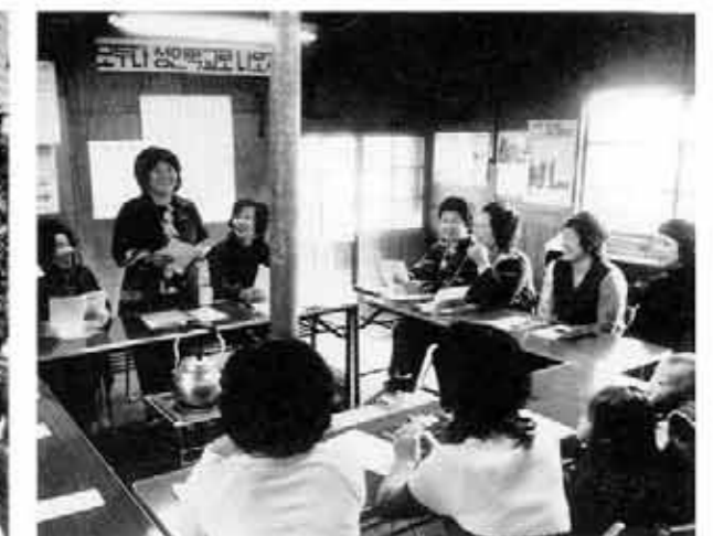
Korean women in Japan receive the education in national spirit