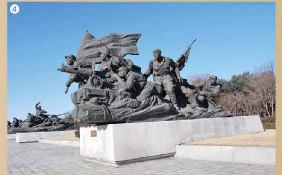
① Tower of the Juche Idea and the group sculpture of three persons ② Group sculptures in the shape of a flag, Monument to the Anti-Japanese Revolutionary Struggle and Monument to the Socialist Revolution and Socialist Construction ③ Bugler for the March , a sub-thematic group sculpture for the Samjiyon Grand Monument ④ Group sculptures for the Victorious Fatherland Liberation War Museum

Monument on Mansu Hill (1972) and Samjiyon Grand Monument (1979), and others.