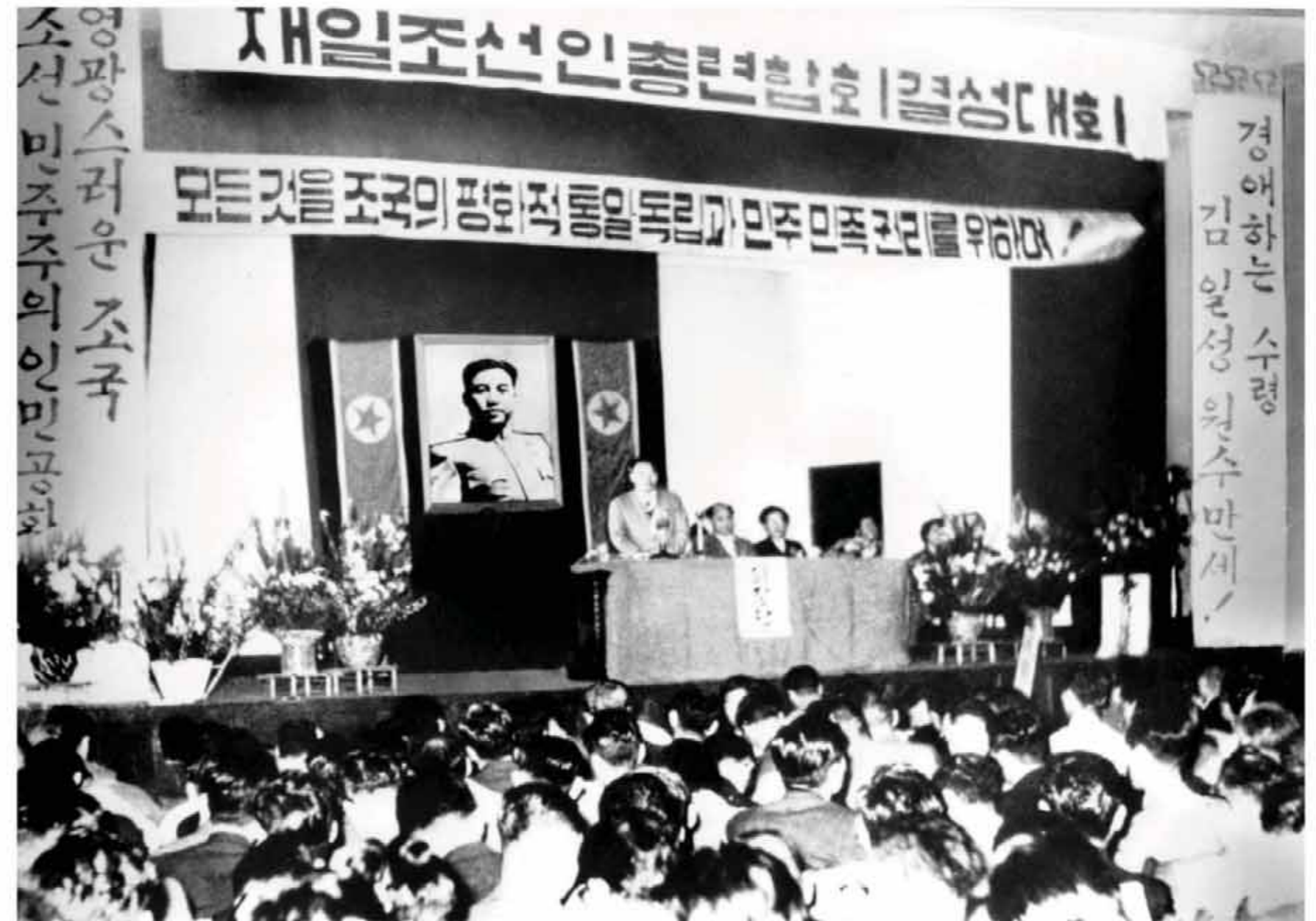
The General Association of Korean Residents in Japan was formed on May 25 Juche 44 (1955)

Perceiving the requirements of the developing revolution and analyzing