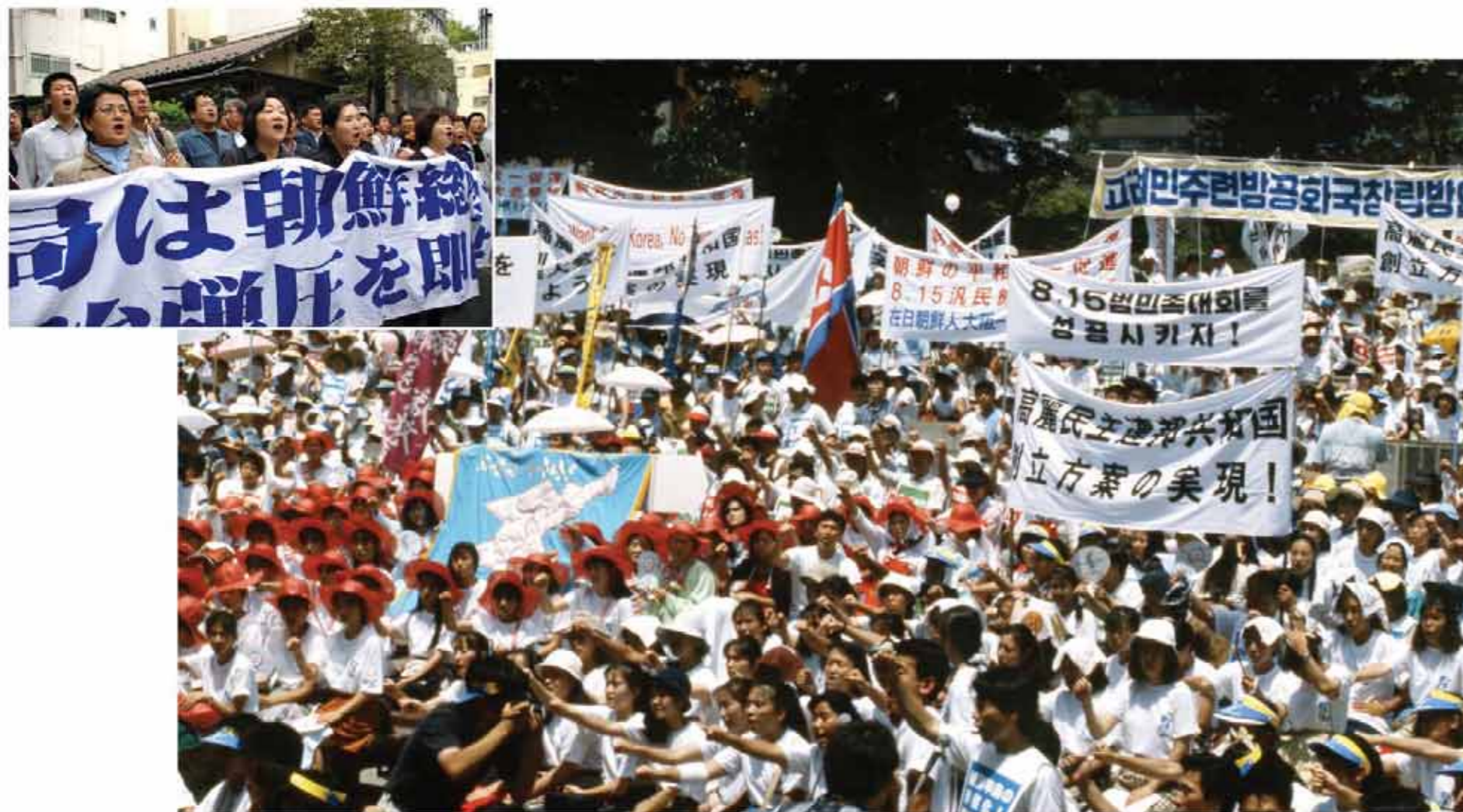
Koreans in Japan turn out in the struggle for legal rights of the overseas Korean citizens and the national reunification