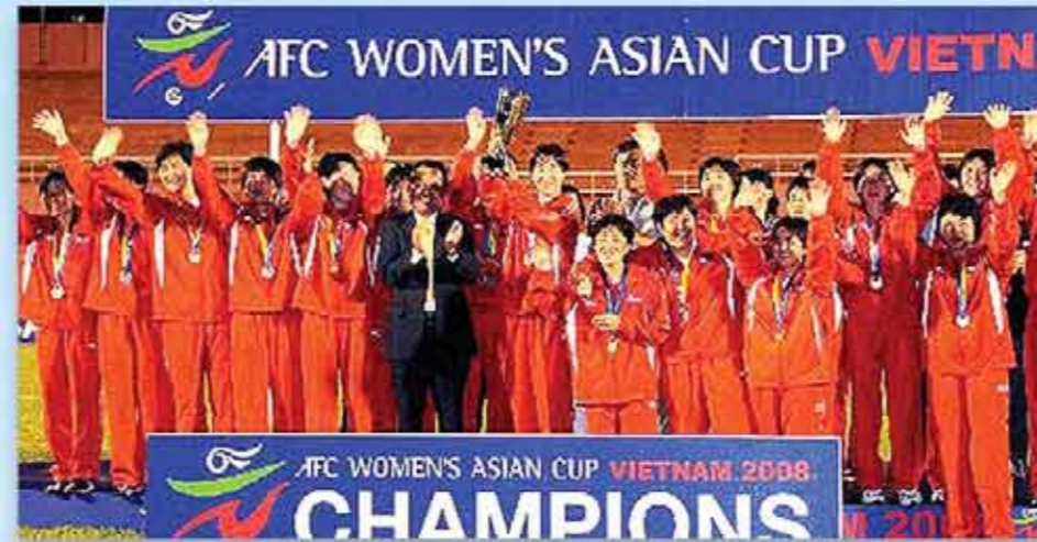
At the 2008 AFC Women's Asian Cup final