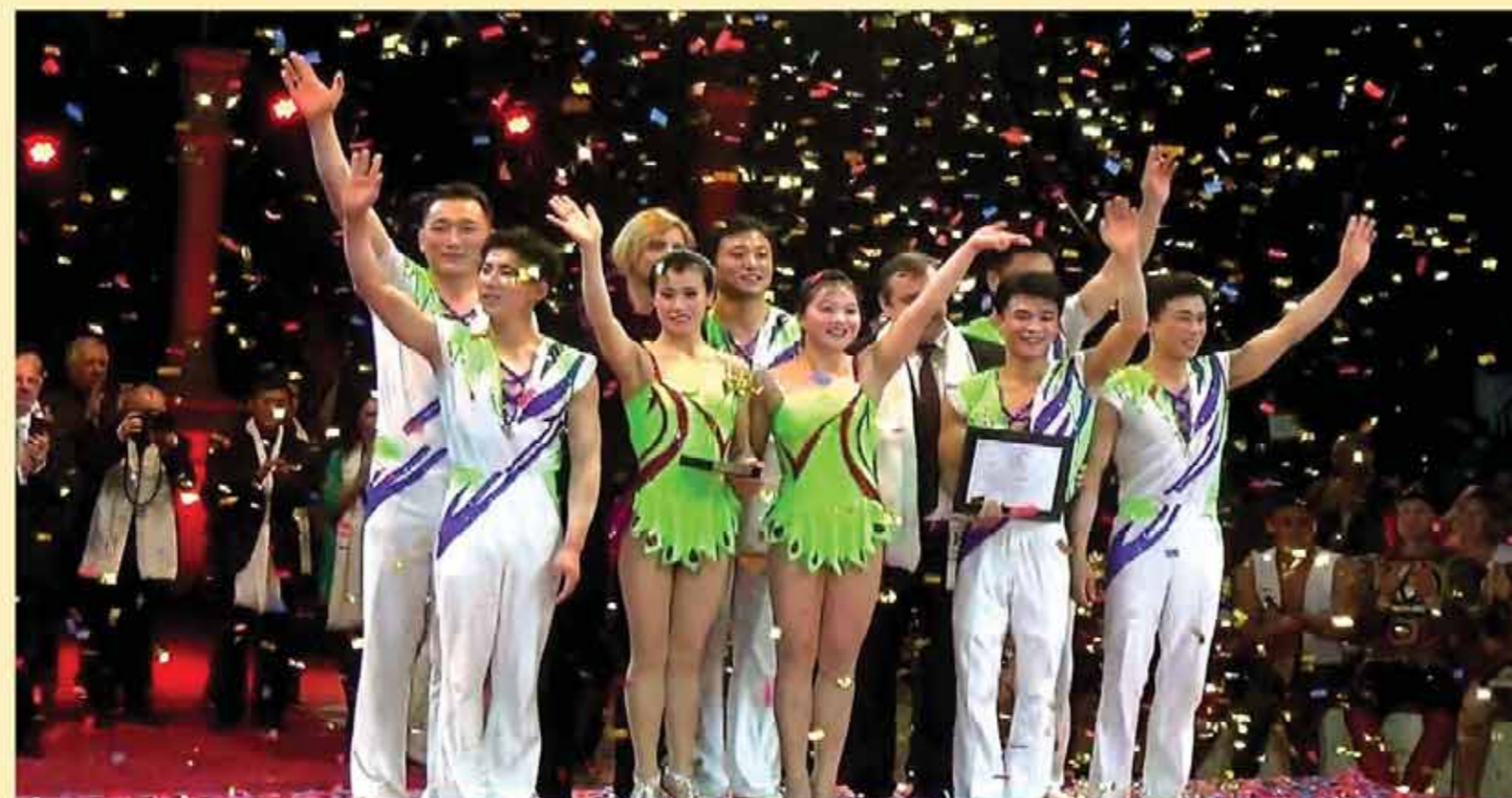
Korean acrobats win the Gold Elephant Prize at the 4 th Figueras International Circus Festival in Spain for physical stunt "Aerial Trapeze"