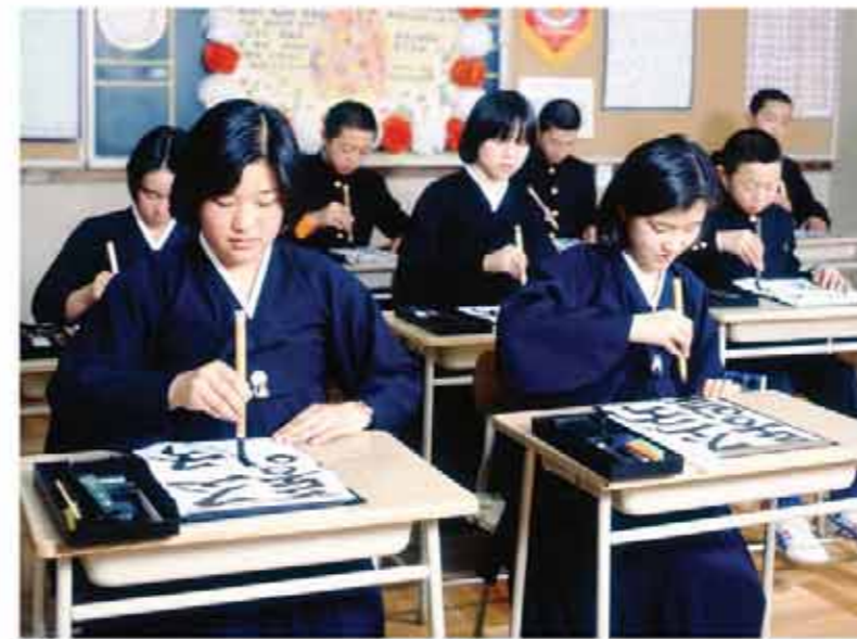
National education is getting brisk