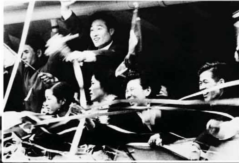
The first ship carrying the Koreans to return home departs the Niigata Port in Japan in December Juche 48 (1959)