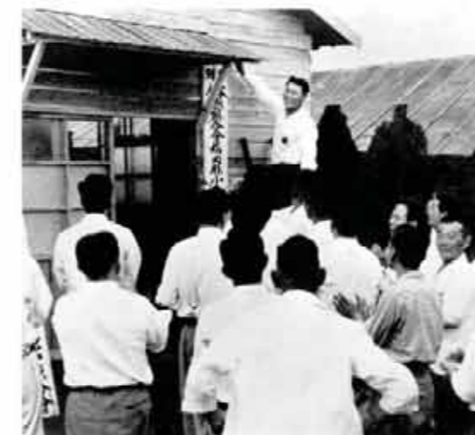
Chapters of Chongryon are established after the formation of its headquarters and branches

Chairman Kim Jong Il wisely led Chongryon, the patriotic inheritance from