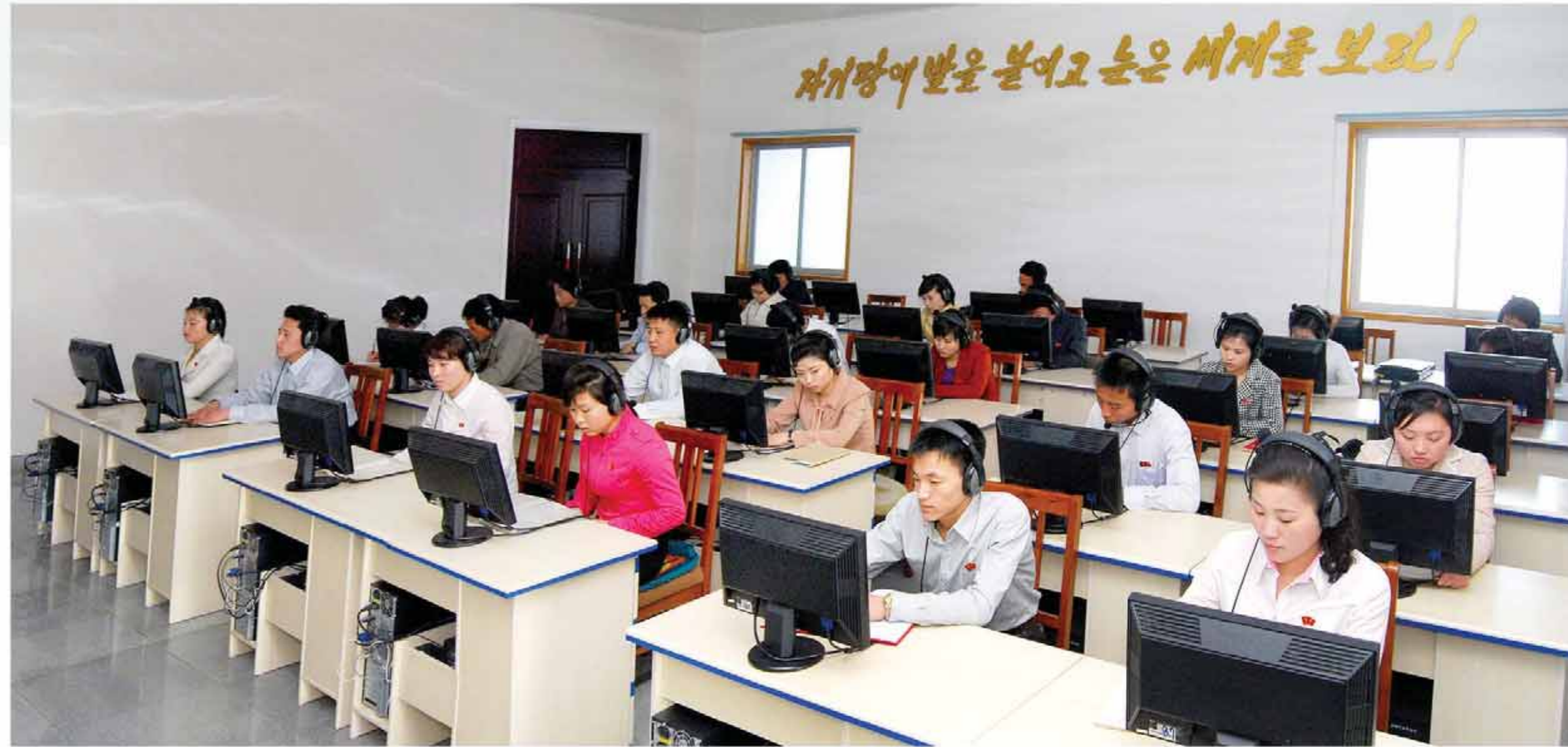
Workers at the mill take on-line college course after work