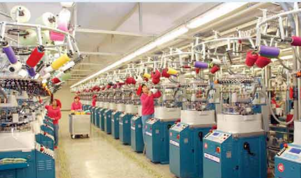
Light industry factories are increasing the production of consumer goods (at the Pyongyang Hosiery Factory)