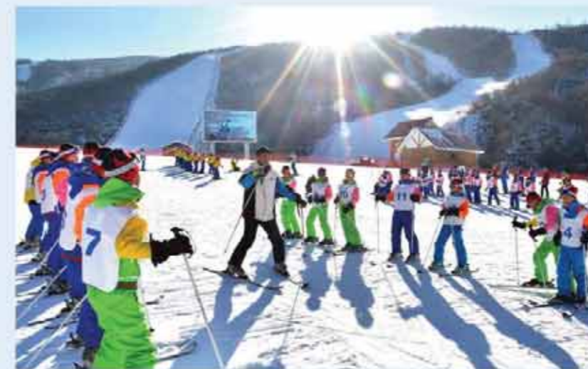
People enjoy themselves at the Masikryong Ski Resort, Munsu Water Park and other cultural facilities