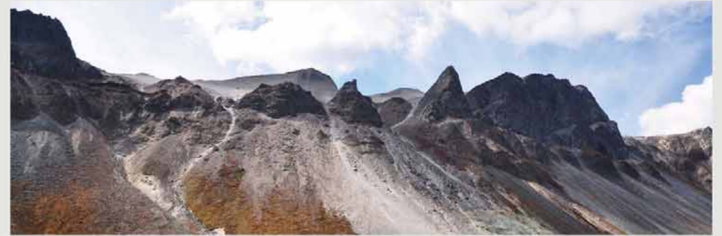
Rocks of mysterious shapes on Mt. Paektu