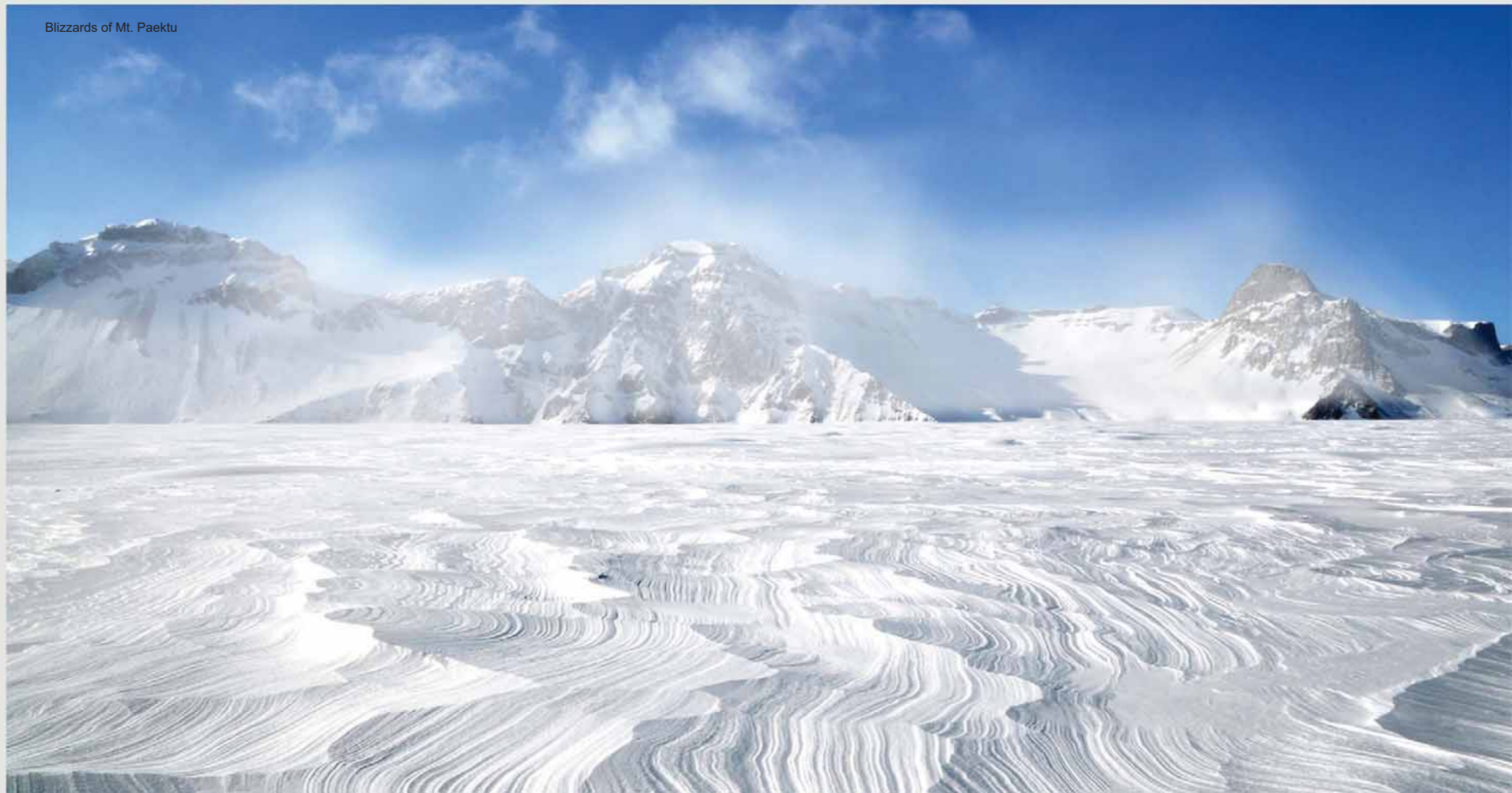
Blizzards of Mt. Paektu