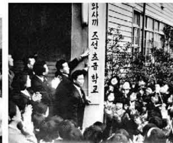
Korean Primary School in Kawasaki, Japan, welcomes its new pupils