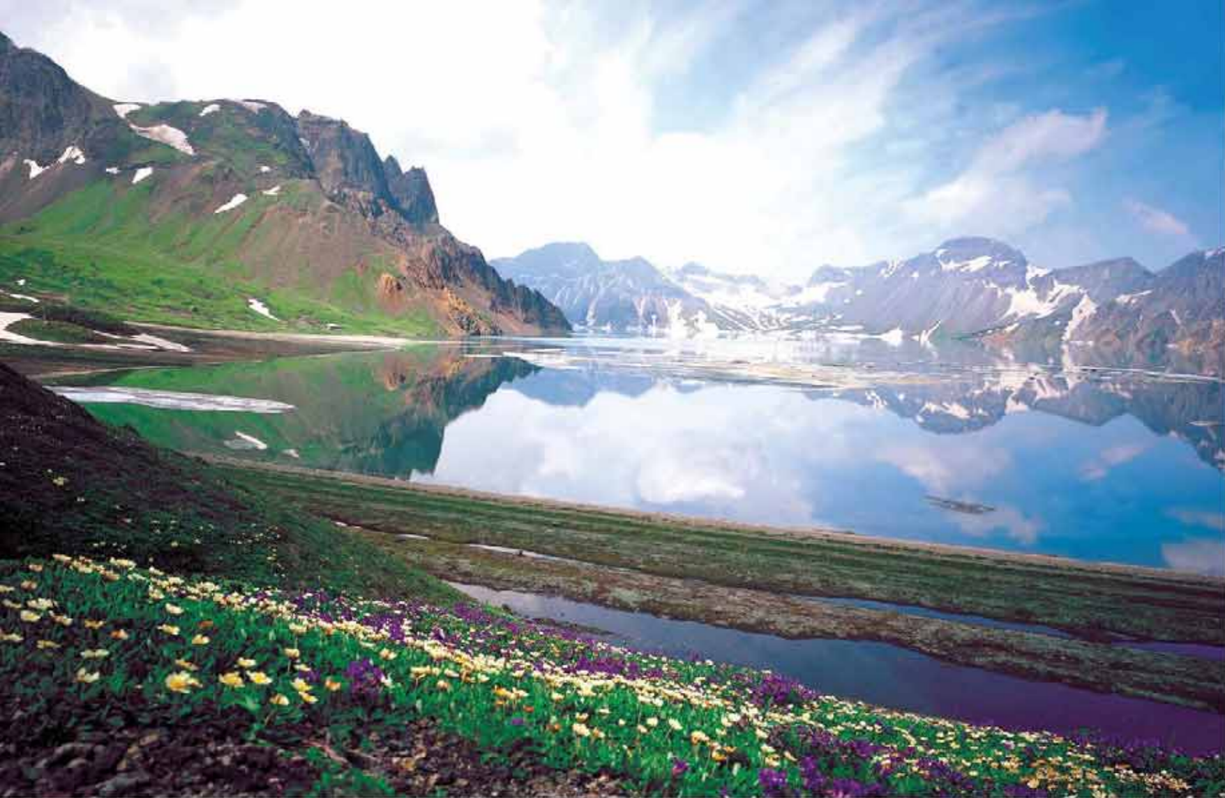
Summertime view of the lakeside