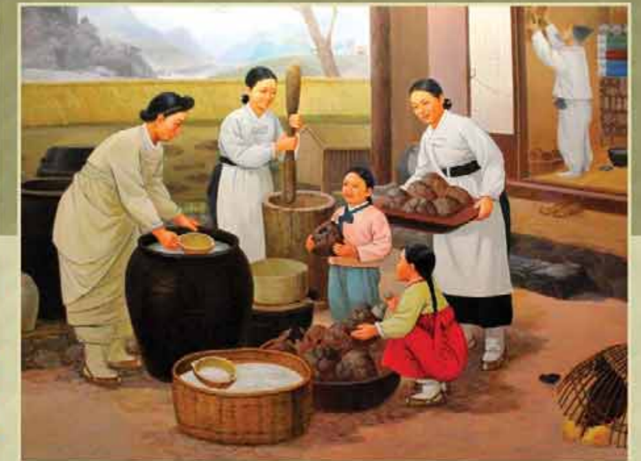
Preparing of soybean paste and sauce

Exhibited in the museum are also materials on traditional table settings.