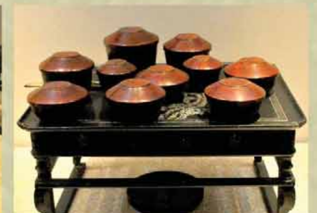
Five-bowl set for meal