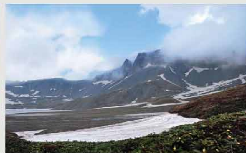
Lake Chon in spring