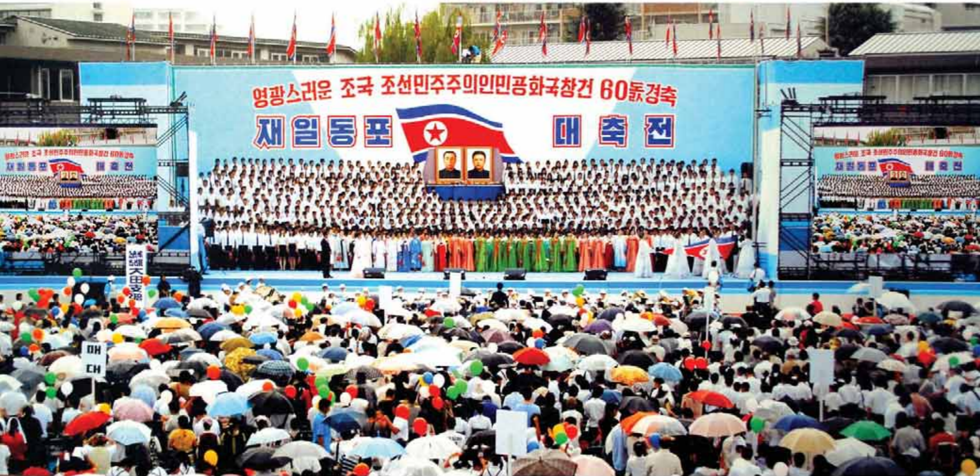
Grand festival of the Koreans in Japan in celebration of the 60 th anniversary of the DPRK