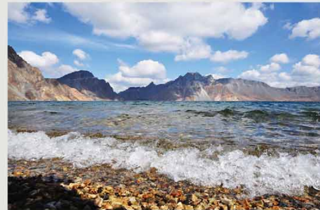
Lake Chon in summer