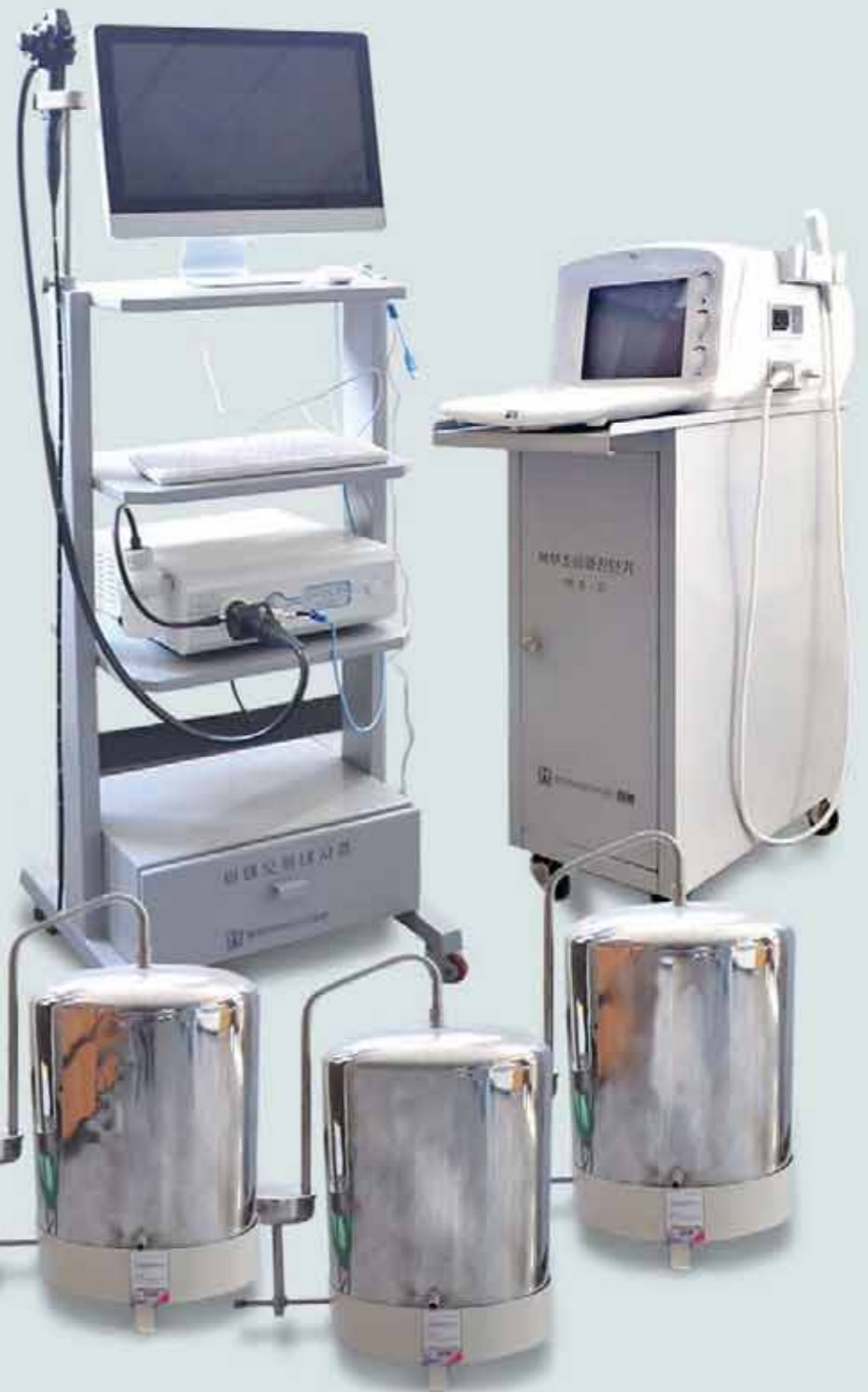
Some of the products