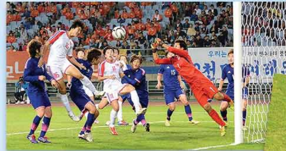
At the 17 th Asian Games