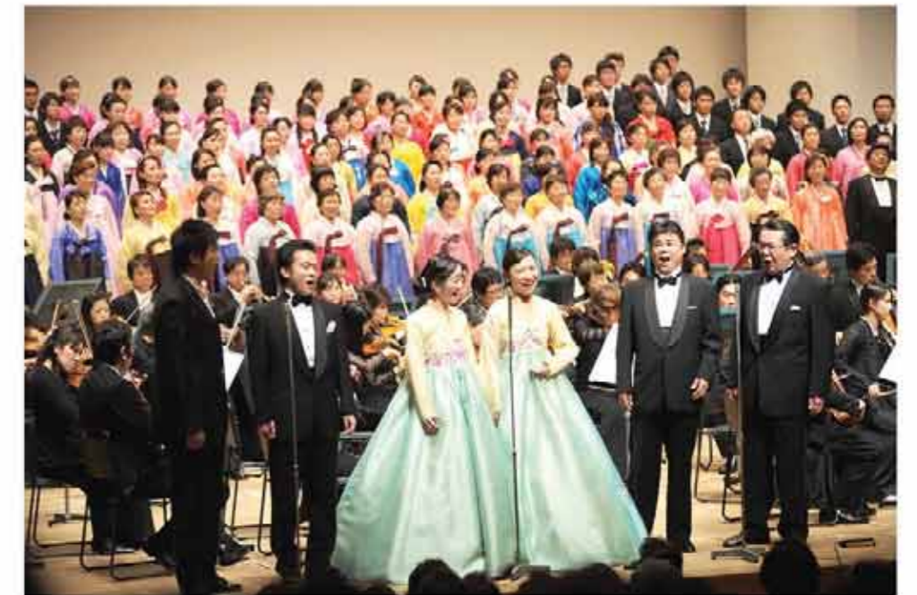
National flavour permeates their artistic performance