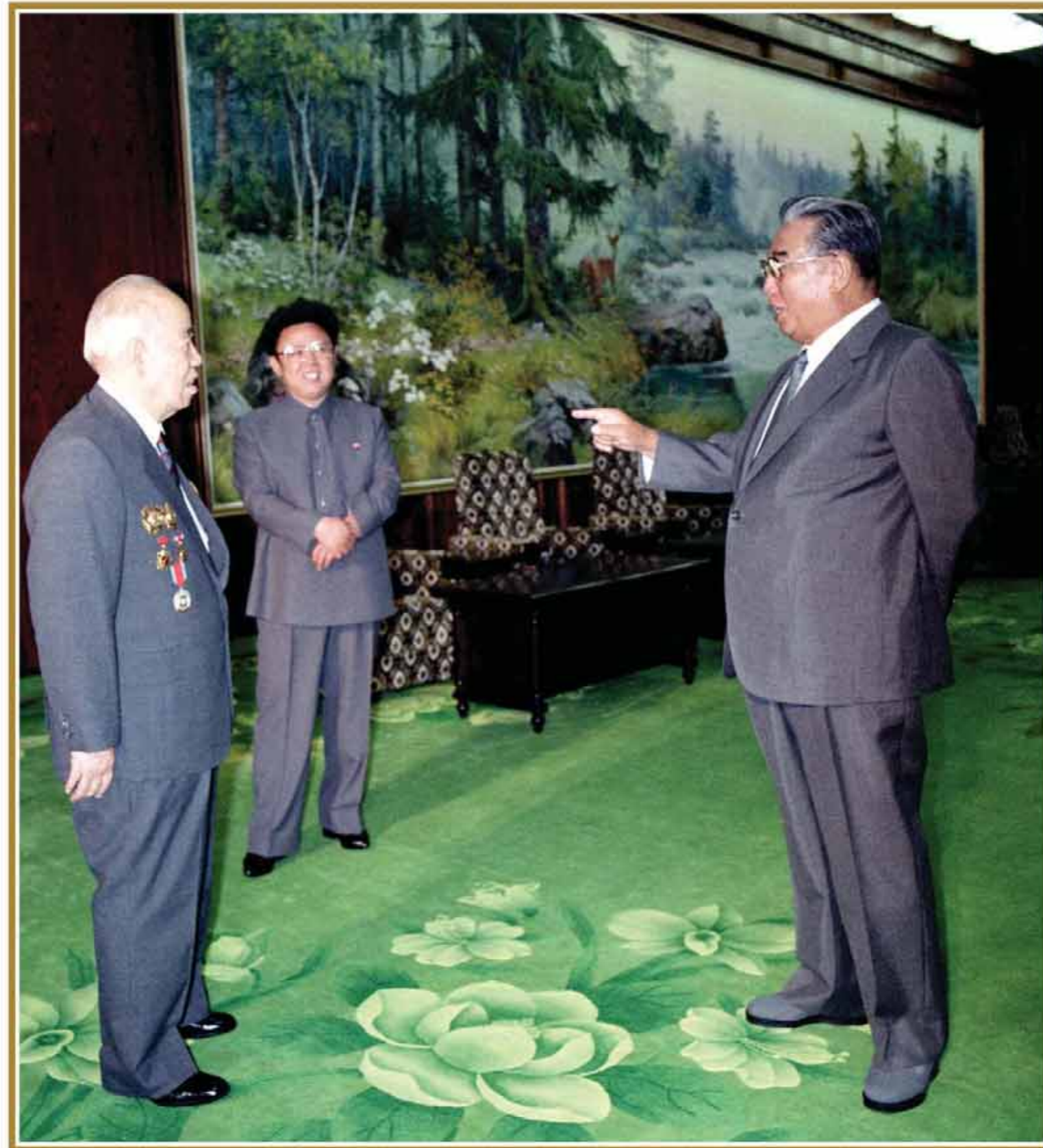
Great leaders Kim Il Sung and Kim Jong Il illuminate the road for the movement of Koreans in Japan and Chongryon in September Juche 77 (1988)