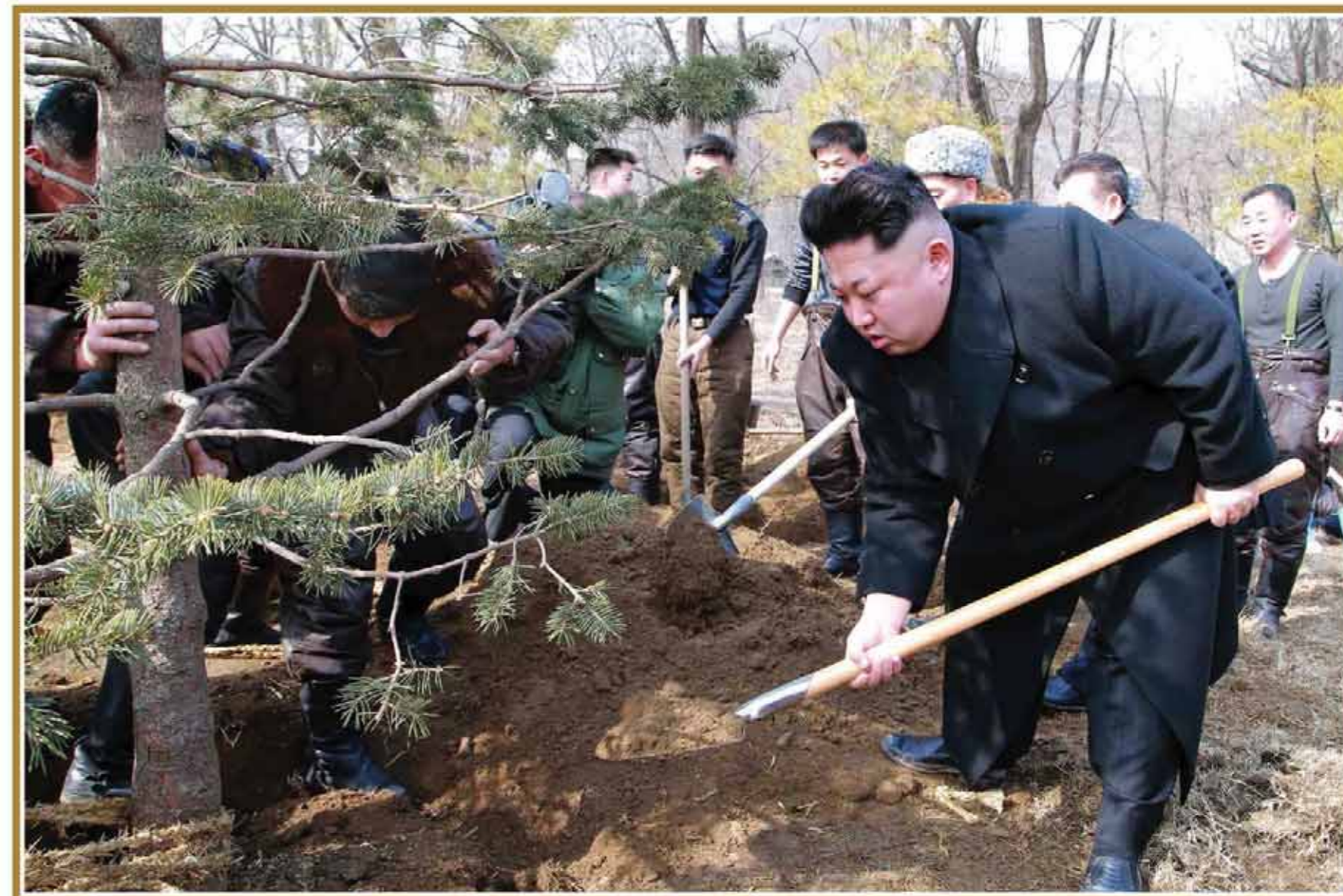
Kim Jong Un, Supreme Commander of the Korean People's Army, plants trees with the pilots of a unit of the KPA Air and Anti-aircraft Force in March Juche 104 (2015)