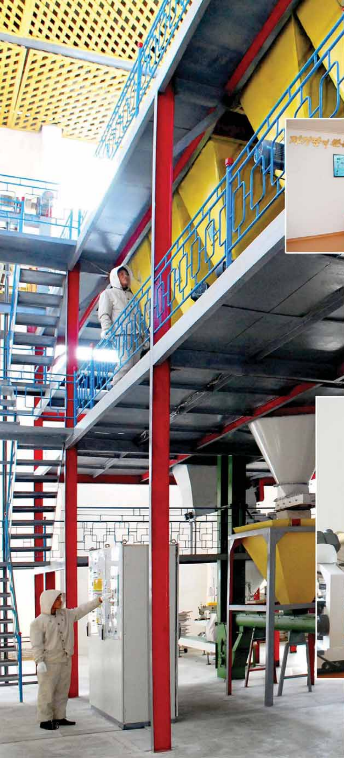
The feed additives of the factory are made from locally available materials