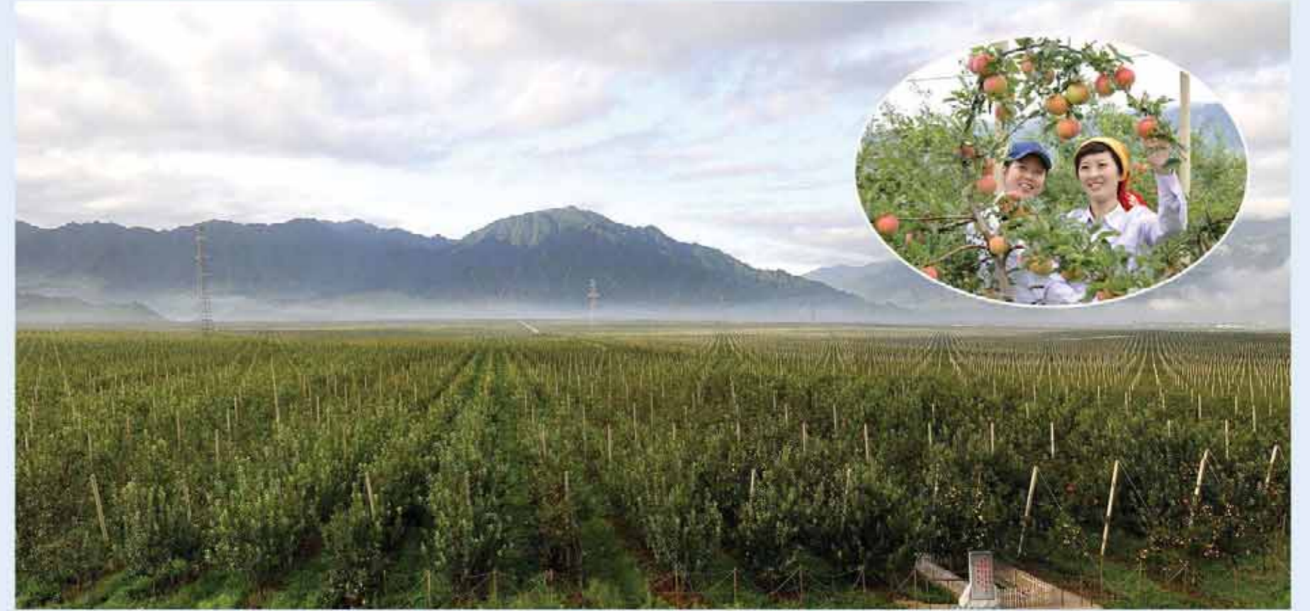
A vast expanse of fruit trees at the large fruit farm presents a spectacular sight