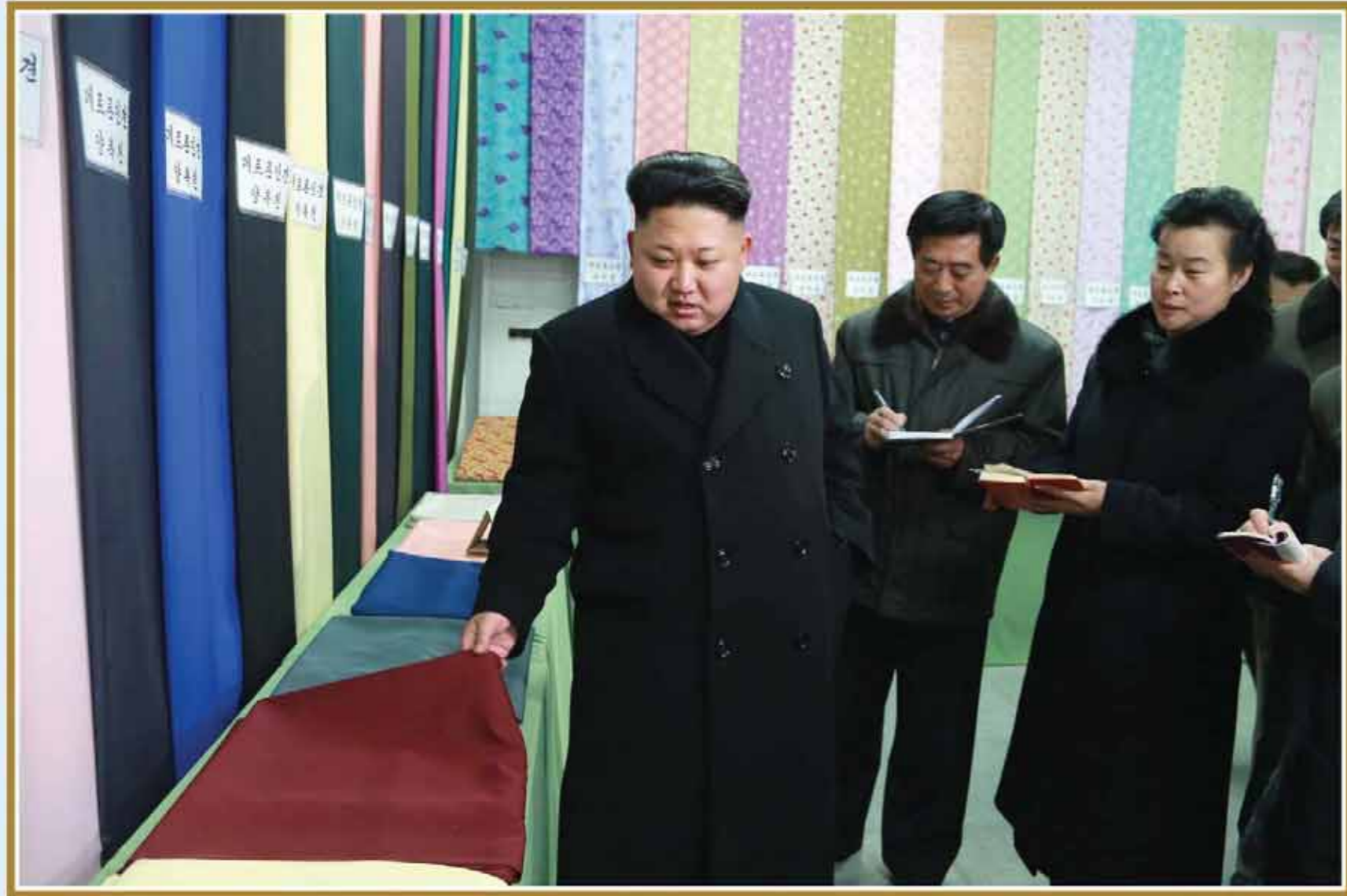
Kim Jong Un looks round the Pyongyang Kim Jong Suk Textile Mill in December Juche 103 (2014)

and stifle the DPRK and the ensuing fierce political and military confrontations, the country's light industry and agricultural sectors closely related to people's living made considerable upsurges in production and breakthroughs were made in fishery and livestock, vegetable and mushroom farming. Innumerable are cultural establishments that mushroomed across the country for the well-being of the people including apartment buildings for the educationists at Kim Il Sung University and Kim Chaek University of Technology, Changjon and Unha Scientists streets, Wisong Scientists Dwelling District, Ryugyong Dental Hospital, Okryu Children's Hospital, Rungna People's Recreation Ground,