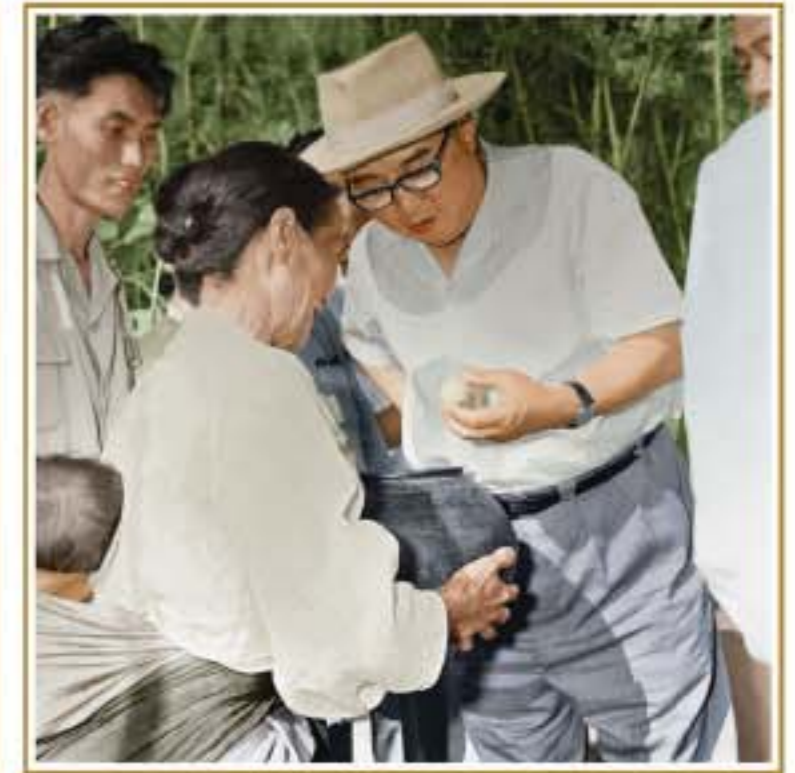
Kim Il Sung acquaints himself with the lives of a family at Hyangha-ri in Janggang County [July Juche 58 (1969)].

of flowers in bloom. The Pyongyang Grand Theatre, the Grand People’s Study House, the People’s Palace of Culture, the Pyongyang Students and Children’s Palace, the Okryu Restaurant and other monumental edifices