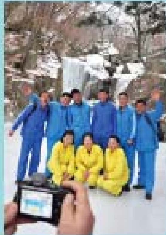
Farmers pose for a souvenir picture of their merry holiday camping.

In the Democratic People's Republic of Korea holiday camps are built in scenic places and spa areas to improve people's health.