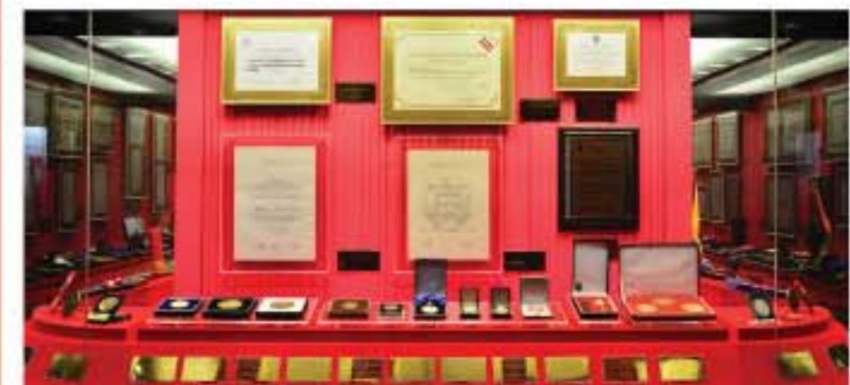
Partial view of the room in the Kumsusan Palace of the Sun that exhibits orders, medals and honorary title certificates.

Kim Il Sung is awarded orders, medals and honorary titles by over 70 countries and international organizations, more than 30 cities and 20 odd universities in the world.