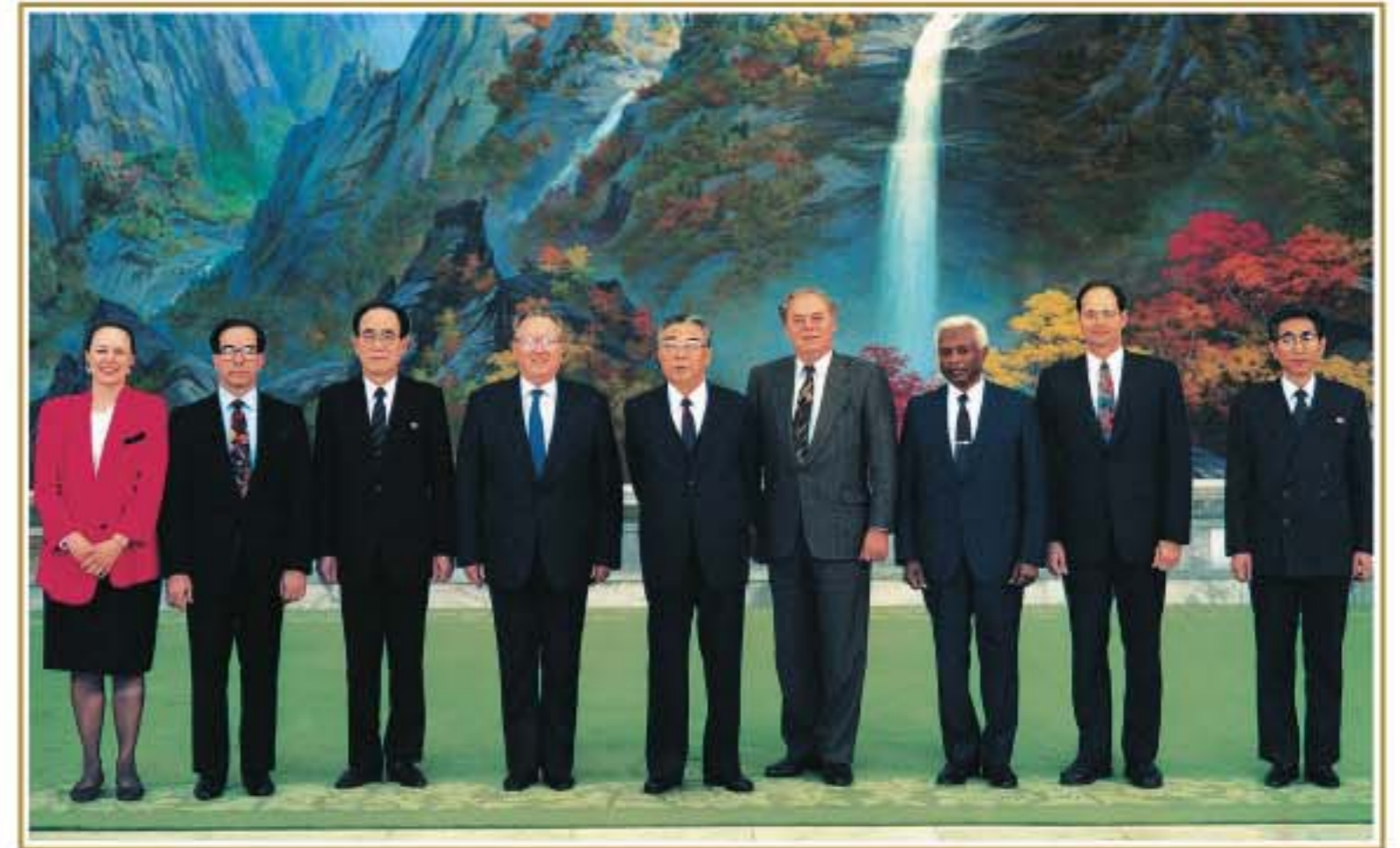
Kim Il Sung poses for a photograph with the members of the World Peace Council [April Juche 81 (1992)].