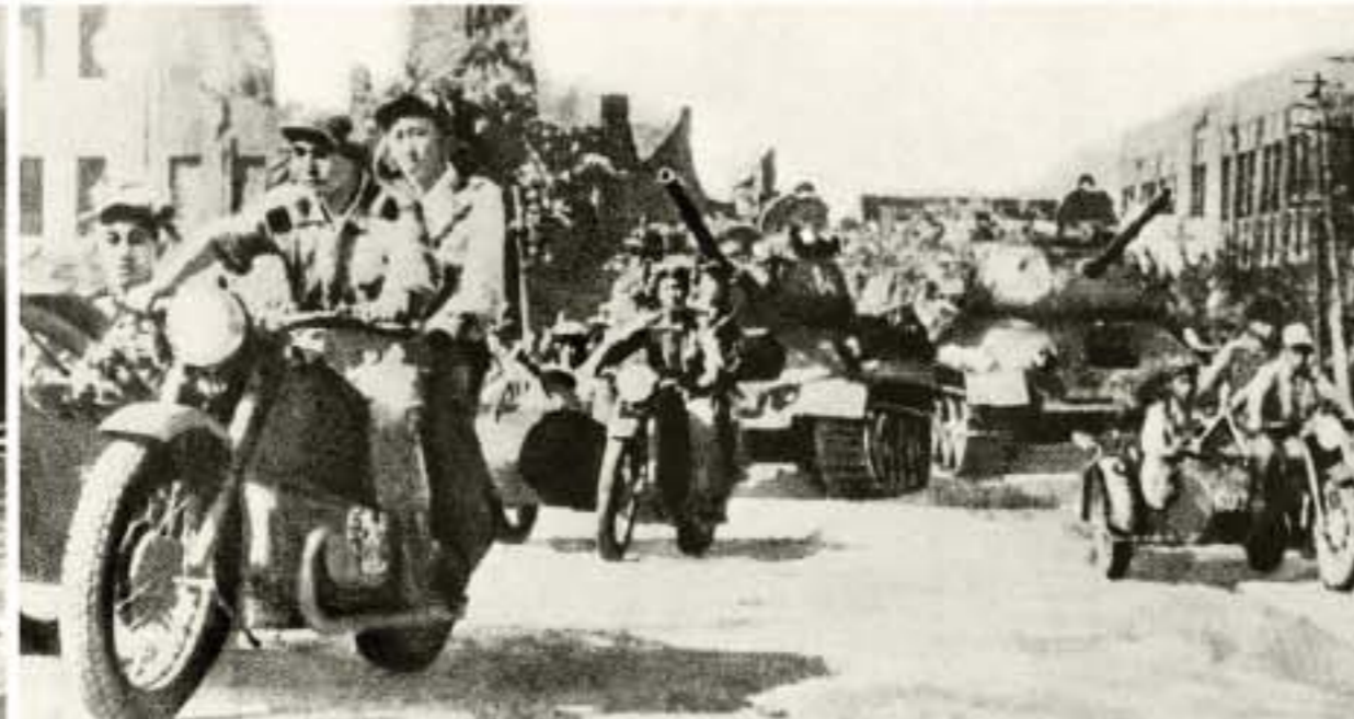
The Korean People's Army repulsed the enemy's sudden attack and launched immediate counteroffensives, thus liberating the wide areas of south Korea.