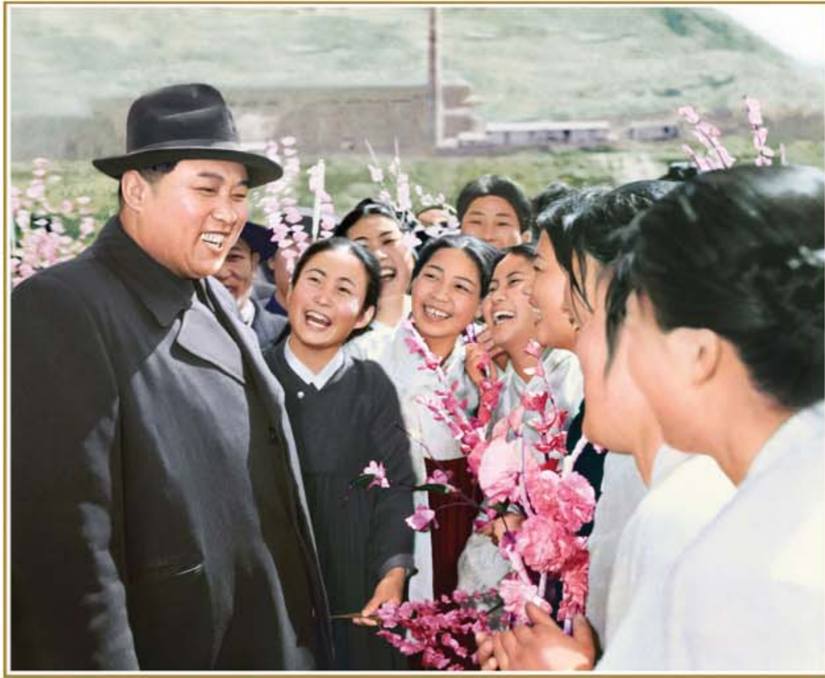
Kim Il Sung gives on-site guidance at the Komdok Mine [April Juche 50 (1961)].