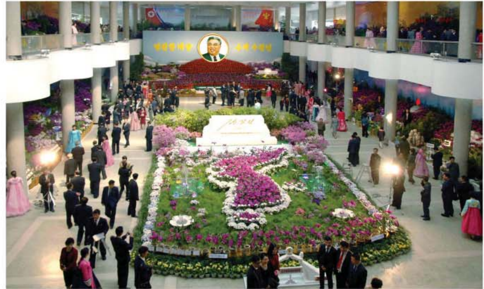
Kimilsungia festival is a grand event held every year to celebrate the Day of the Sun, President Kim Il Sung's birthday.

Many countries and progressive figures, even after his demise, presented such gifts as glasswork “Sun” and “Red Sun” and awarded a number of orders, medals and honorary titles, including El Mehdi Ben Barka Order of Solidarity