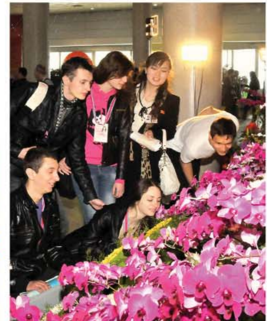
Foreigners visit the venue of the Kimilsungia festival.