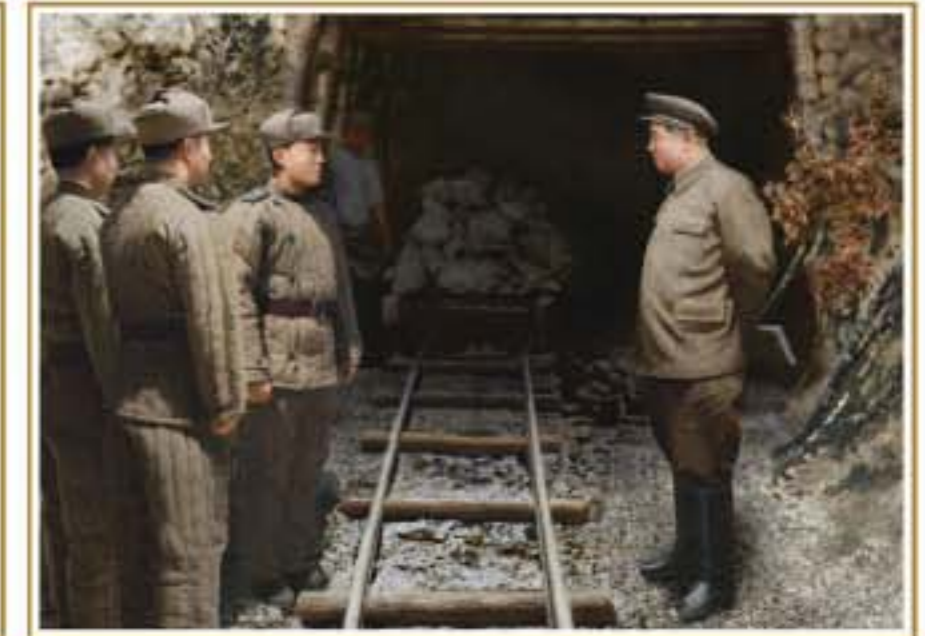
Kim Il Sung inspects the tunnelling site [October Juche 40 (1951)].

The United States, having boasted of being always victorious in its war history of over a hundred years, provoked a war against the DPRK that was less than two years old. On the US side were the troops of 15 vassal states, south Korean army and even the Japanese militarists.