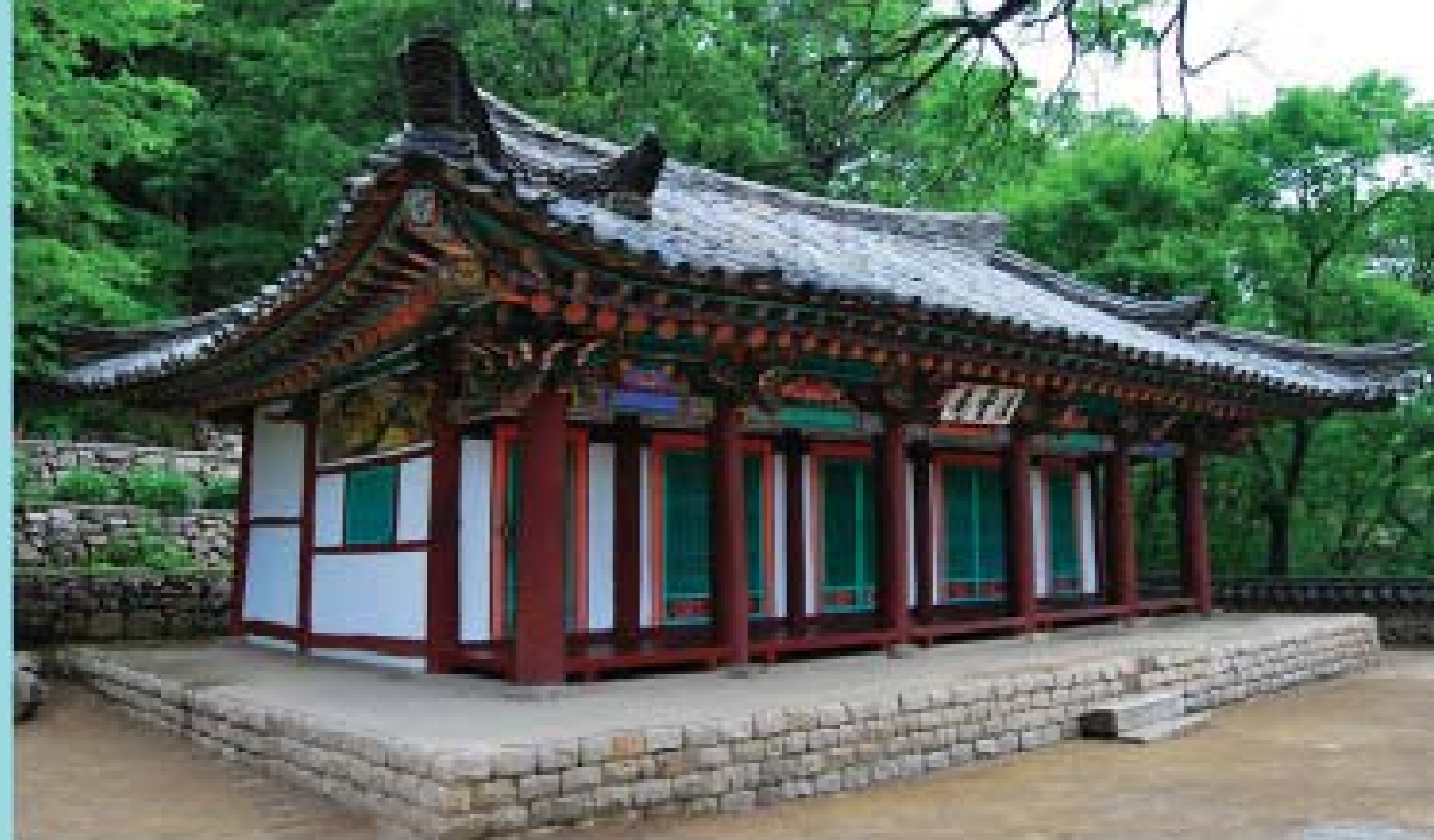
The hermitage's Main Hall.