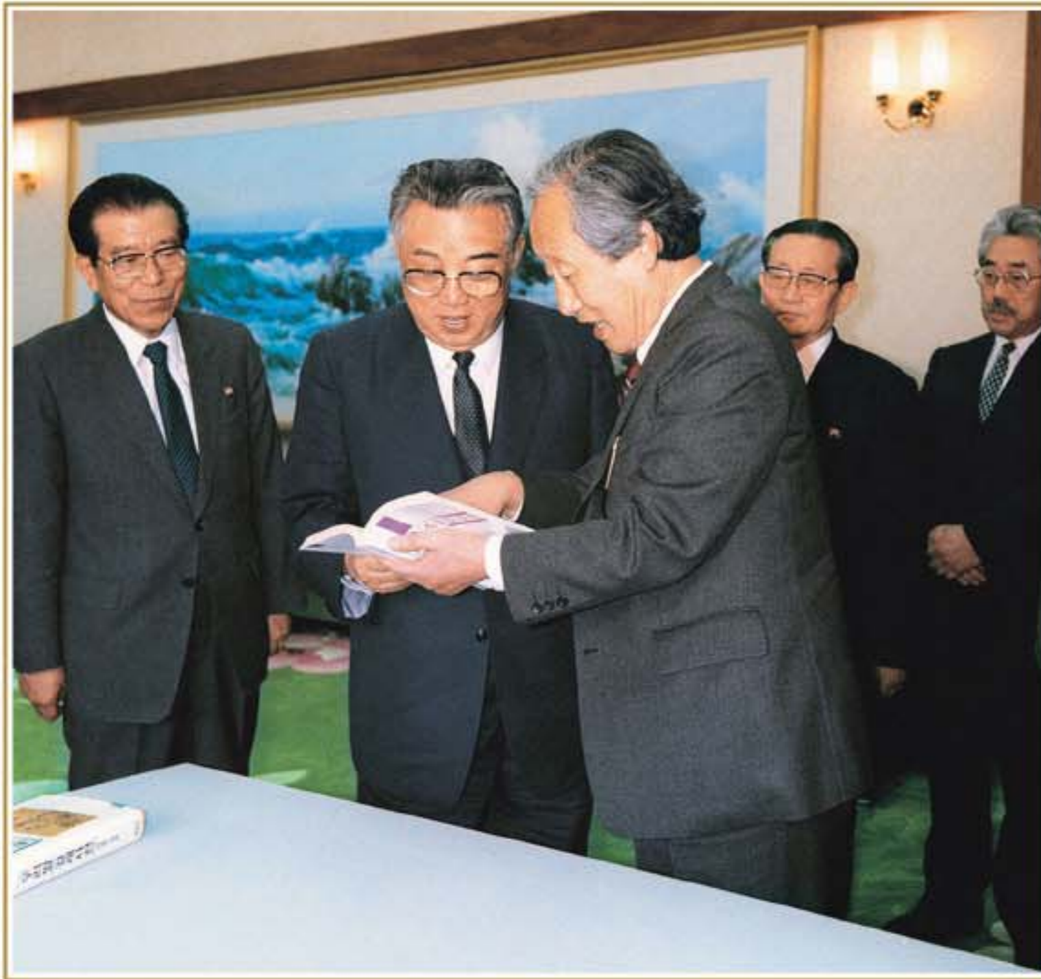
Kim Il Sung meets Rev. Mun Ik Hwan, advisor to the Coalition for the National Democratic Movement in south Korea [March Juche 78 (1989)].