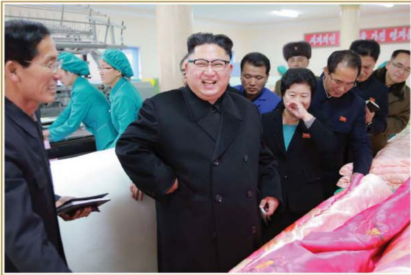
Supreme Leader Kim Jong Un gives on-site guidance at the quilt production process newly established at the Pyongyang Kim Jong Suk Silk Mill [January Juche 106 (2017)].

The Pyongyang Kim Jong Suk Silk Mill that is known as a leading silk yarn producer in the DPRK, has established a modern quilt production process with a huge capacity in December last year and is turning out soft and light silk quilts and various other kinds of quilts.