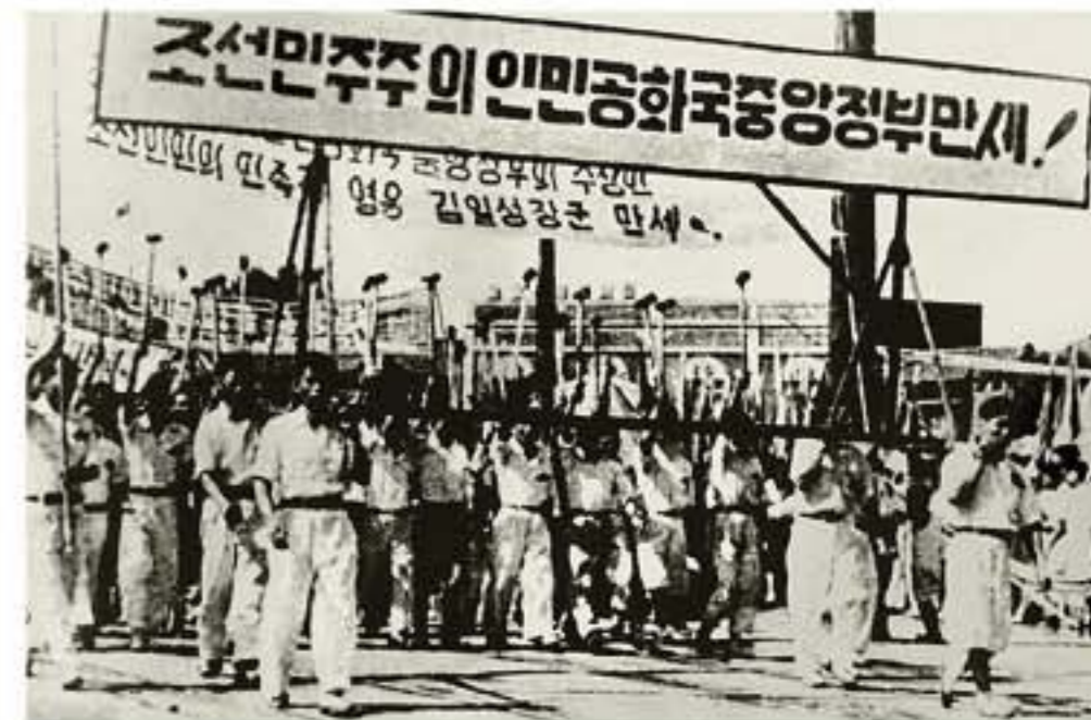
A regular revolutionary armed force was built and the Democratic People's Republic of Korea, genuine people's government, established.