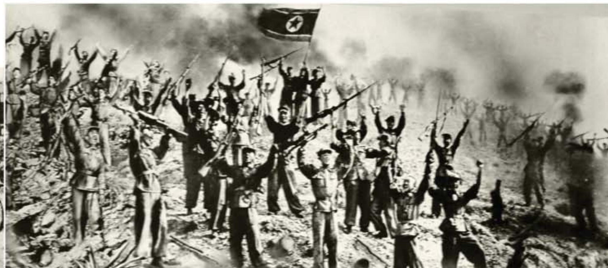
The Korean people defeated US imperialism which had boasted of being the "strongest" in the world, and won victory in the war on July 27, Juche 42 (1953).