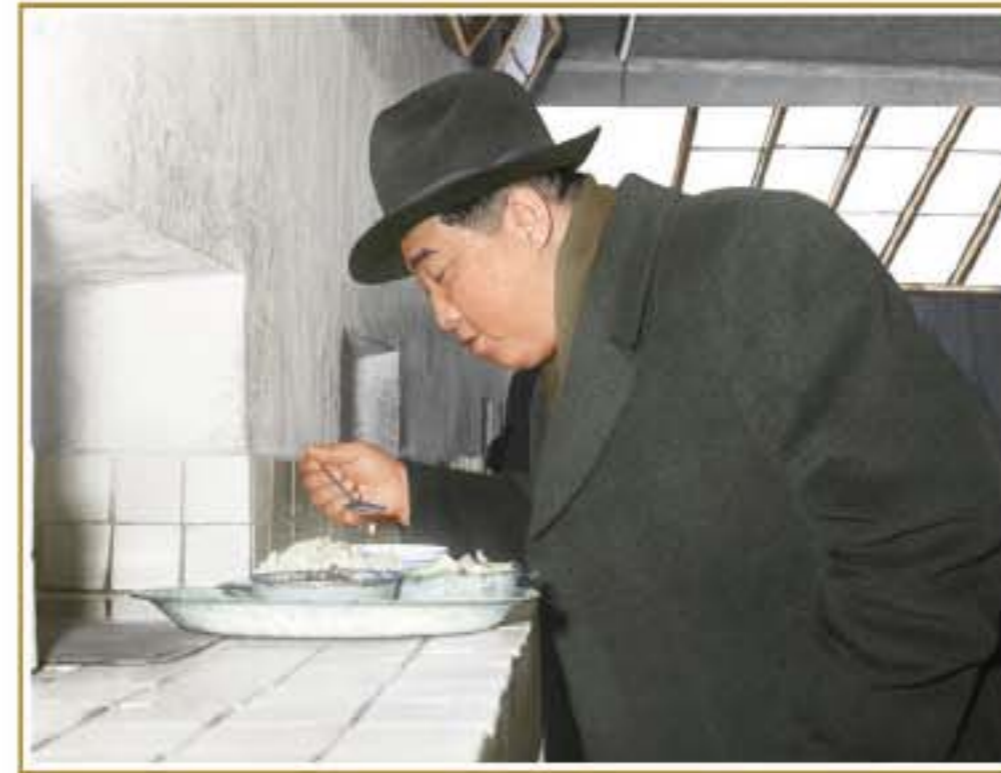
Kim Il Sung looks after the dietary life of the workers at the Taeann Electrical Machinery Plant [December Juche 50 (1961)].

He grew flowers and trees in his garden, did farming and raised chickens at home. In the course of this, the Juche farming method was created and the grand plans were made to turn the country into a fairyland with all sorts