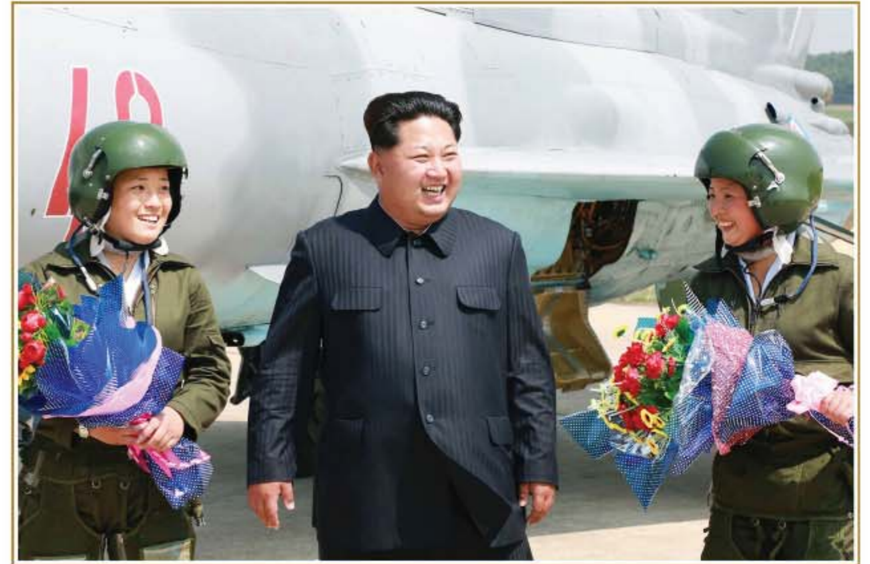
Kim Jong Un congratulates women pilots of supersonic fighters on their successful flight drills [June Juche 104 (2015)].

soldiers, acquaints himself with their living conditions and takes necessary measures. Caring for their innermost thought to be reluctant to part with him, he has photos taken with them for a long time, standing every one of them