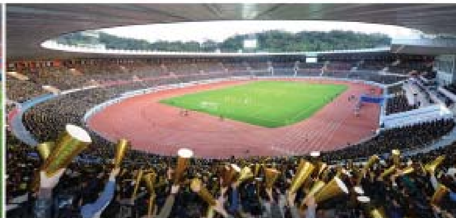
The stadium is furnished with facilities for sporting and cultural activities as well as welfare services, and plays host to national political and cultural events, to say nothing of international and domestic sports games.