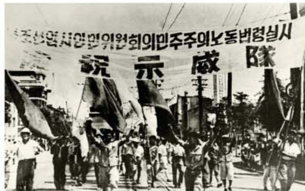
Democratic reforms, including the proclamation of the laws on agrarian reform and labour, were enforced, making the working people masters of the land and factories.