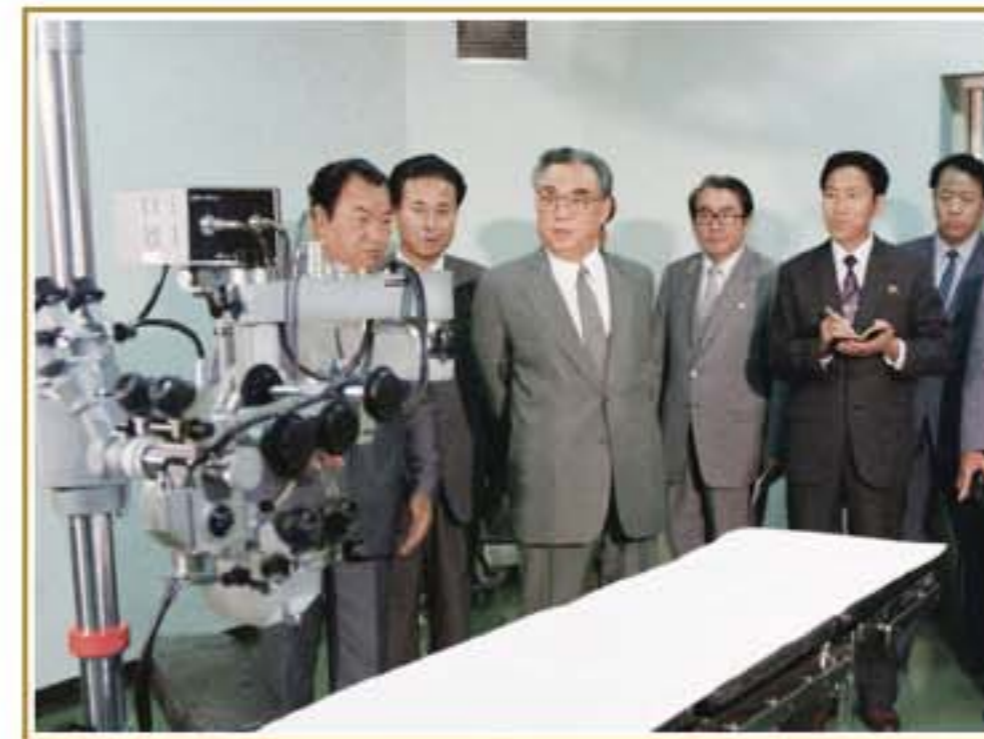
Kim Il Sung looks round the Kim Man Yu Hospital [June Juche 75 (1986)].