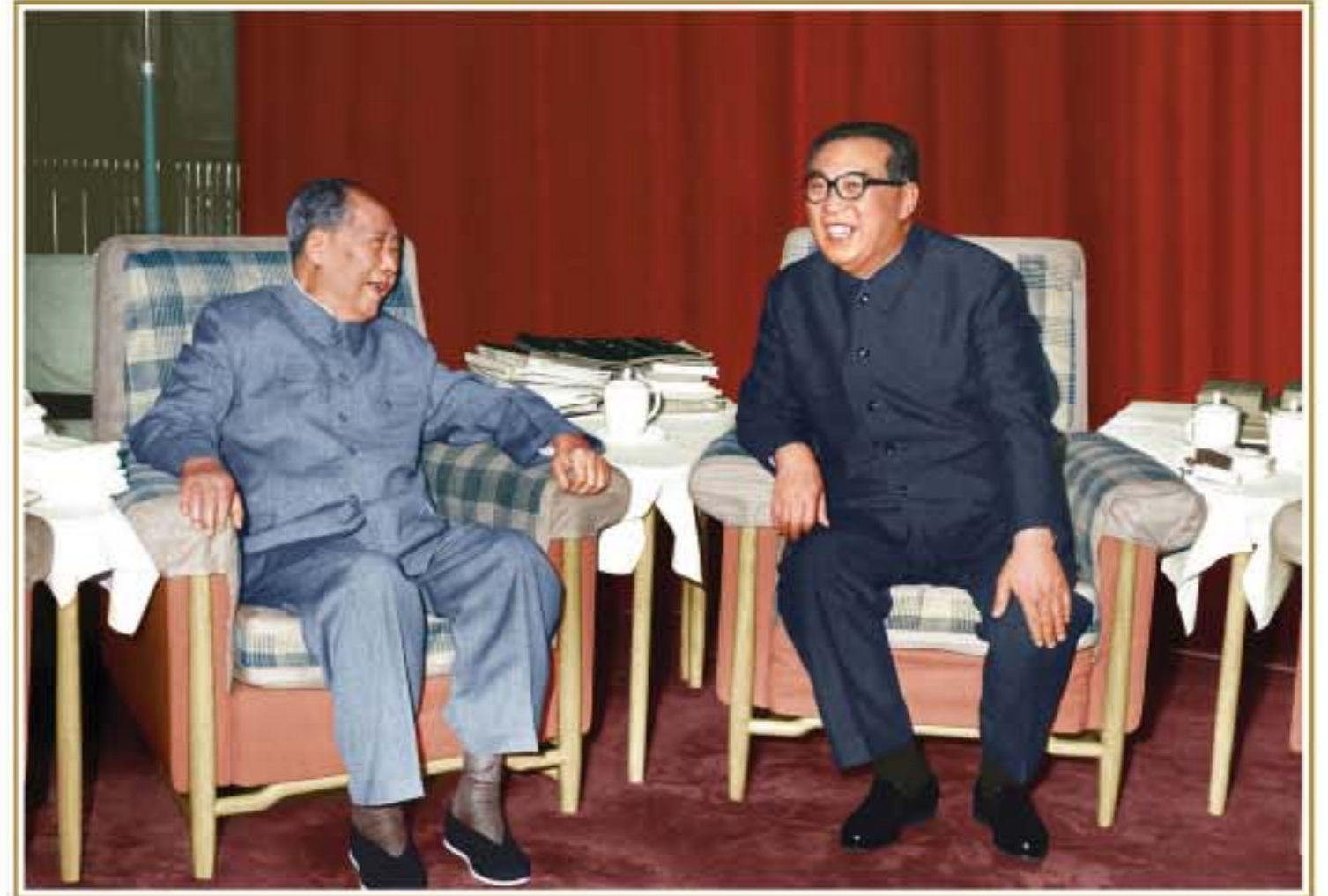
Kim Il Sung talks with Chairman Mao Zedong of the People's Republic of China [April Juche 64 (1975)].