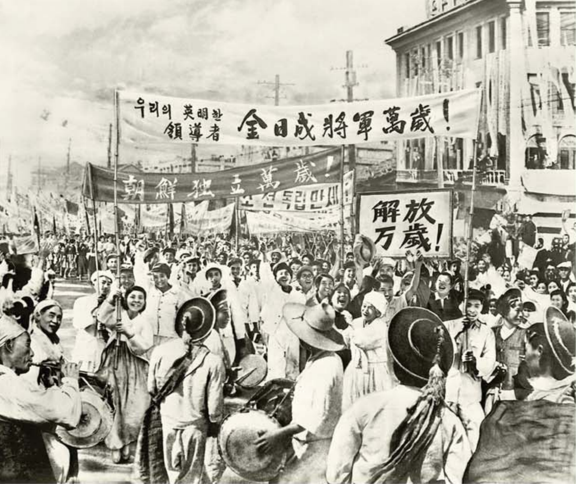
Rejoicing over the national liberation.