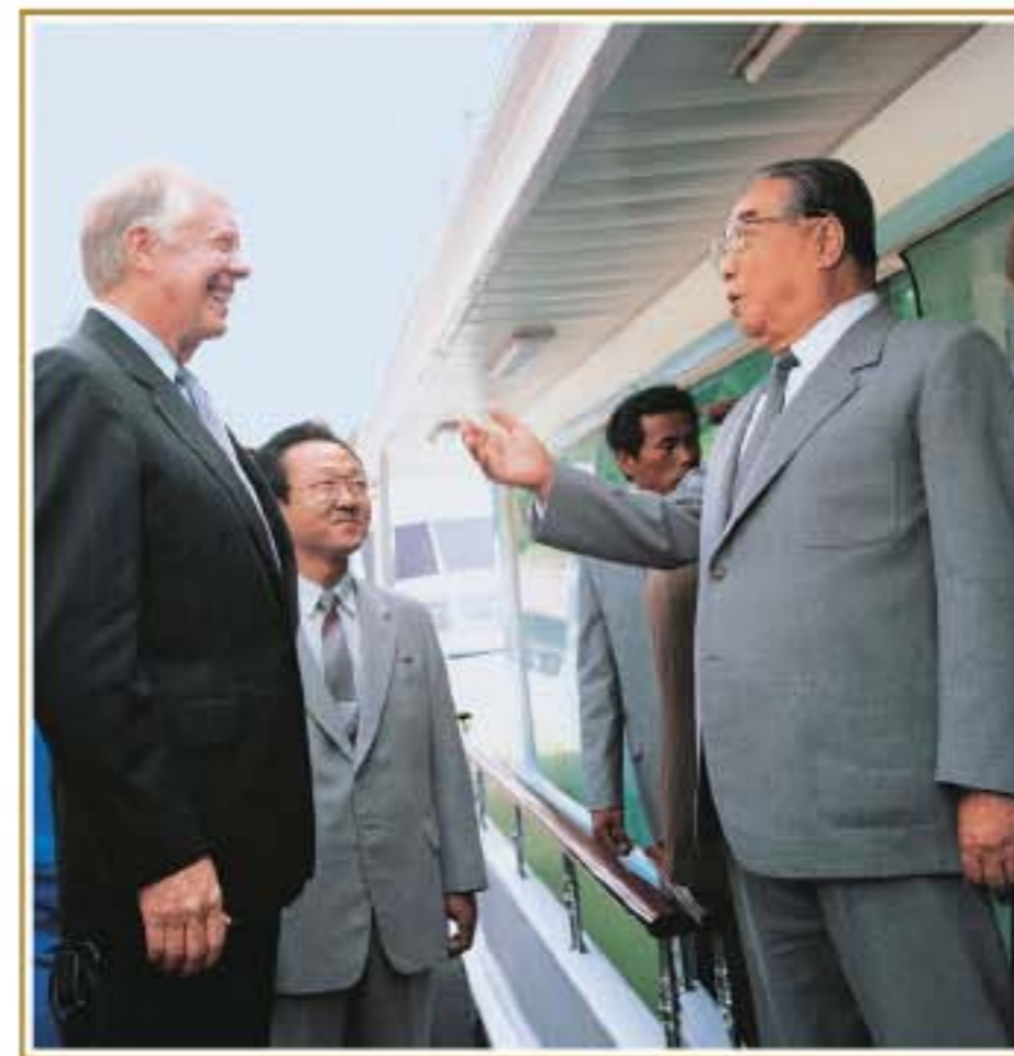
Kim Il Sung meets former US President Jimmy Carter [June Juche 83 (1994)].