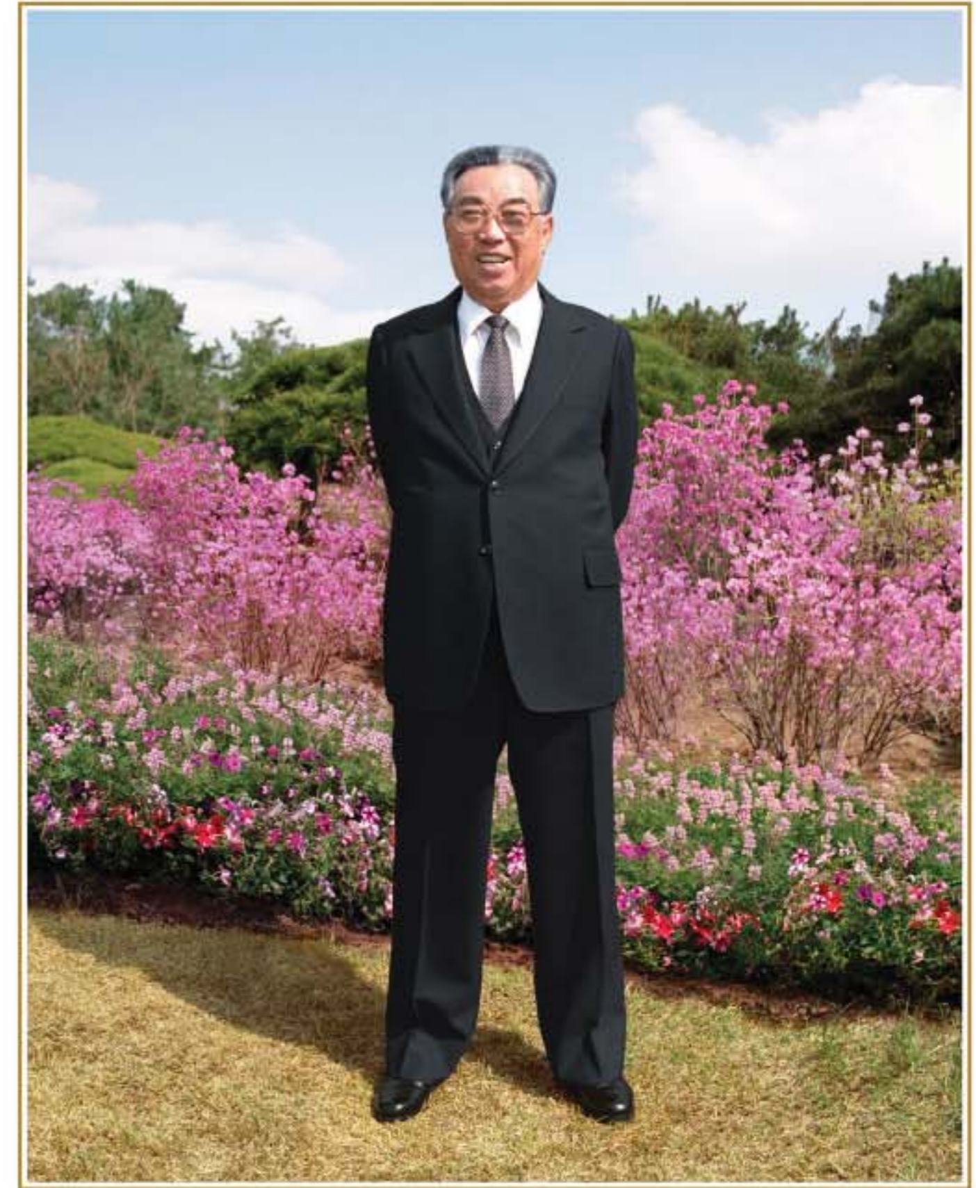
Kim Il Sung, great leader of the Korean people.