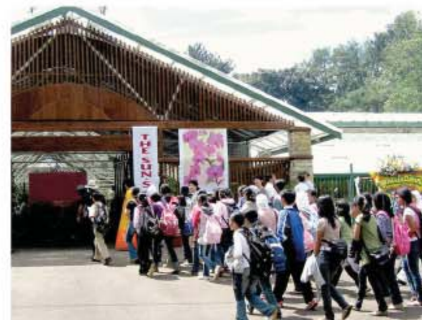
Bogor Botanical Garden in Indonesia is the birthplace of Kimilsungia, immortal flower.