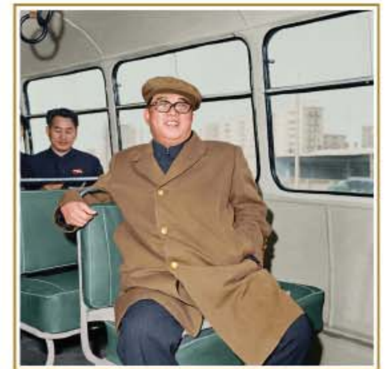
Kim Il Sung tours Pyongyang on a newly manufactured trolley-bus [April Juche 61 (1972)].