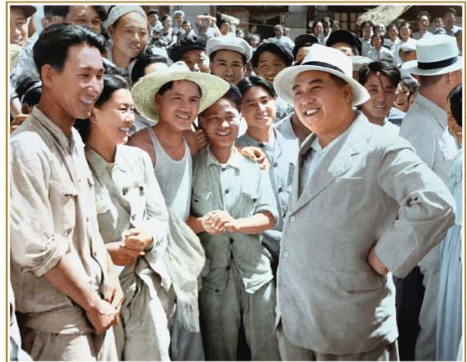
Kim Il Sung meets the teaching staff and students of Kim Il Sung University who are seconded to the city construction [June Juche 46 (1957)].

Since he began his revolutionary career by going among the people, the