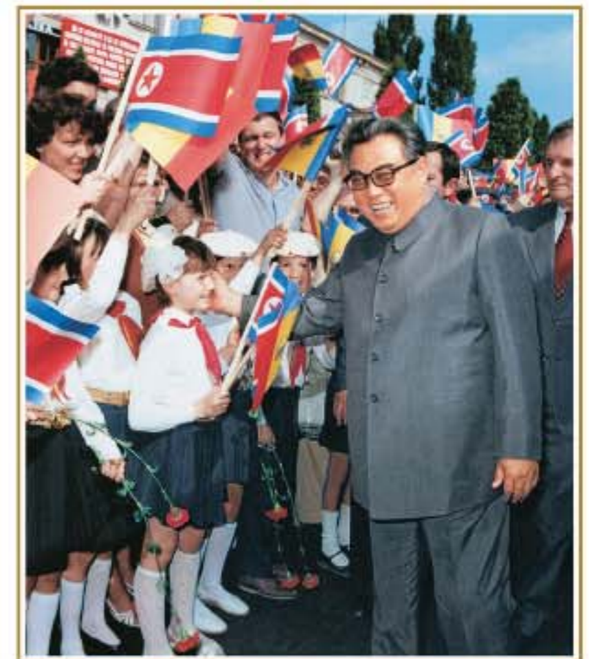
Kim Il Sung receives enthusiastic welcome on his visits to foreign countries.