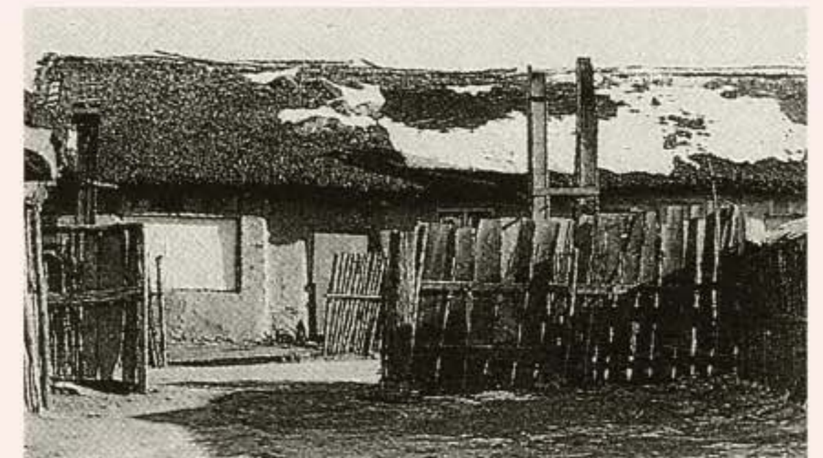
The house where Kang Pan Sok guided the work of the Anti-Japanese Women's Association.