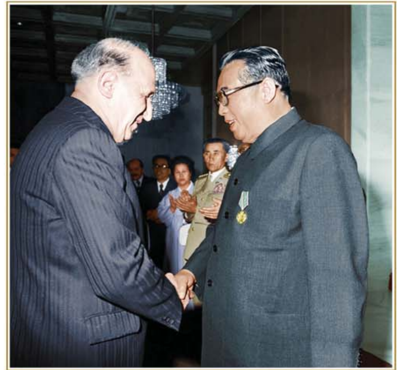
Kim Il Sung is awarded a medal by Todor Zhivkov, President of the State Council of the People's Republic of Bulgaria [June Juche 64 (1975)].