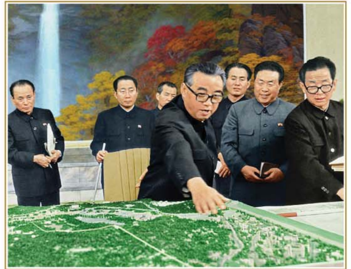
Kim Il Sung unfolds a far-reaching plan of the city construction [November Juche 71 (1982)].

President continued to visit his people until the last days of his life. From the period of building a new country after the national liberation to the last time of his great life, he visited over 20 600 units for more than 8 650 days, the distance of his field guidance trip topping over 578 000 km.