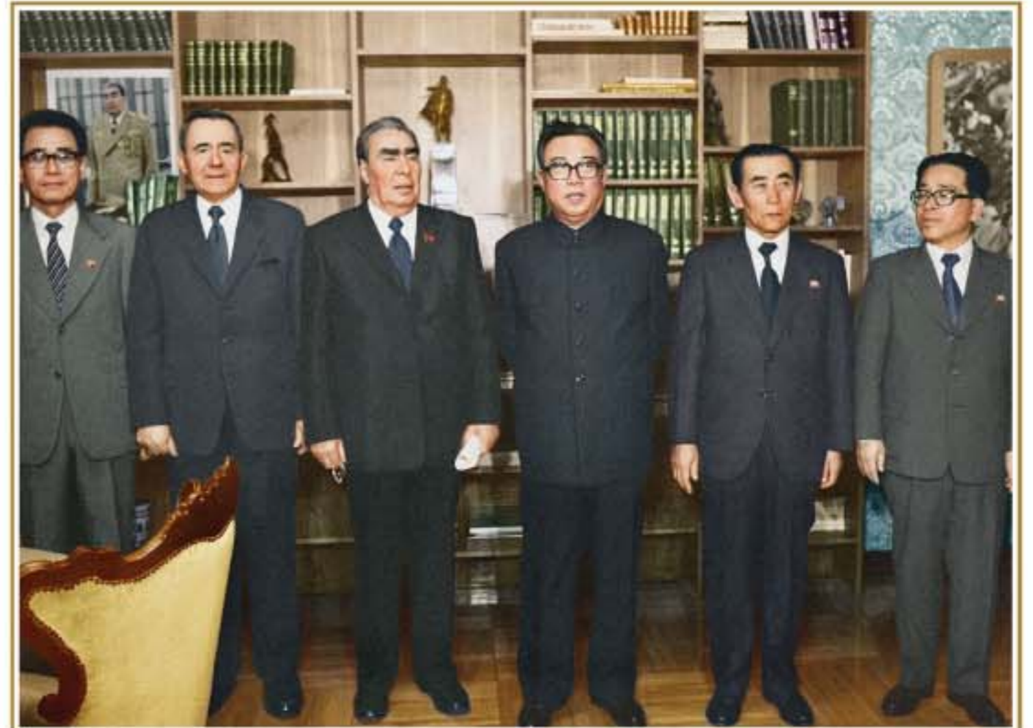
Kim Il Sung poses for a photograph with L. I. Brezhnev, General Secretary of the Communist Party of the Soviet Union [May Juche 69 (1980)].