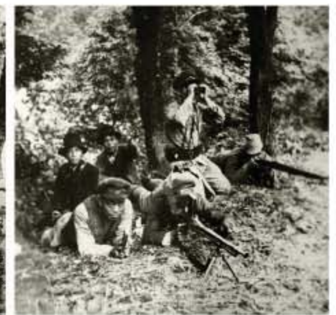
The anti-Japanese armed struggle organized and waged under the leadership of Kim Il Sung won great victory, defeating the Japanese militarism, and the Korean people achieved the national liberation.