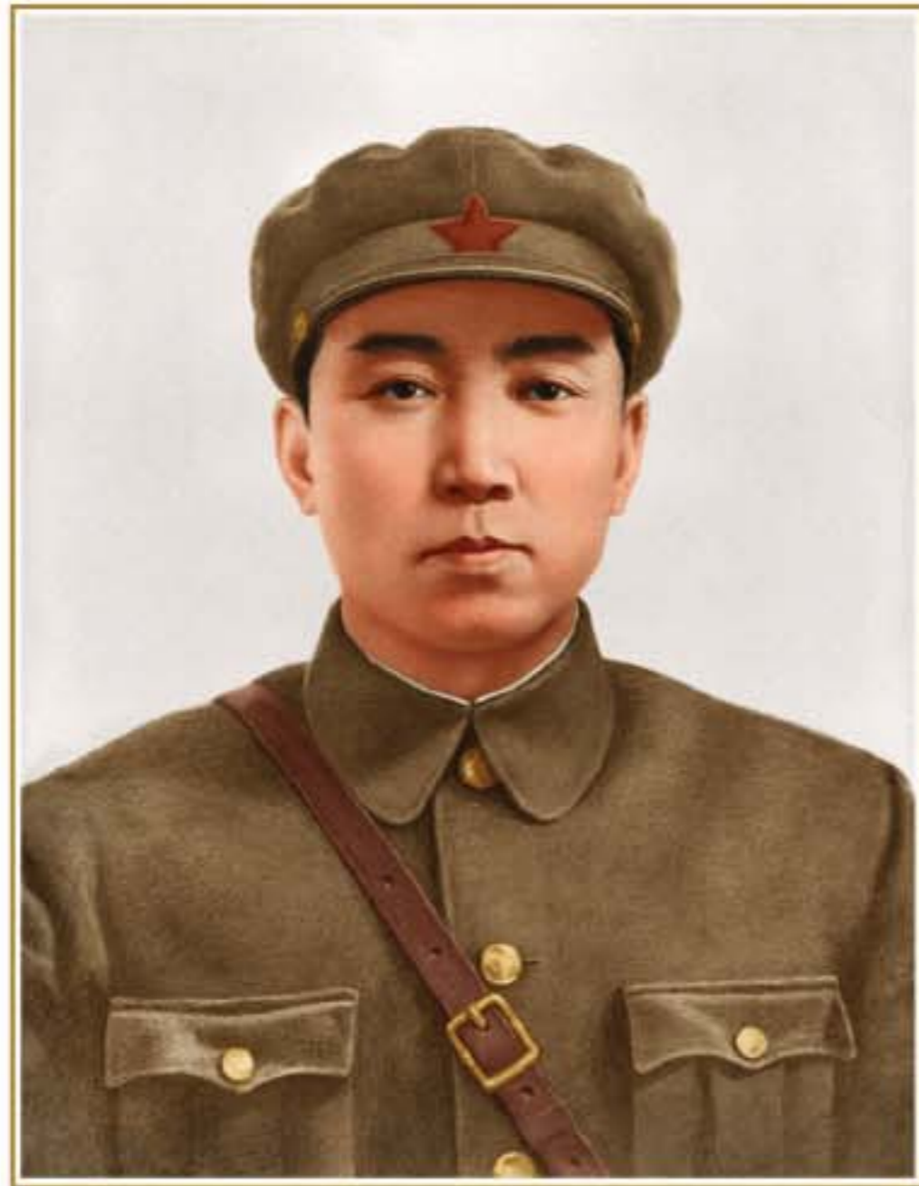
Kim Il Sung in the days of founding the Anti-Japanese People's Guerrilla Army (AJPGA).