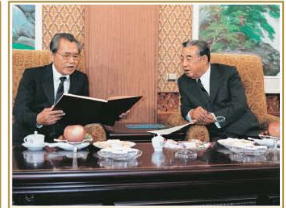
Kim Il Sung meets Yun I Sang, an overseas Korean composer [October Juche 76 (1987)].