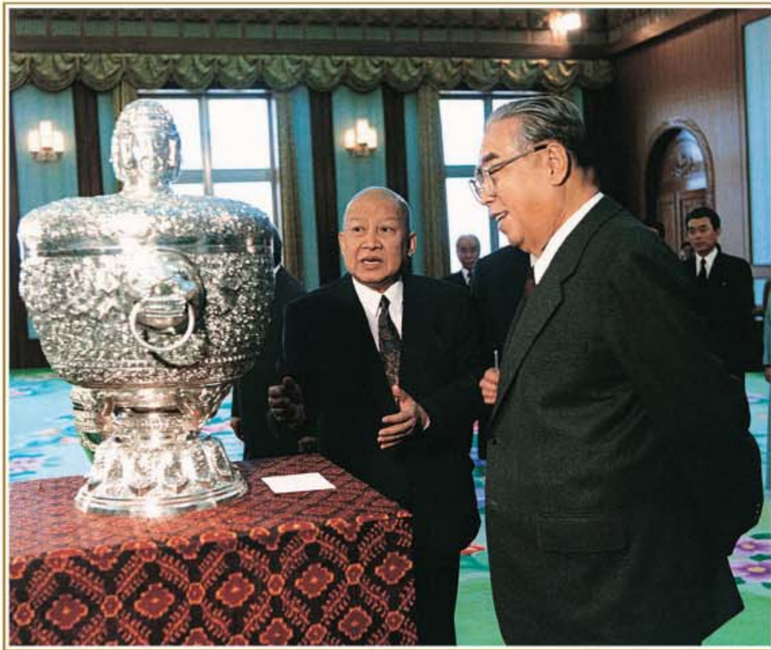
Kim Il Sung sees the gift presented by King Norodom Sihanouk of Cambodia [April Juche 83 (1994)].