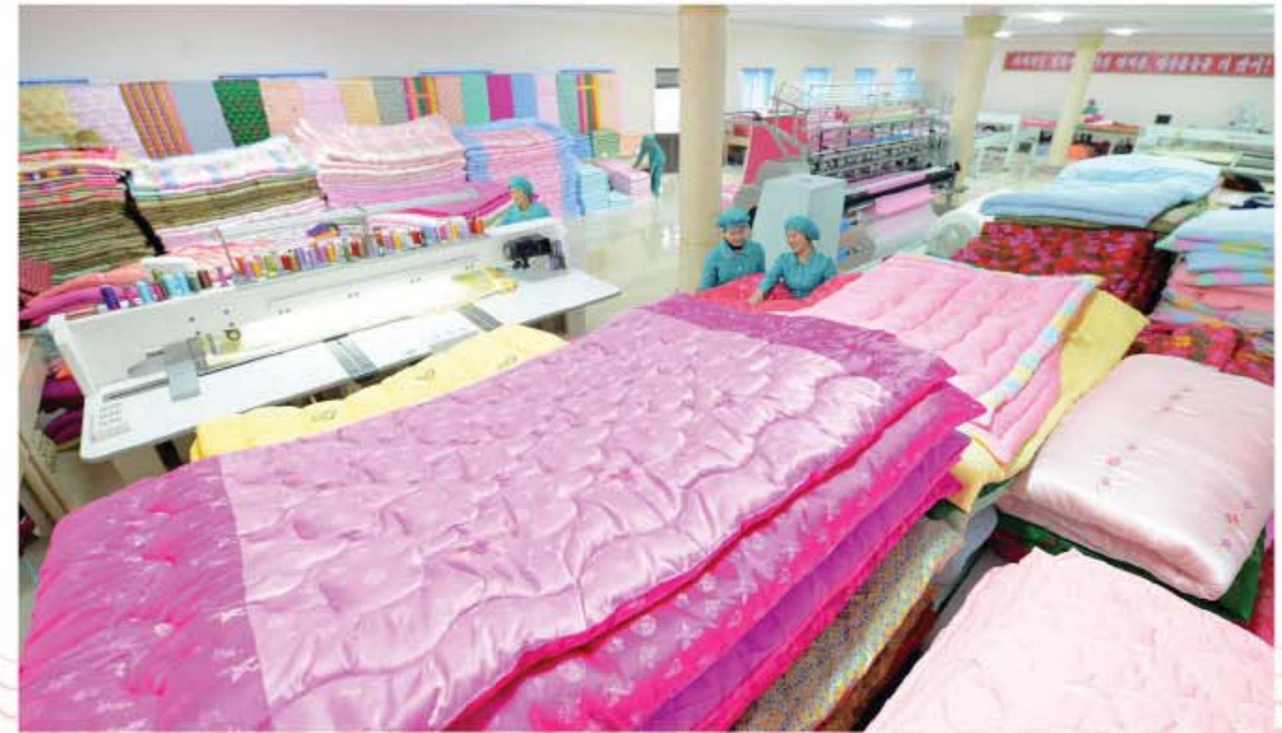
A variety of quality quilts are produced to satisfy the tastes and feelings of the people.