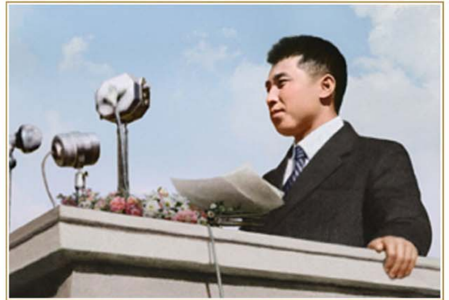
Kim Il Sung delivers a speech at the Pyongyang mass rally held to welcome his triumphal return home [October Juche 34 (1945)].

always emerged victorious in fierce battles.