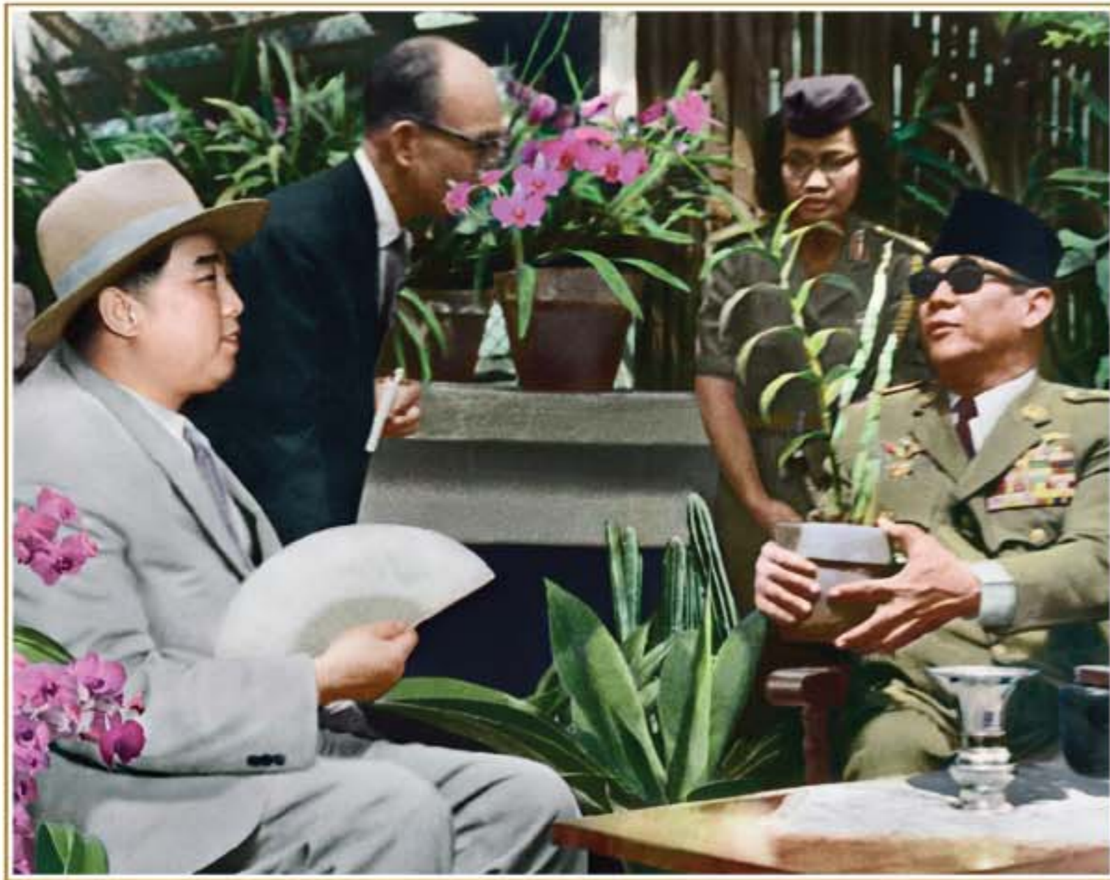
Kim Il Sung sees Kimilsungia presented by President Sukarno of Indonesian Republic [April Juche 54 (1965)].