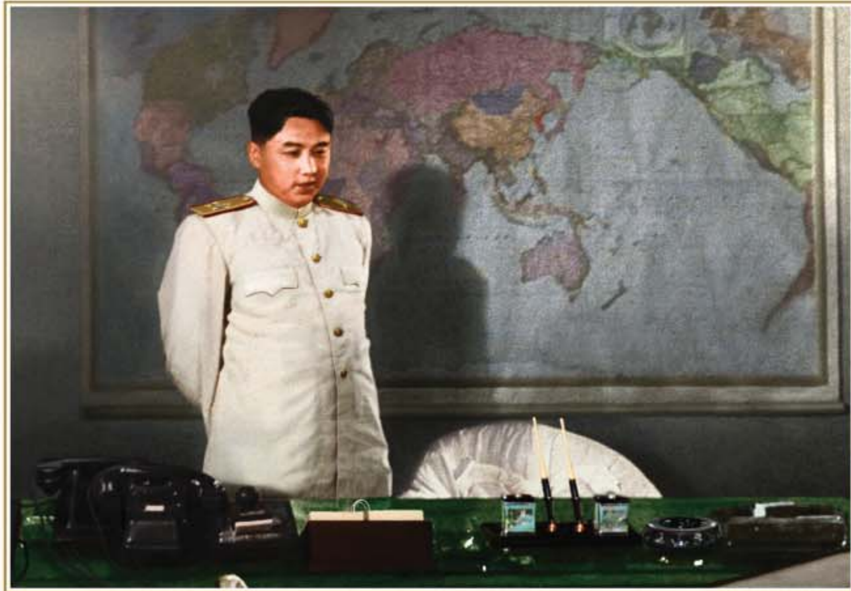
Kim Il Sung, brilliant commander who led the Fatherland Liberation War to victory [July Juche 42 (1953)].