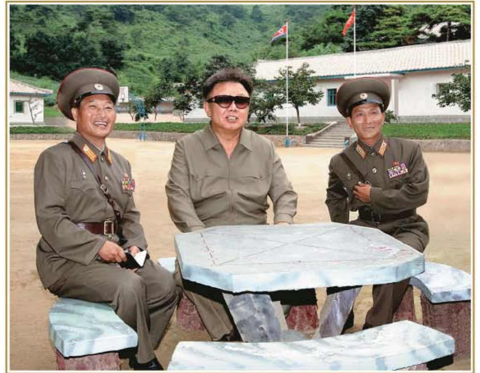
Kim Jong Il enjoys an artistic performance given by the service personnel of a KPA unit [August Juche 95 (2006)].