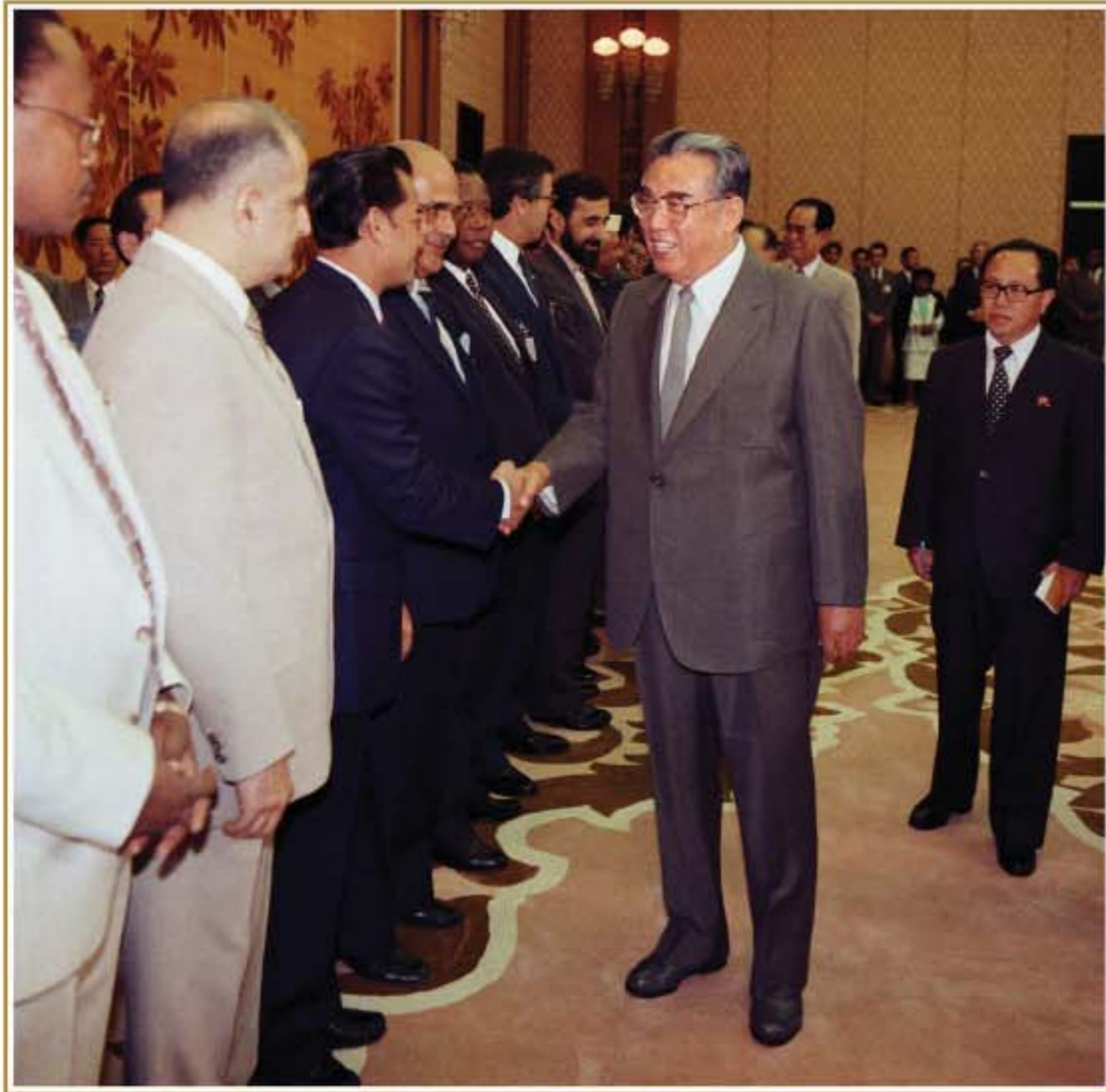
Kim Il Sung meets the participants in the extraordinary ministerial conference of non-aligned countries on south-south cooperation [June Juche 76 (1987)].