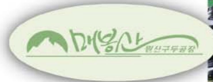
The factory's Maebongsan-brand leather shoes are produced in large amounts.