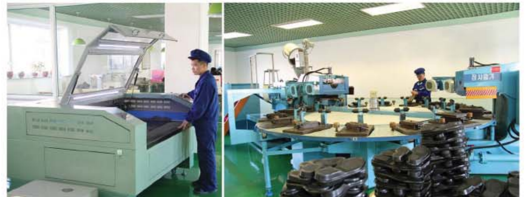
Highly efficient machines and equipment are manufactured by the factory's own efforts to put the production on a normal footing.