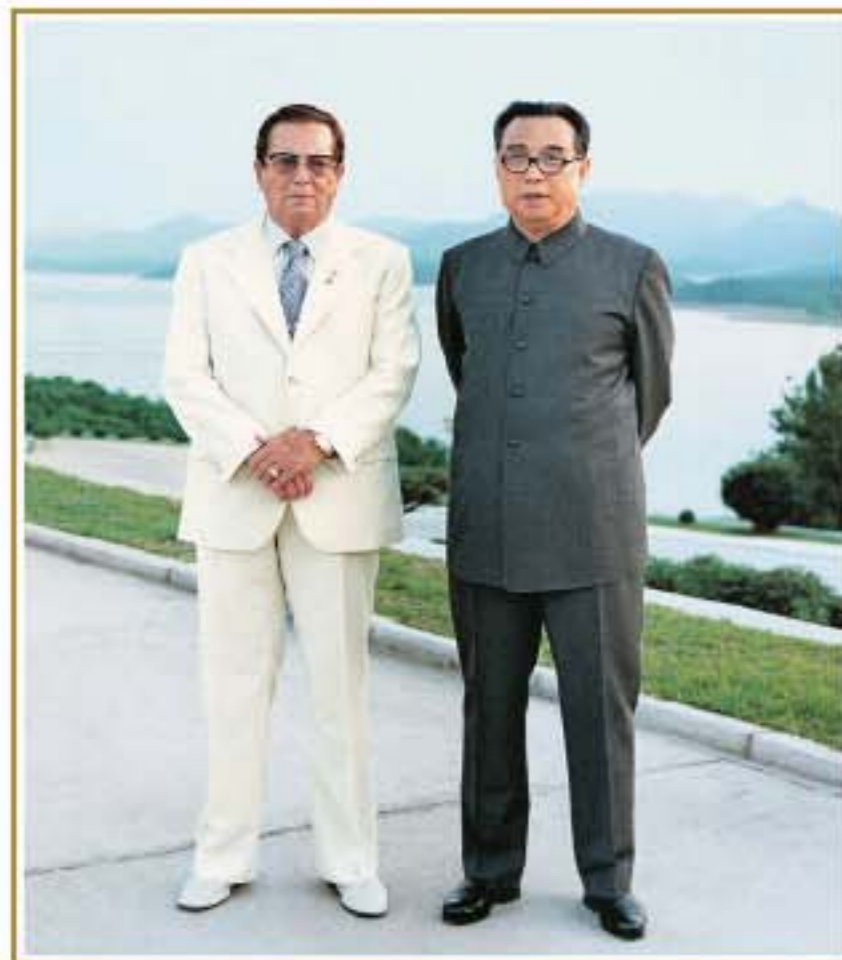
Kim Il Sung poses for a photograph with Josip Broz Tito, President of the Federal People's Republic of Yugoslavia, who visited the DPRK [August Juche 66 (1977)].