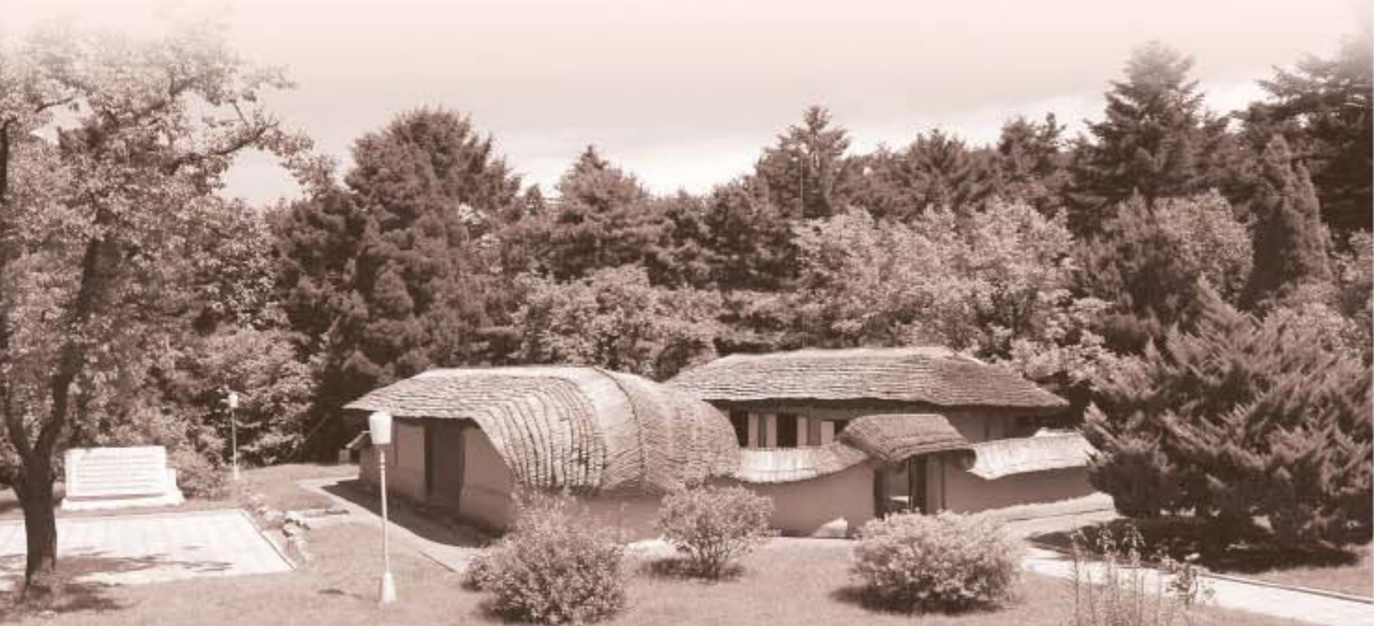
Kang Pan Sok's birthplace at Chilgol.

My mother's whole life served as a textbook for me in implanting in me a true view on life and on the revolution.