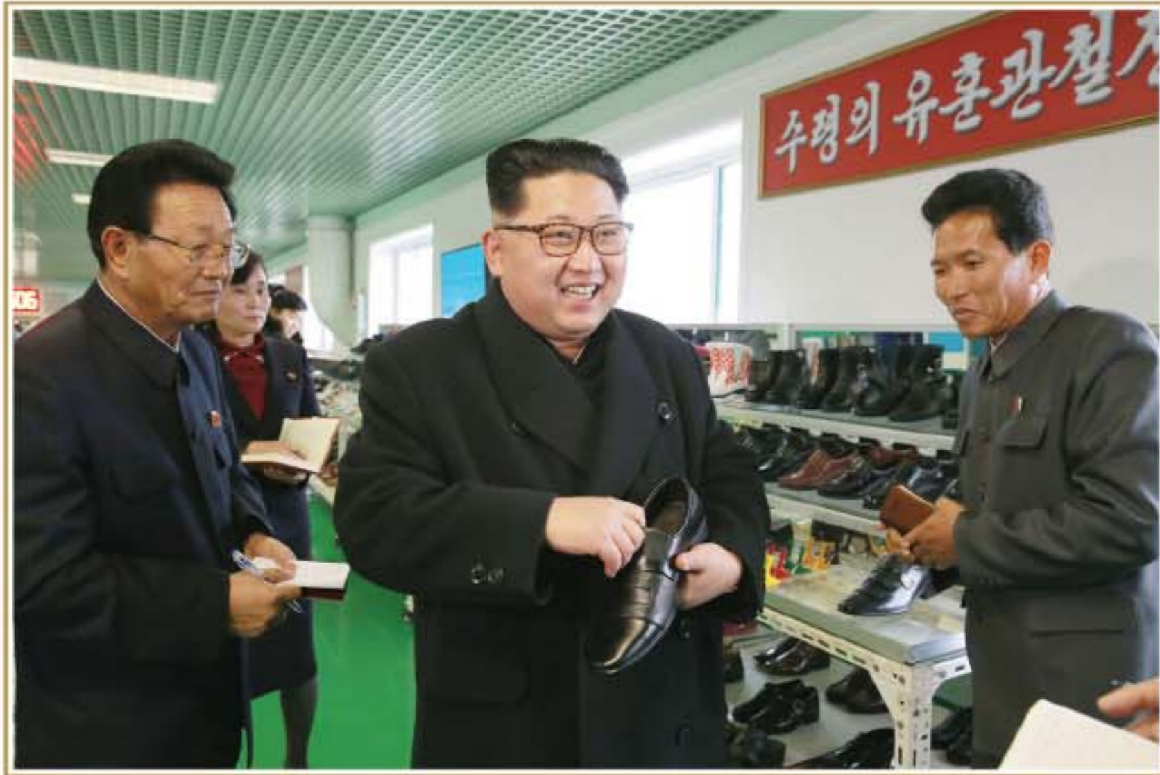
Supreme Leader Kim Jong Un gives on-site guidance at the Wonsan Leather Shoes Factory [December Juche 105 (2016)].

With the Great Spirit of Self-reliance and Self-development as the Dynamic Force