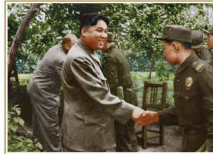
Kim Il Sung meets model combatants [June Juche 40 (1951)].