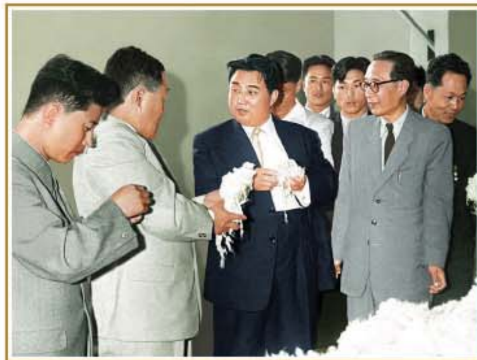
Kim Il Sung gives on-site guidance at the February 8 Vinalon Factory [October Juche 50 (1961)].