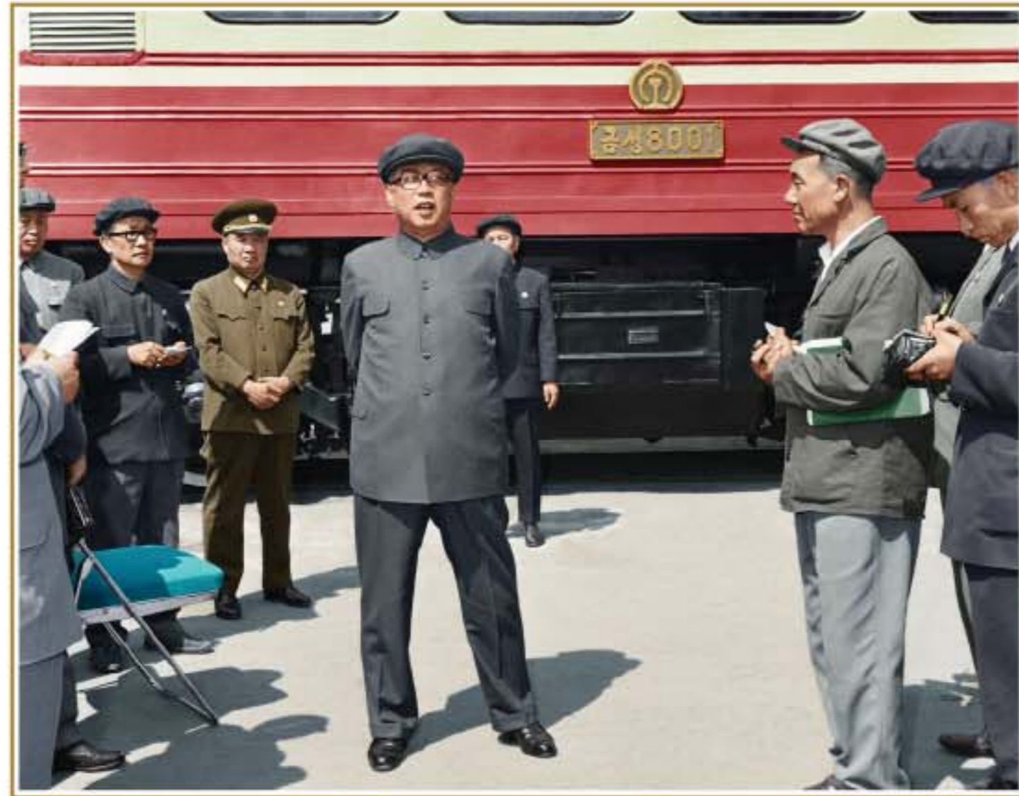
Kim Il Sung sees a diesel locomotive Kumsong newly manufactured at the Kim Jong Thae Electric Locomotive Factory [May Juche 64 (1975)].