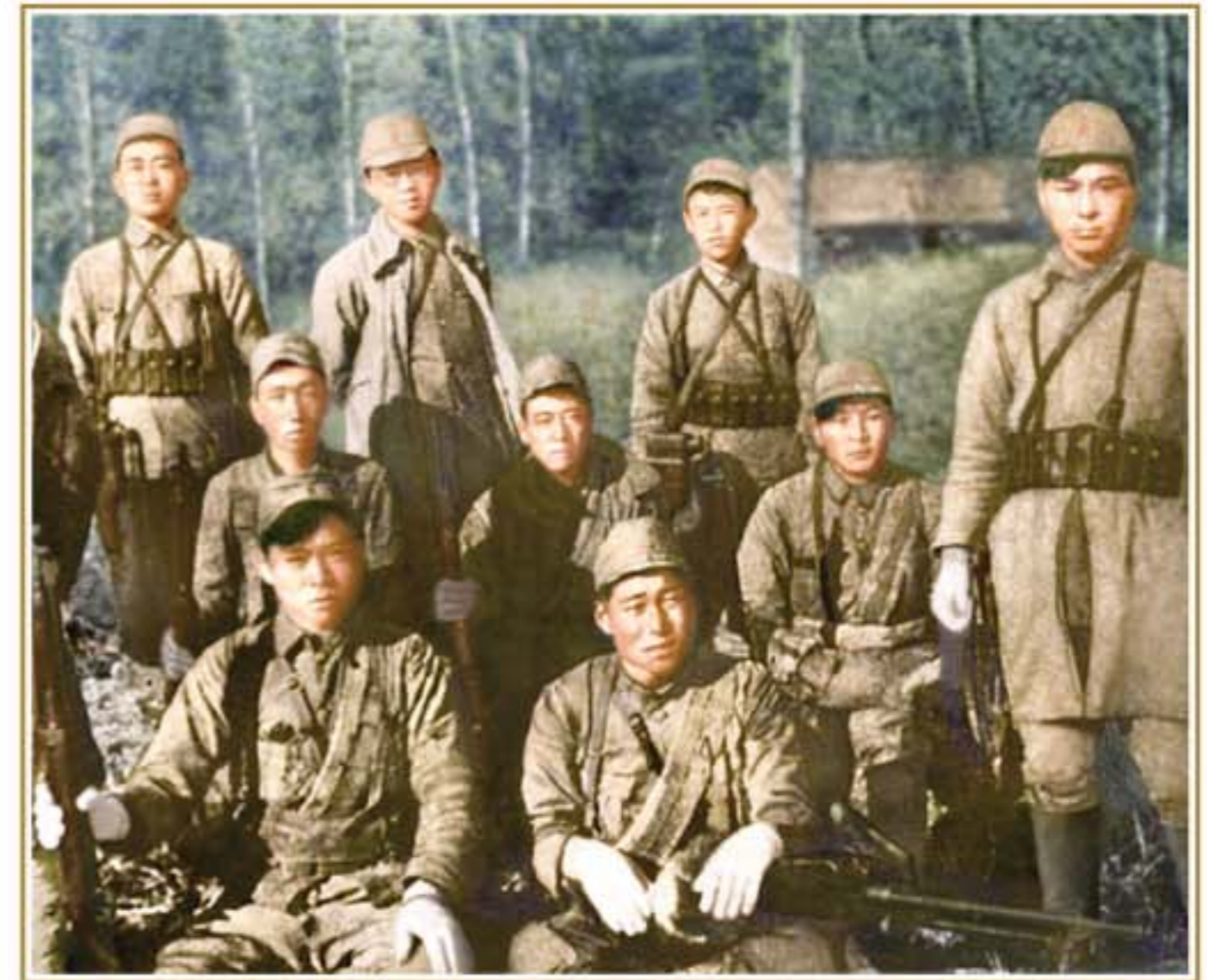
Kim Il Sung among the soldiers of the Korean People's Revolutionary Army (standing in the middle of the back row).

He put forward an original military idea of overwhelming the numerical and technical superiority of the enemy that was armed to teeth, with the political and ideological, strategic and tactical superiority of the revolutionary army. He consistently held fast to it in the whole course of the armed struggle, created and developed new strategic and tactical principles and combat methods as appropriate to guerrilla warfare, and