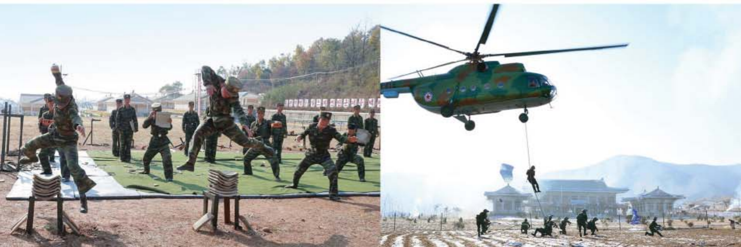
The KPA service personnel have prepared themselves as a-match-for-a-hundred combatants in the embrace of brilliant Songun commanders.