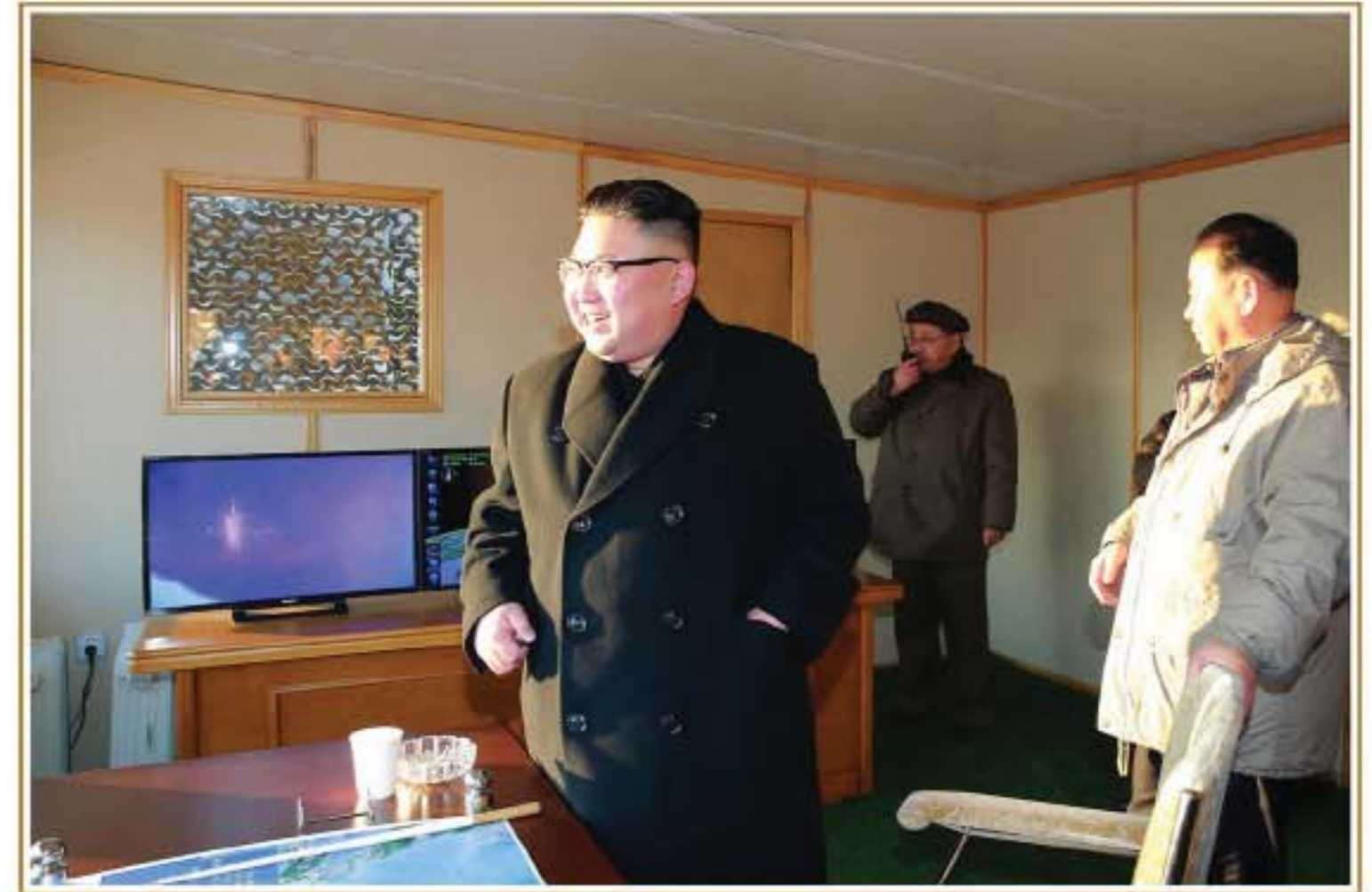
Supreme Leader Kim Jong Un guides on the spot the test-fire of a new strategic weapon [February Juche 106 (2017)].