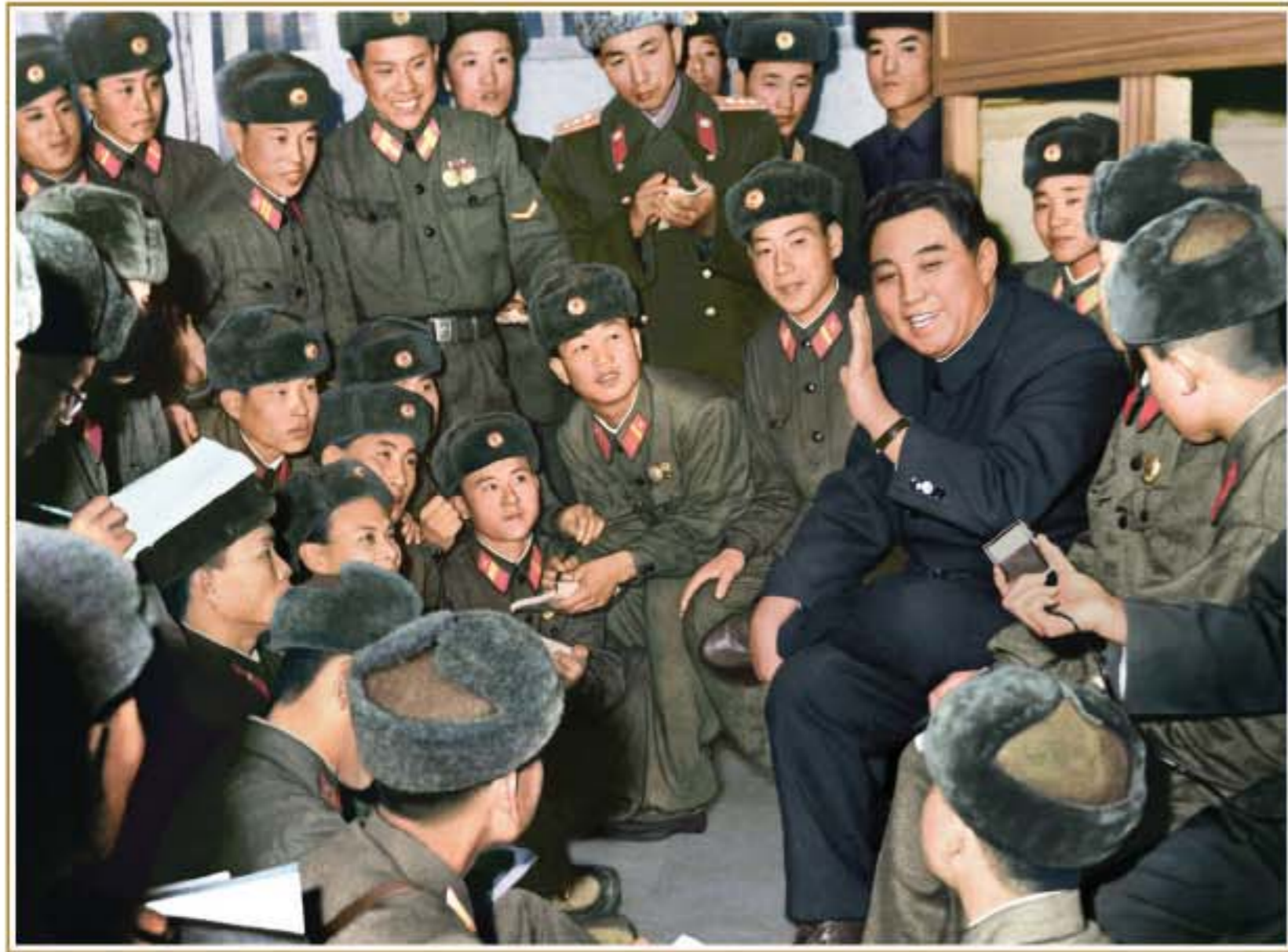
Kim Il Sung among the service personnel of the Korean People's Army [February Juche 55 (1966)].