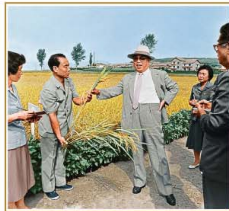
Kim Il Sung gives on-site guidance at the Chongsan Cooperative Farm [September Juche 76 (1987)].