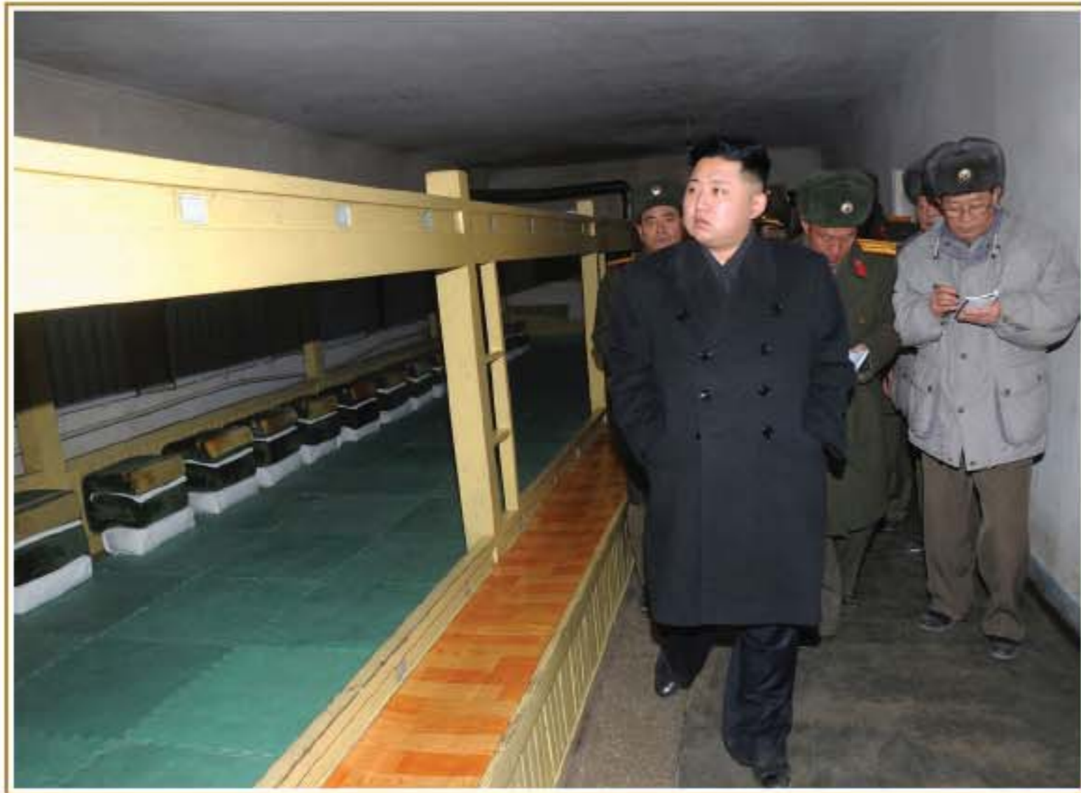
Kim Jong Un looks round the barracks of a KPA company [February Juche 101 (2012)].

Commander, as well as the officers, exists for them, the Supreme Leader regards the service personnel as his revolutionary comrades-in-arms and comrades. When inspecting the army units and posts, he sees first the rank-and-file