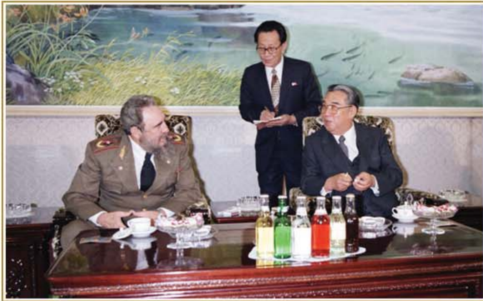
Kim Il Sung talks with Fidel Castro Ruz, President of the Council of State and the Council of Ministers of the Republic of Cuba [March Juche 75 (1986)].