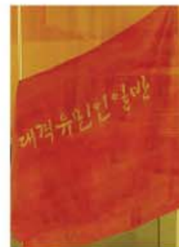
The flag of the AJPGA when it was founded on April 25, Juche 21 (1932).