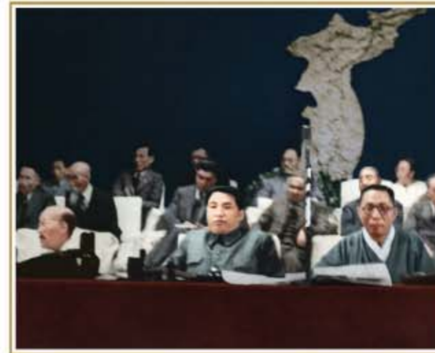
Kim Il Sung presides over the Joint Conference of Representatives of Political Parties and Public Organizations in North and South Korea [April Juche 37 (1948)].