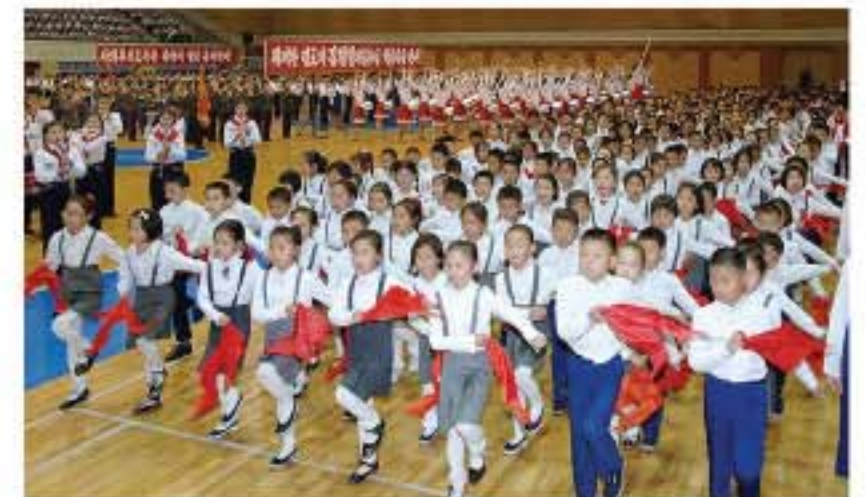
A joint national meeting of the Korean Children's Union organizations.