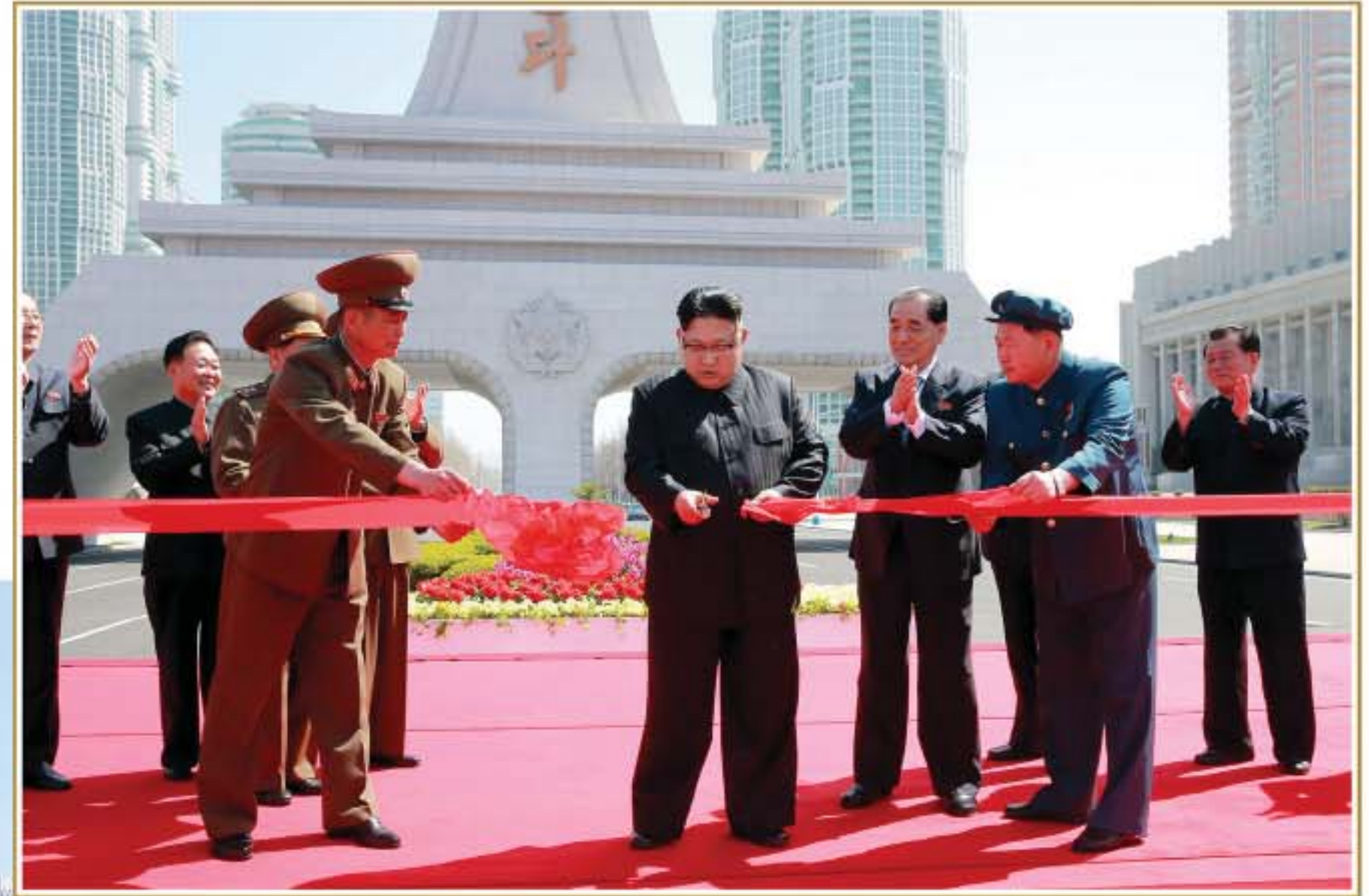
The respected Supreme Leader Kim Jong Un cuts the tape to inaugurate Ryomyong Street [April Juche 106 (2017)]

When Supreme Leader Kim Jong Un cut the tape to inaugurate the new street amid the playing of welcome music, the participants raised cheers, rending heaven and earth, and thousands of colourful balloons soared into the