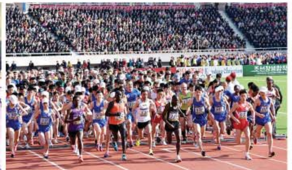
The 28th Mangyongdae Prize International Marathon.