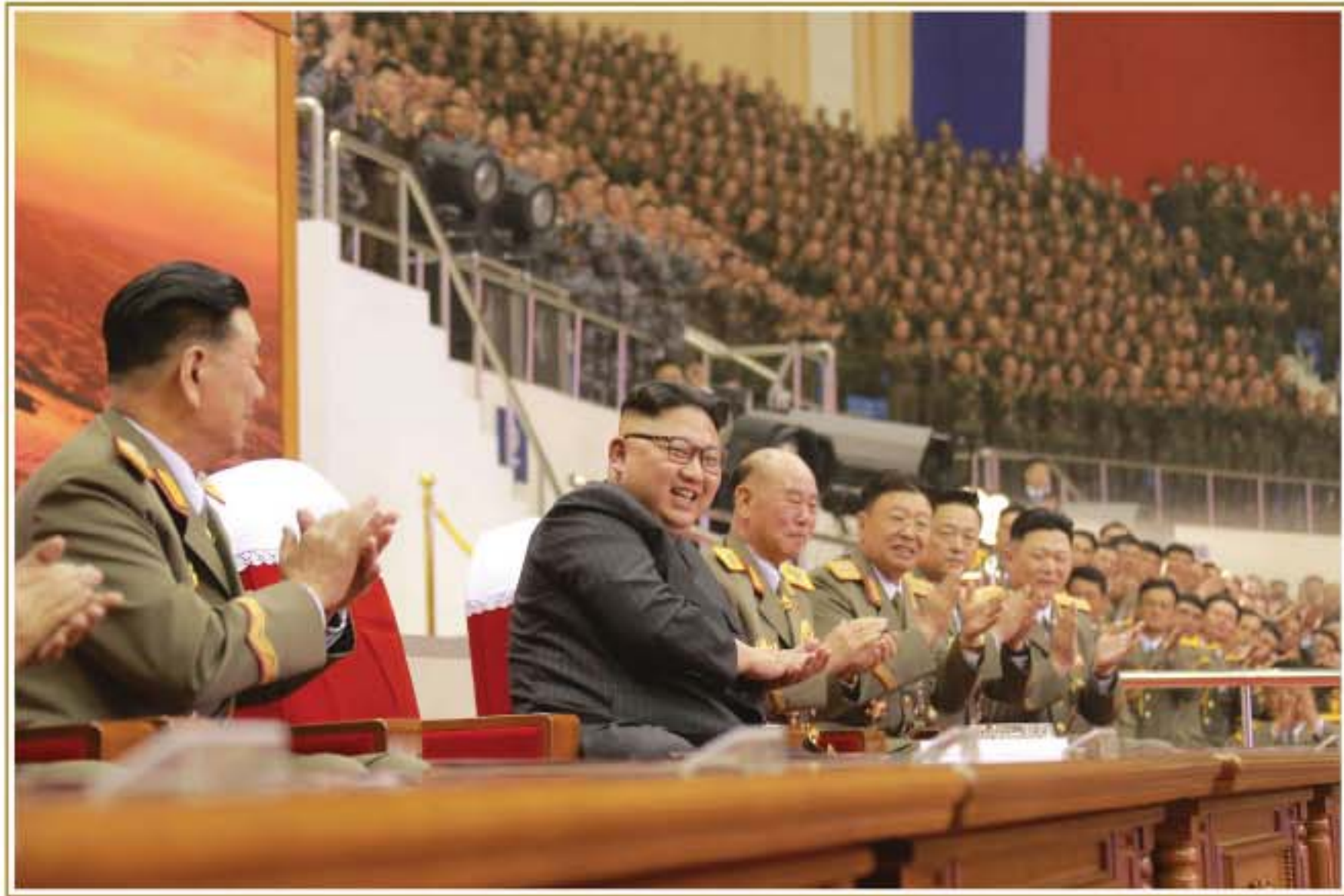
Supreme Leader Kim Jong Un enjoys the performance of the State Merited Chorus given in honour of the participants in the military parade held to celebrate the 105th birth anniversary of President Kim Il Sung [April Juche 106(2017)]

The State Merited Chorus, winner of Kim Il Sung Prize, gave a congratulatory performance on April 16 in honour of the participants in the military parade held to mark the 105th anniversary of the birth of President Kim Il Sung.