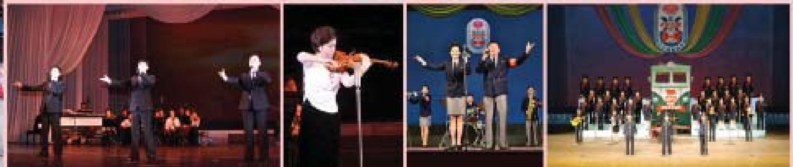
The people's art festival highly praises the undying exploits of the peerlessly great persons of Mt Paektu and fully demonstrates the Juche-oriented art which develops in a comprehensive way.