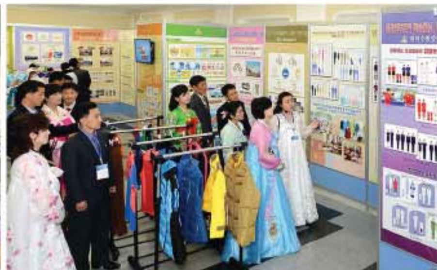
A national industrial design exhibition held to mark the Day of the Sun.