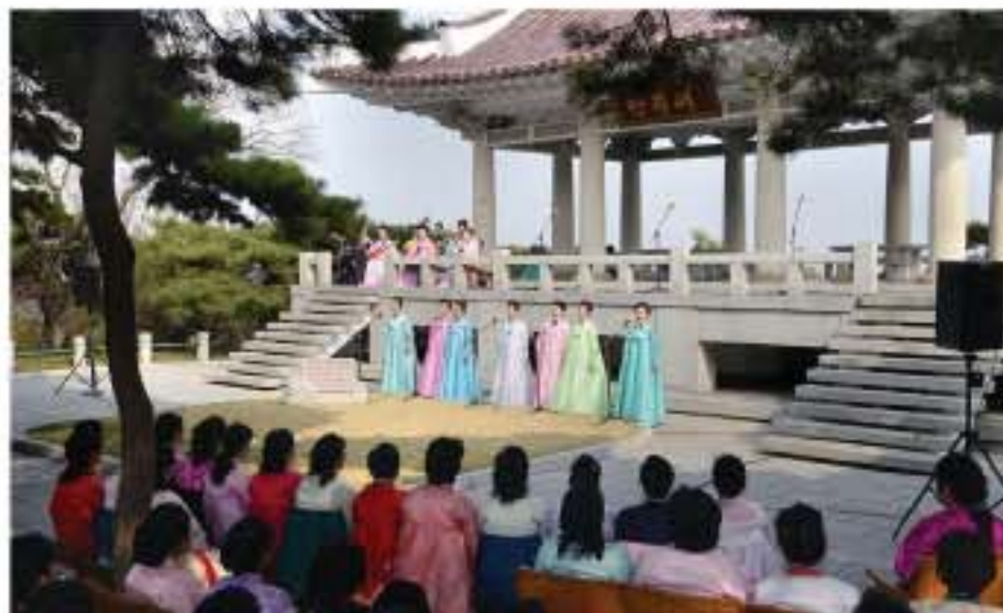
Poem recital and singing event Song of Mangyongdae given by officials and members of the women's union.