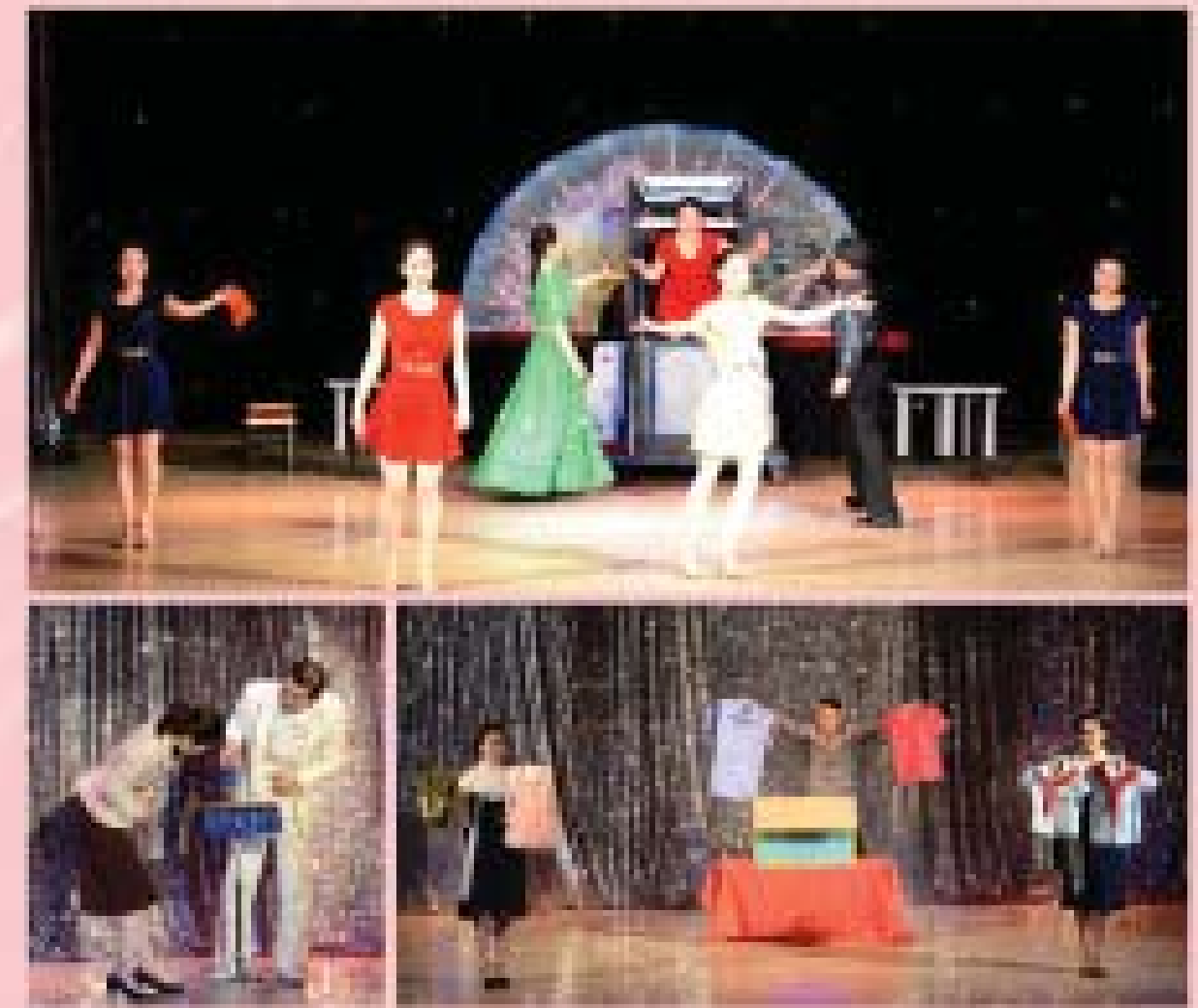
Performance of the art troupes, art squads and amateur magicians.