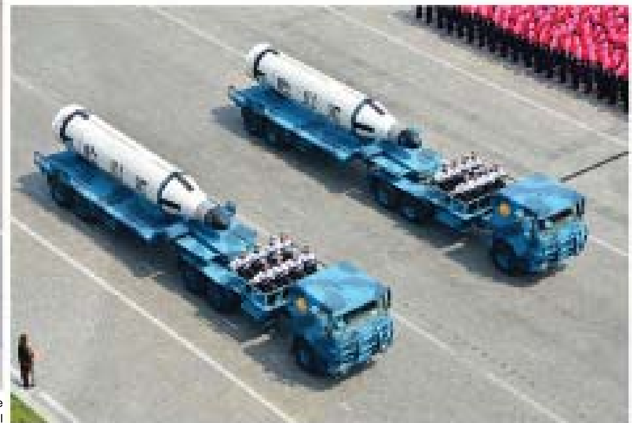
Nuclear weapons and strike means which are small, precise and varied fully demonstrate the unyielding spirit of the Korean People's Army to annihilate at a stroke on the ground, in the air, at sea and even under the sea, and reduce to ashes the enemy's strongholds of aggression and provocations if they dare violate national sovereignty and the right to existence of the DPRK.

He referred to the large-scale military parade and public procession as a proud report of loyalty the descendants of Kim Il Sung and the soldiers and disciples of Kim Jong Il present to the great leaders while carrying on their sacred revolutionary cause without an inch of deflection. He also stressed that no force in the world can check the grand advance of Juche Korea invariably rushing straight forward along the road of independence, Songun and socialism and that a country of socialism, an ideal society for the people, would be built on this land.