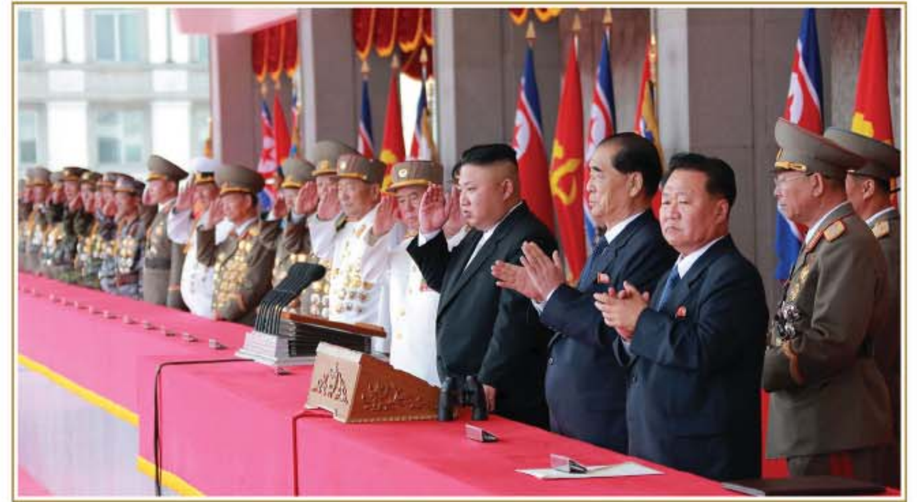
Supreme Leader Kim Jong Un salutes the military columns [April Juche 106 (2017)]

Amid the playing of welcome music, Supreme Leader Kim Jong Un appeared on the