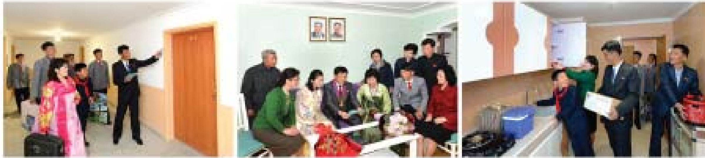
Lecturers and researchers at Kim Il Sung University and former residents are the first to move into the new flats.