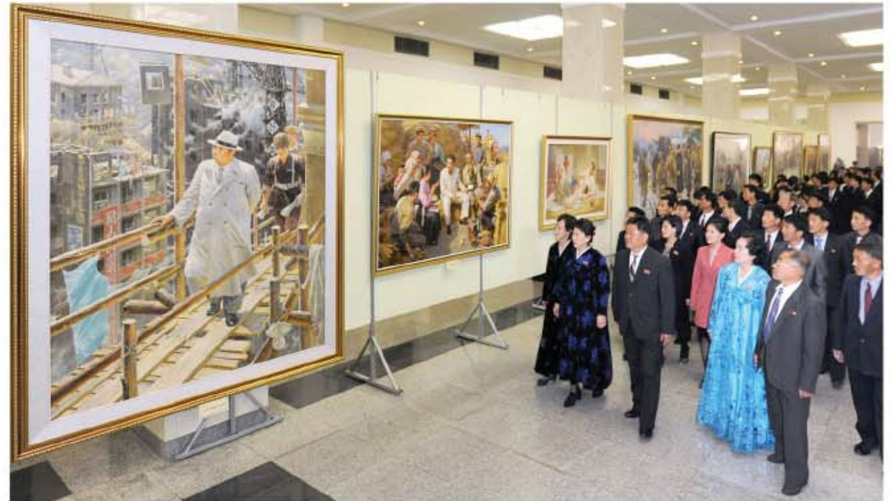
A national fine art show in celebration of the 105th birth anniversary of President Kim Il Sung.