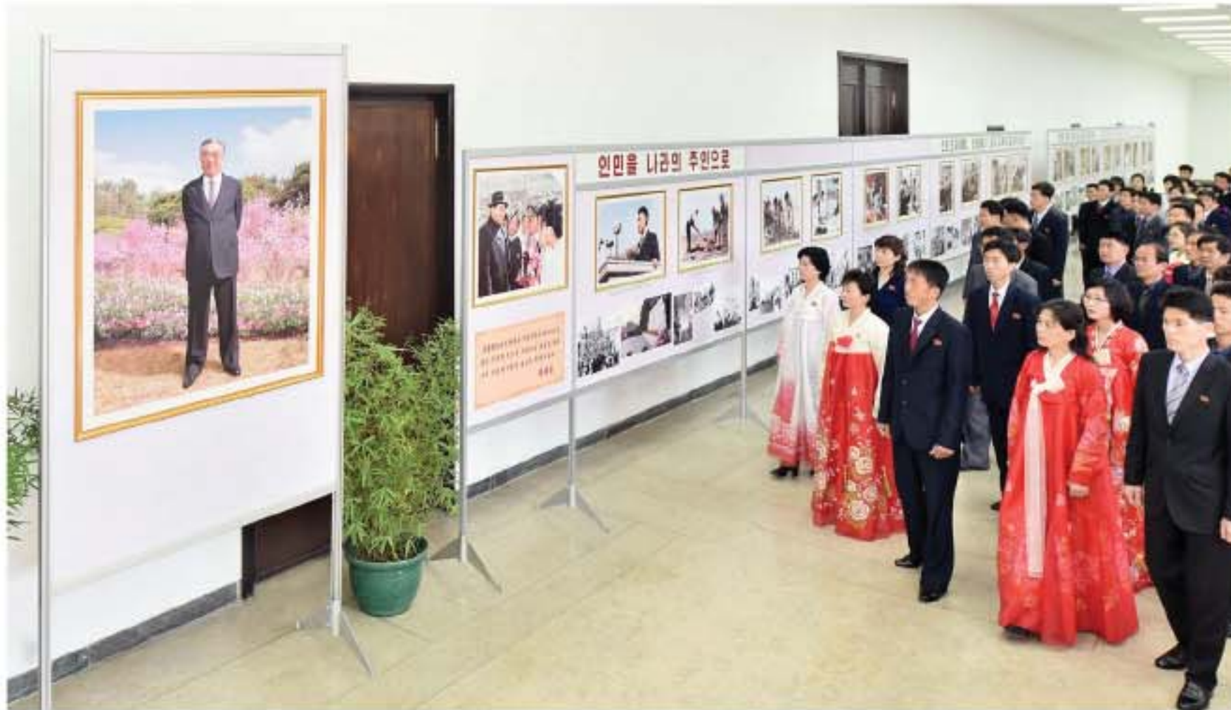
A national photo exhibition in celebration of the 105th birth anniversary of President Kim Il Sung.