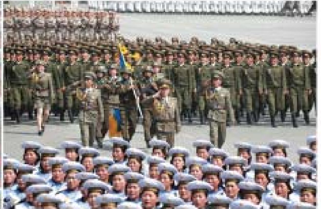
Columns of the KPA ground, naval, air and anti-aircraft, strategic forces and special operations corps, large combined units and infantry divisions at the first echelon of frontline army corps, and military schools at all levels, march in fine array, flying high the colours permeated with proud feats performed in national defence and anti-imperialist, anti-US showdowns.