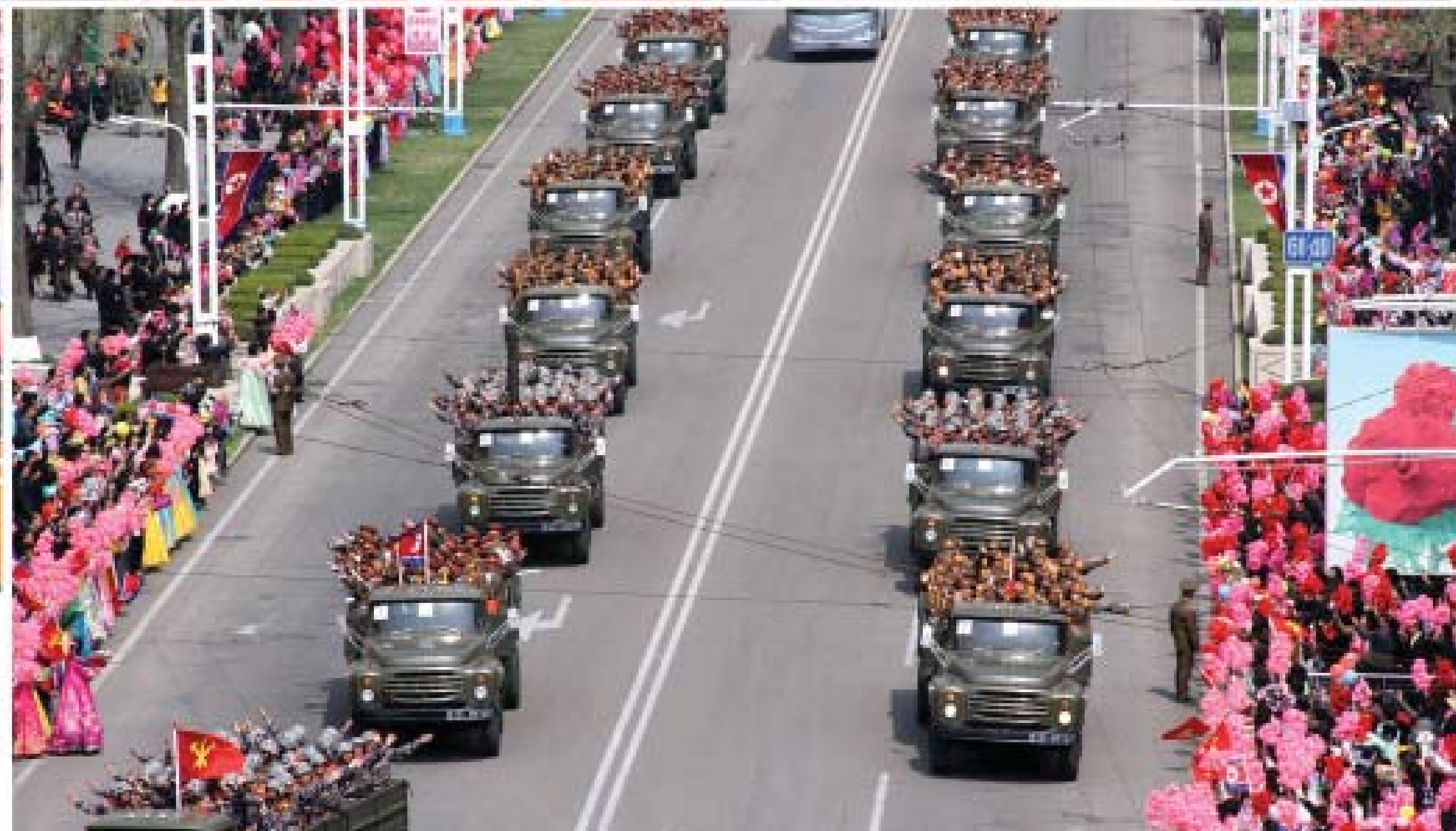
Pyongyang citizens give enthusiastic welcome to the participants in the military parade passing through the streets.