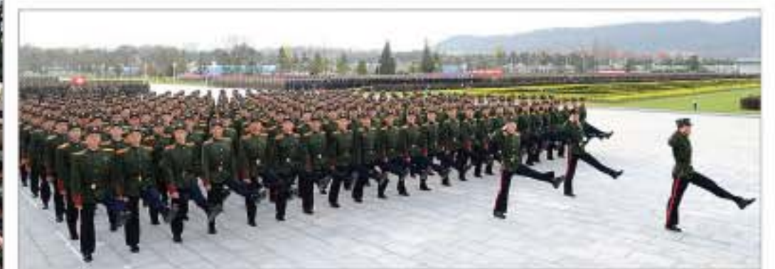
A march-past of service members of the ground, naval and air and anti-aircraft forces of the KPA, cadets from military academies at all levels and students from revolutionary schools.