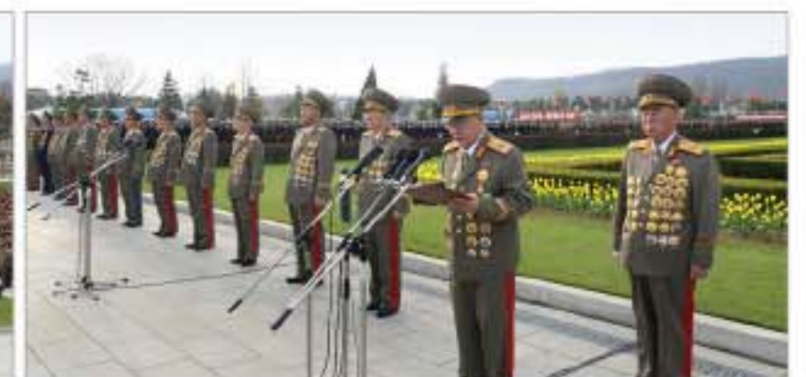
The KPA service personnel pay their highest tribute to Generalissimos Kim Il Sung and Kim Jong Il and firmly pledge to perform their mission and duty as the main force and standard-bearers of the Songun revolution in hastening the final victory of the cause of the Juche revolution following Supreme Commander Kim Jong Un.