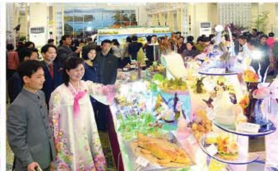
The second sweets sculpture exhibition.